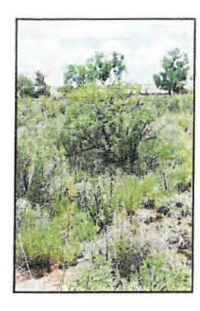
Type 6S- Short Shrub Stands.

underneath the woody vegetation. Photograph on San Francisco River by Y. Chauvin, 2012.