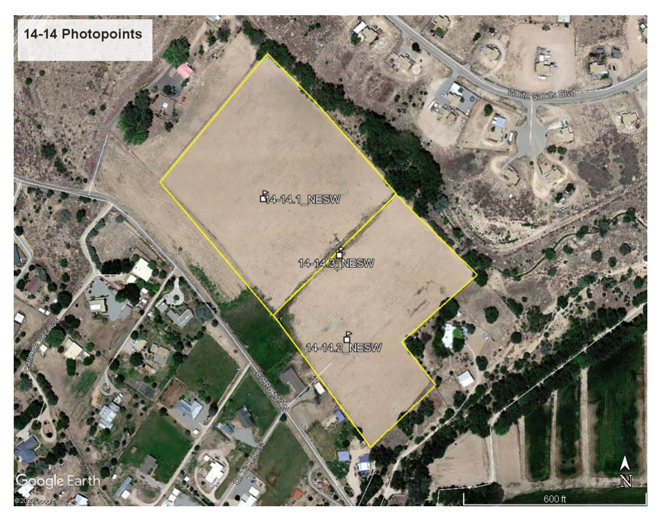
Figure 2. 14-14 Rancho Las Lagunas photopoints.