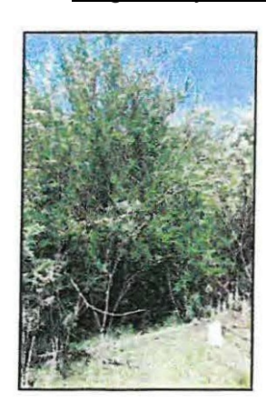
Type 5 - Tall Shrub Stands.

Young tree and shrub layer only (15-5 m [4.5-15 feet]) covering >25% of the area of the community (polygon). Stands dominated by tall shrubs and young trees, may include herbaceous vegetation