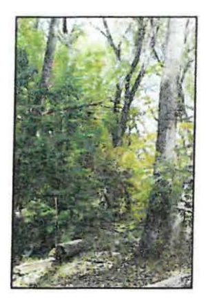
Type 1 – High Structure Forest with a well-developed understory.

Multiple-Story Communities (Woodlands/Forests)