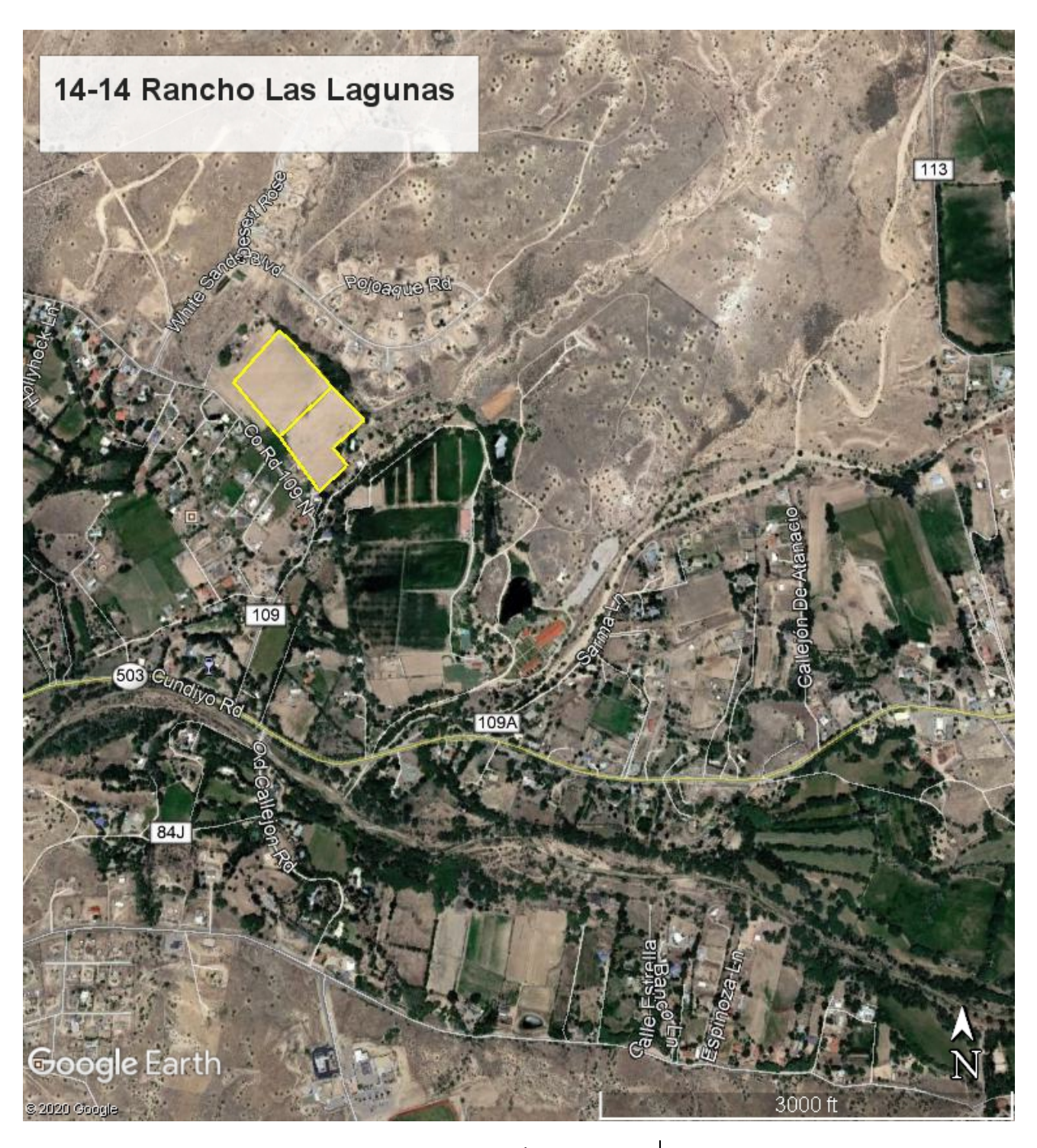
Figure 1. 14-14 Rancho Las Lagunas