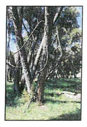
Type 2-Low Structure Forest with little or no understory.

Tall mature to intermediate-aged trees (>5 m [>15 feet]) with canopy covering >25% of the area of the community (polygon)and understory layer (0-5 m [0-15 feet]) covering >25% of the area of the community (polygon). Substantial foliage is in all height layers. (This type incorporates Hink and Ohmart structure types 1 and 3.) Photograph on Gila River by Y. Chauvin, 2012.