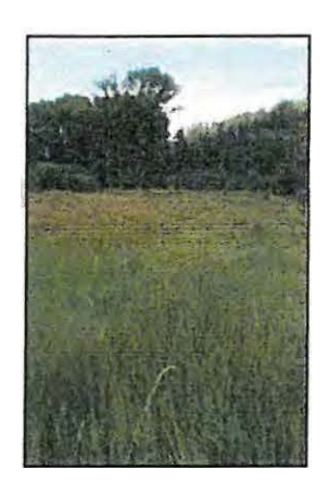
Type 6W- Herbaceous Wetland.

4.5 feet]) covering >10% of the area of the community (polygon). Stands dominated by short woody vegetation, may include herbaceous vegetation underneath the woody vegetation. Photograph on Lower Pecos River by E. Lindahl, 2008.