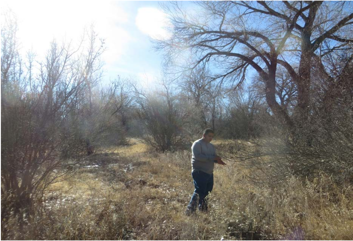
14.22_3, facing south (2015 above, 2019 below)