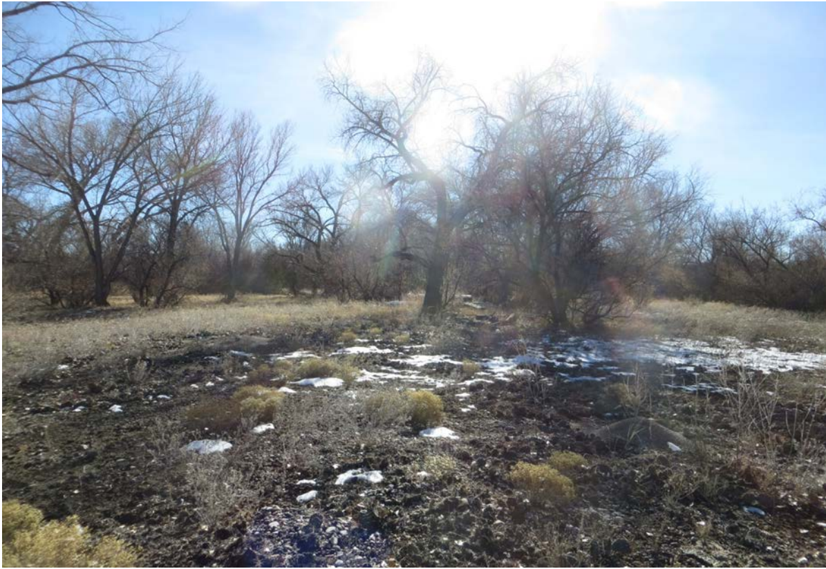
14.22_2, facing south (2015 above, 2019 below)