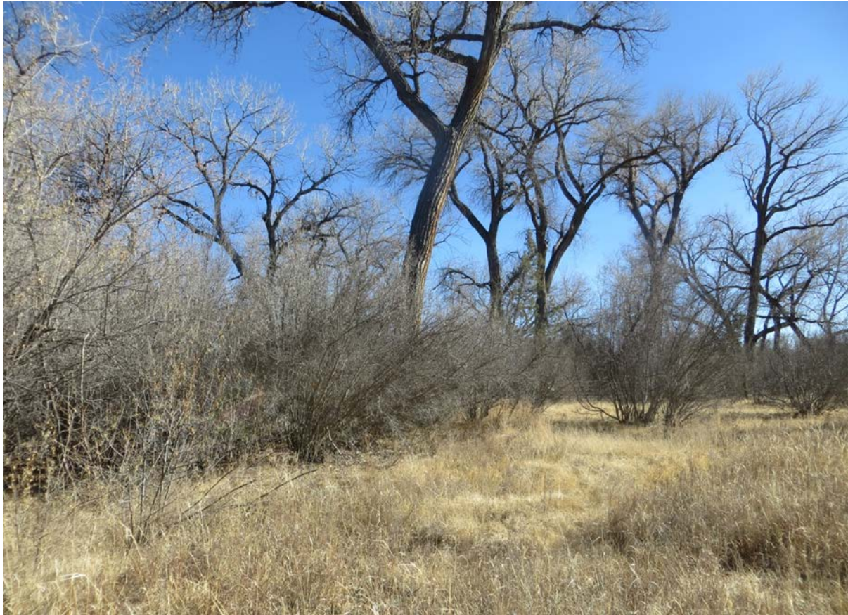
14.22_3, facing east (2015 above, 2019 below)