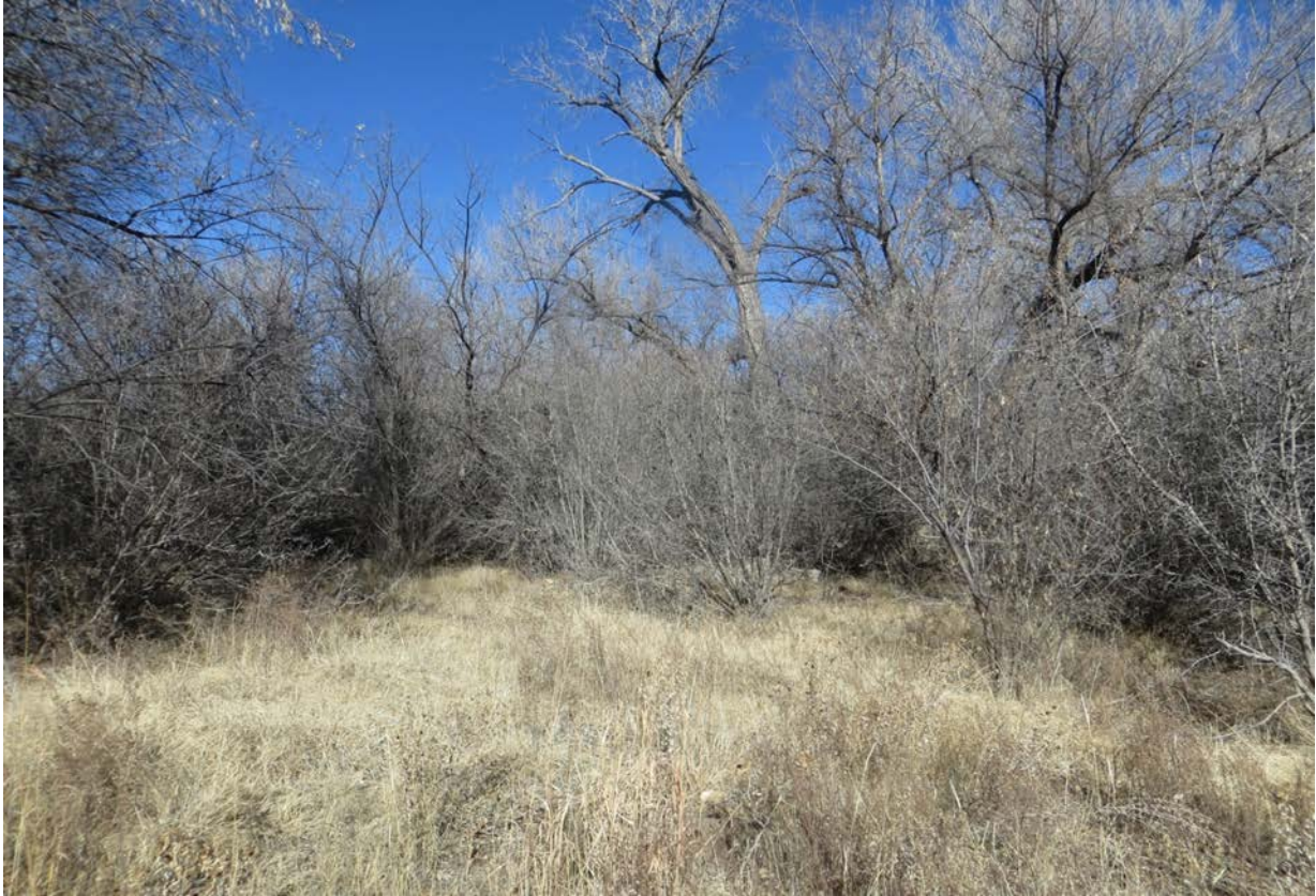
14.22_3, facing north (2015 above, 2019 below)