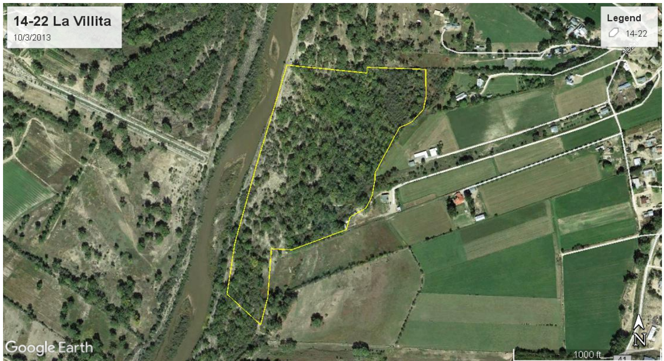
Pre-treatment imagery (2013 above, no imagery for 2014 found)