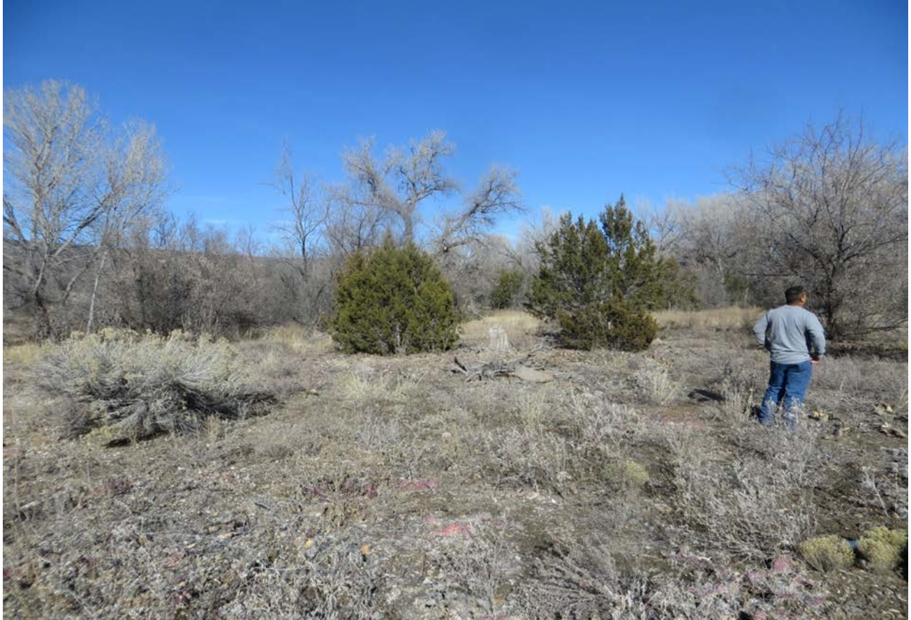
14.22_2, facing north (2015 above, 2019 below)