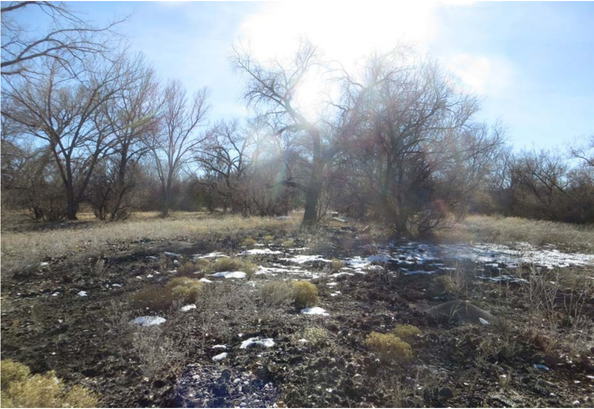
14.22_2, facing south (2015 above, 2019 below)