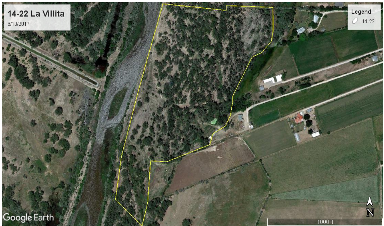
Post-treatment imagery (2017 above, most recent as of 5/27/2020)