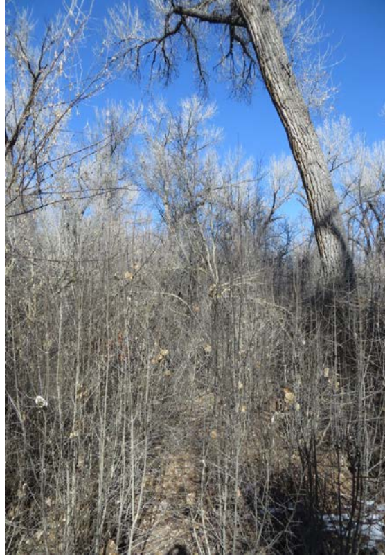
14.22_1, facing west (2015 above, 2019 below)