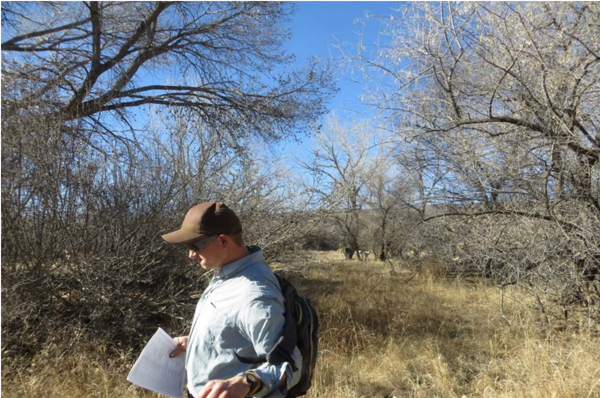
14.22_3, facing west (2015 above, 2019 below)