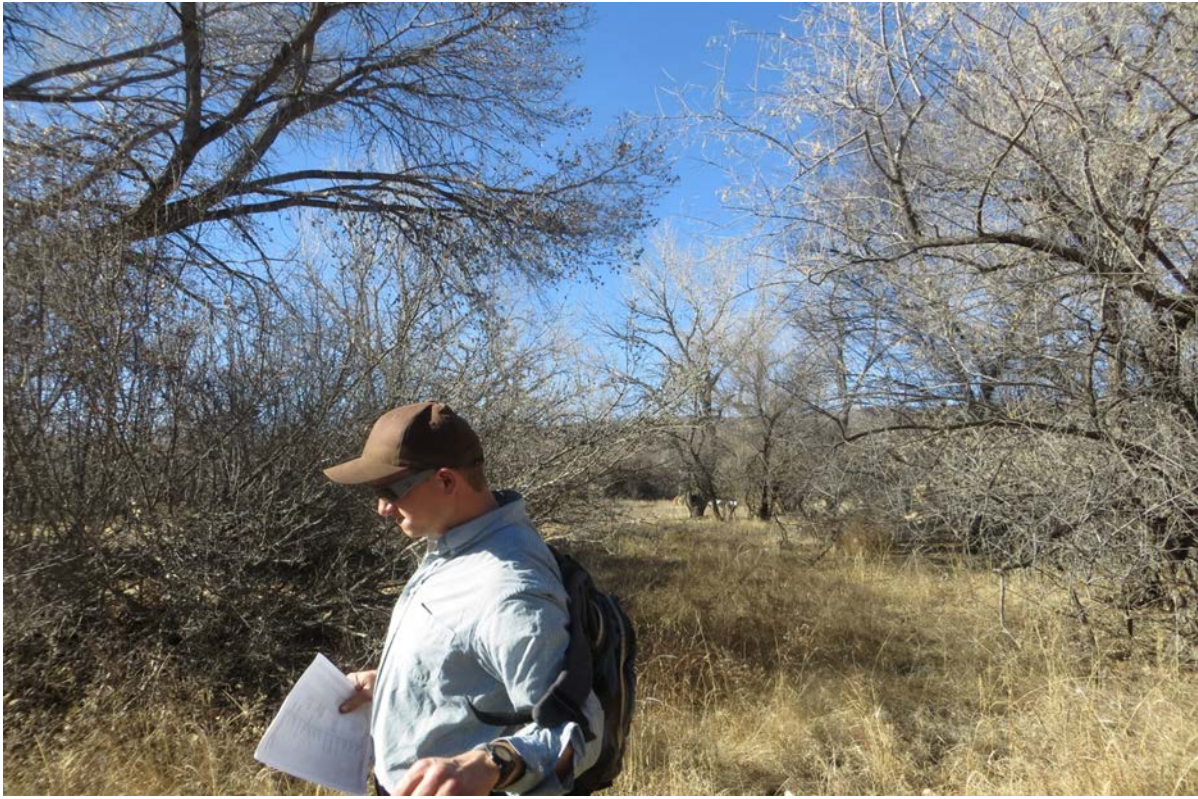
14.22_3, facing west (2015 above, 2019 below)