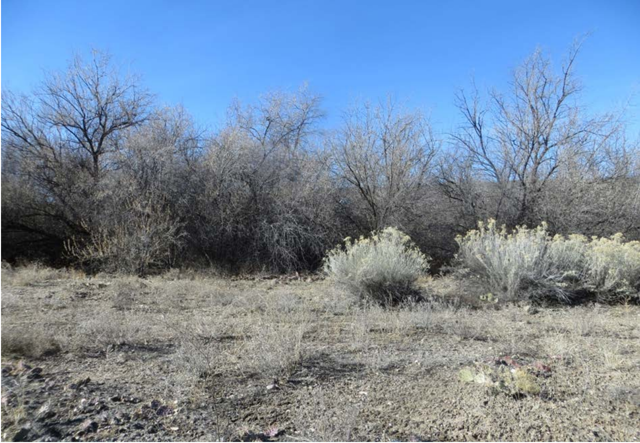
14.22_2, facing west (2015 above, 2019 below)