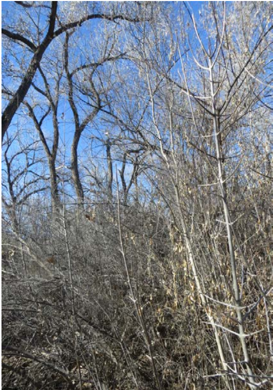
14.22_1, facing south (2015 above, 2019 below)