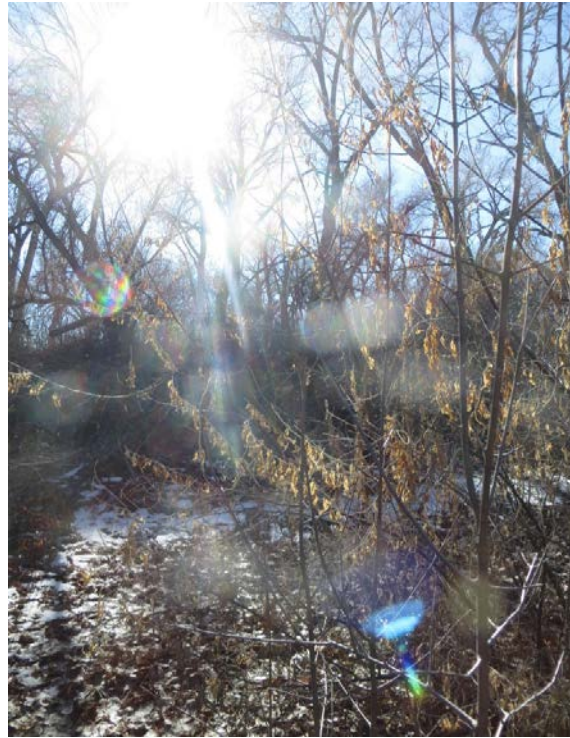
14.22_1, facing east (2015 above, 2019 below)