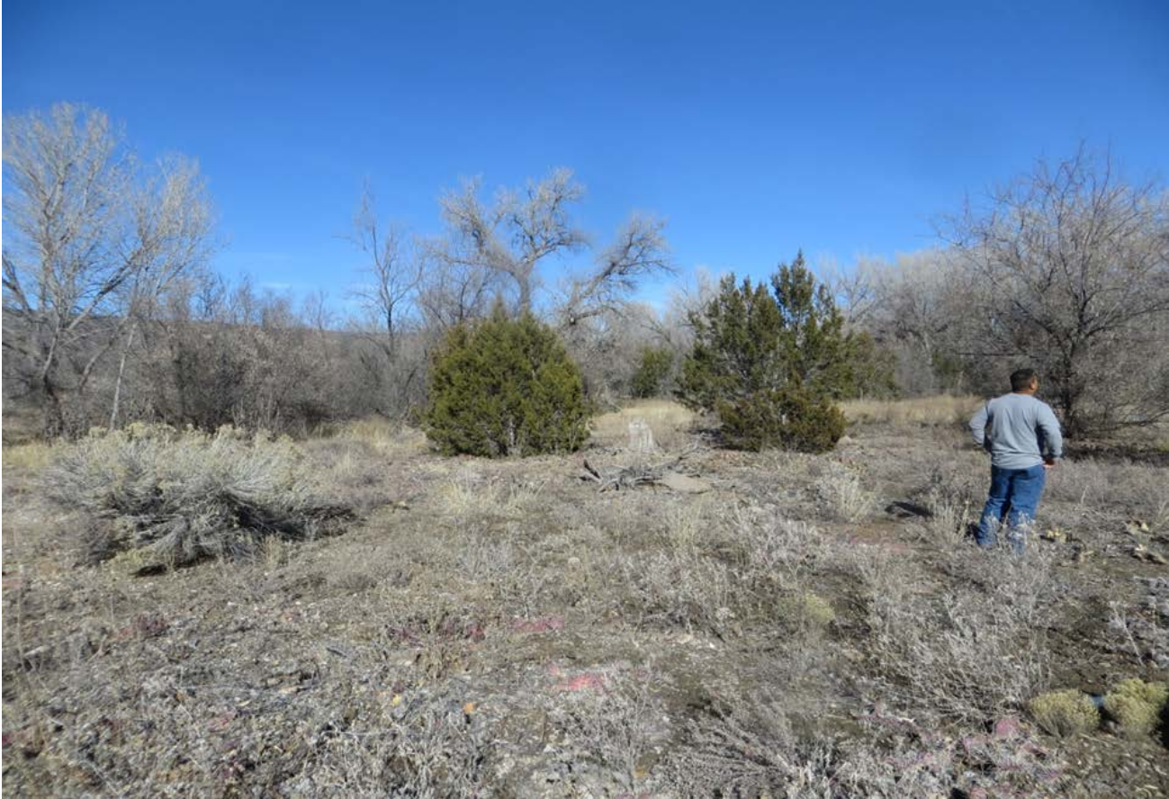
14.22_2, facing north (2015 above, 2019 below)