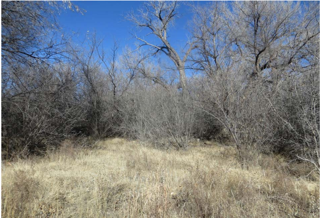
14.22_3, facing north (2015 above, 2019 below)