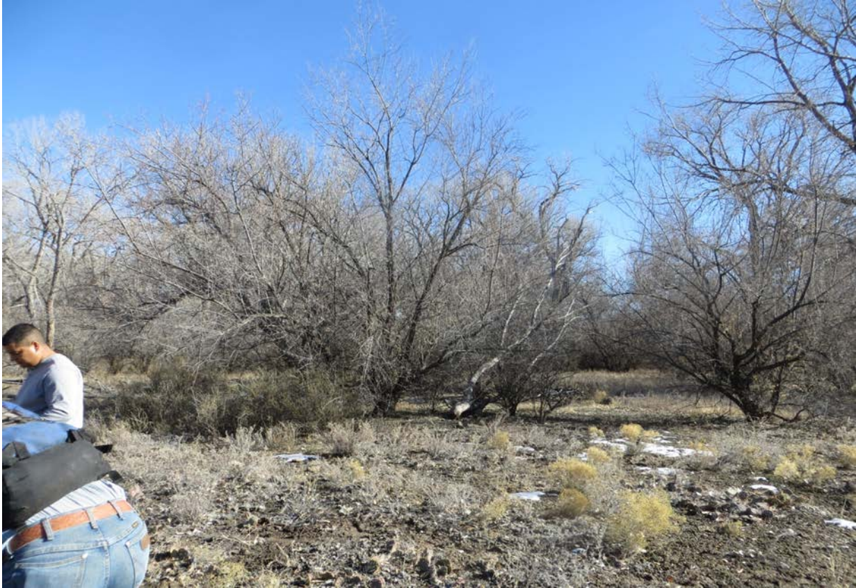
14.22_2, facing east (2015 above, 2019 below)