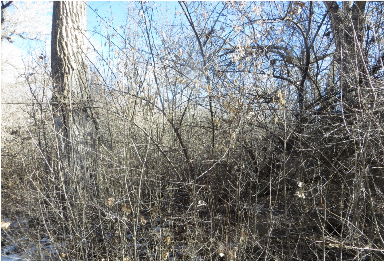
14.22_1, facing north (2015 above, 2019 below)