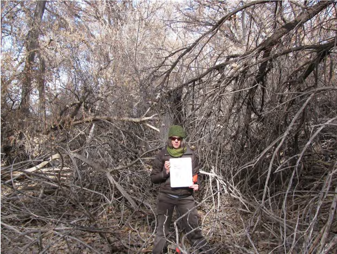
B2_1N, facing north from center (2012 above, 2016 below)