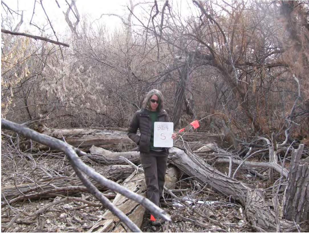
B2_4S, facing south from center (2012 above, 2016 below)