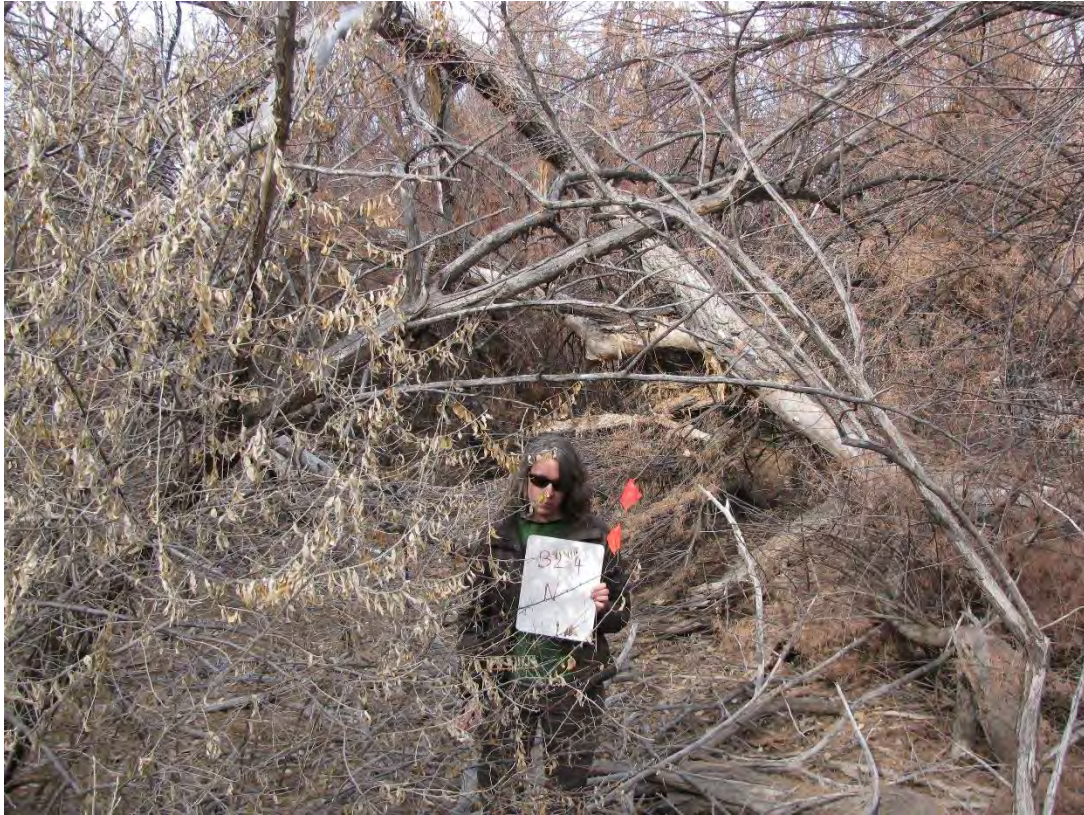
B2_4N, facing north from center (2012 above, 2016 below)