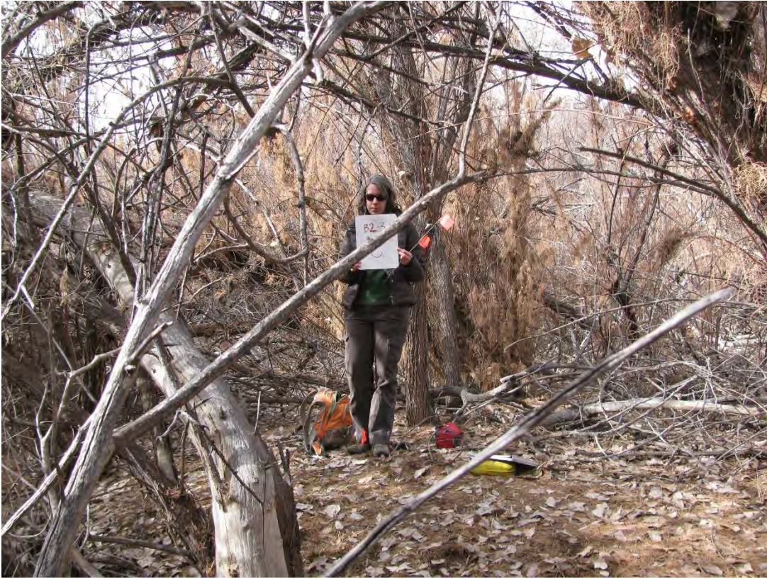
B2_3C, facing center from as close to 66 feet as visually possible (2012 above, 2016 below)