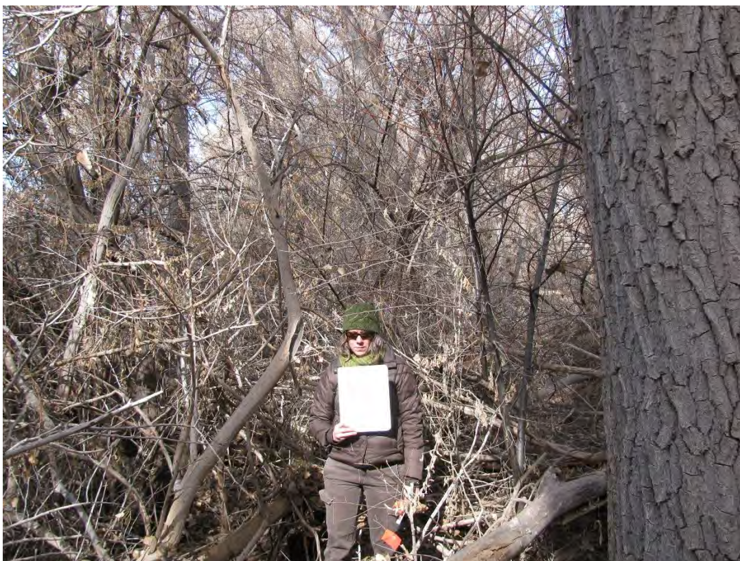
B2_2N, facing north from plot center (2012 above, 2016 below)