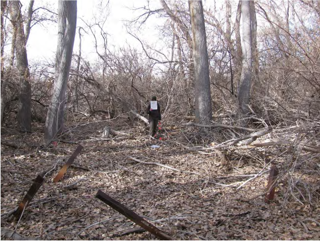
B2_2C, facing center from as close to 66 feet as visually possible (2012 above, 2016 below)