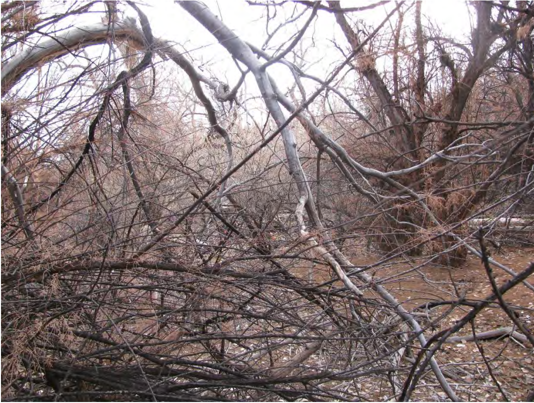
B2_4C, facing center from as close to 66 feet as visually possible (2012 above, 2016 below)