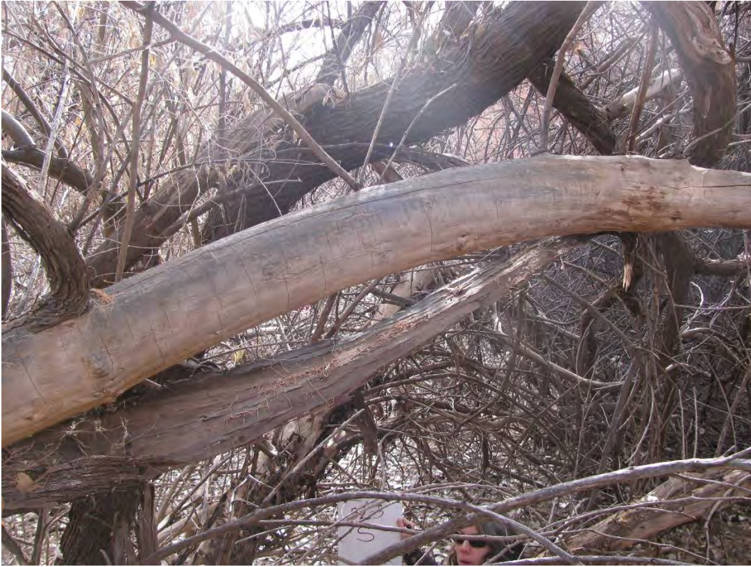
B2_3S, facing south from center (2012 above, 2016 below)