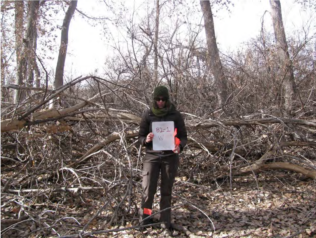
B2_1W, facing west from center (2012 above, 2016 below)