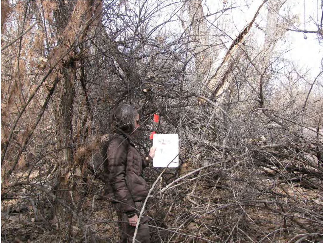
B2_3N, facing north from center (2012 above, 2016 below)