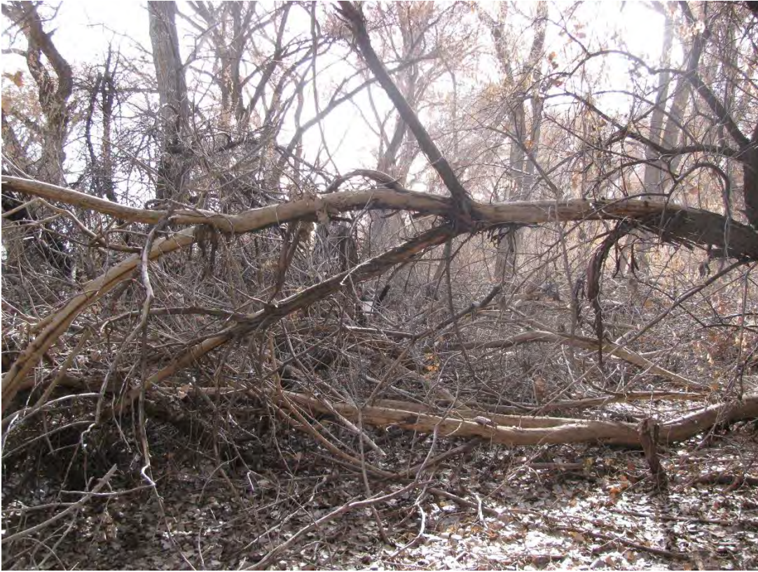
B2_1C, facing center from as close to 66 feet as visually possible (2012 above, 2016 below)