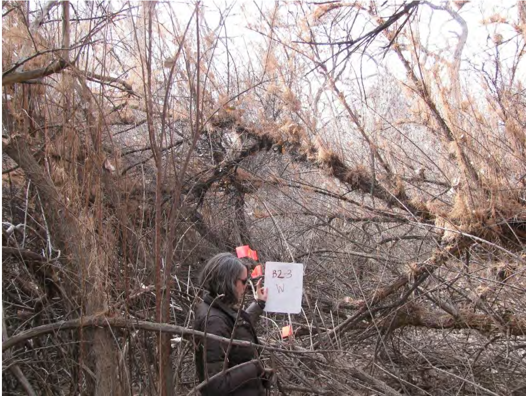
B2_3W, facing west from center (2012 above, 2016 below)