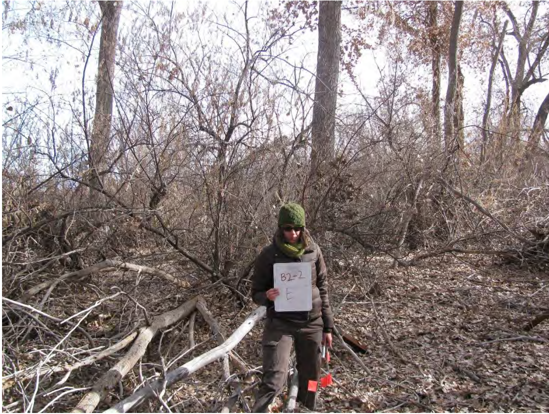
B2_2E, facing east from center (2012 above, 2016 below)