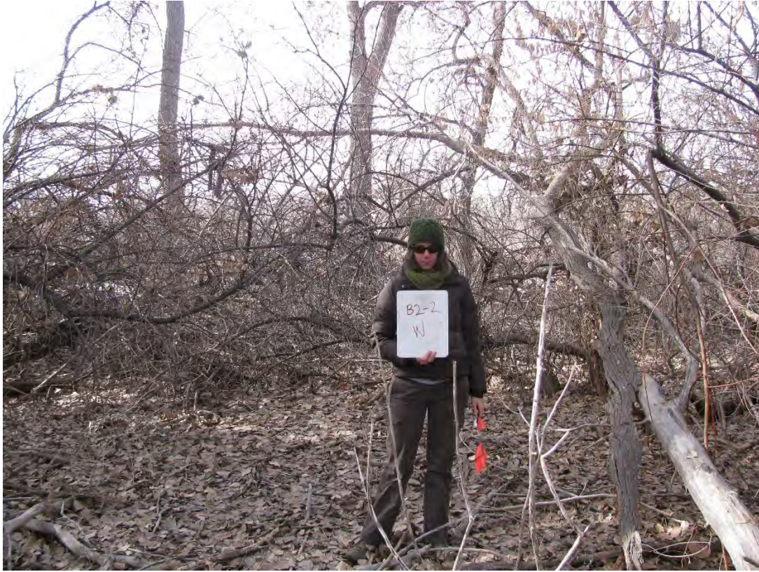
B2_2W, facing west from center (2012 above, 2016 below)