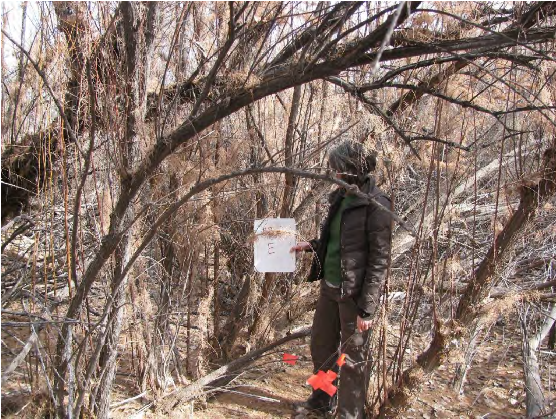
B2_3E, facing east from center (2012 above, 2016 below)