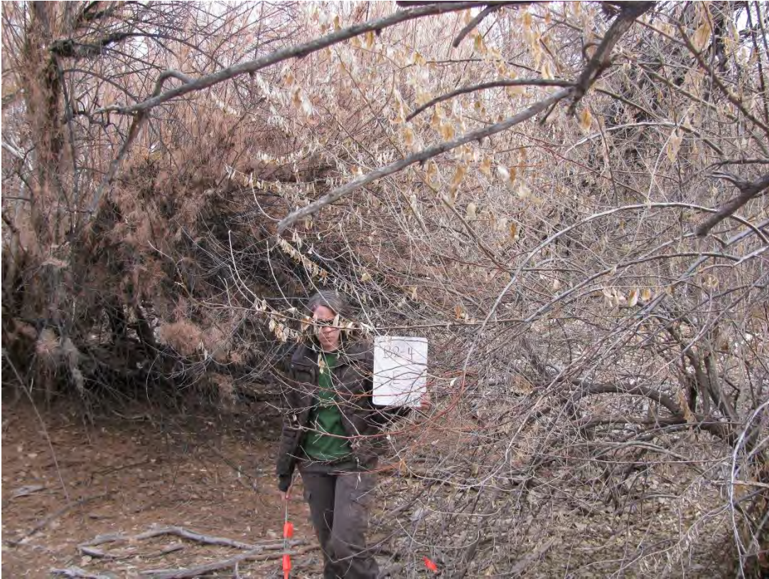
B2_4E, facing east from center (2012 above, 2016 below)