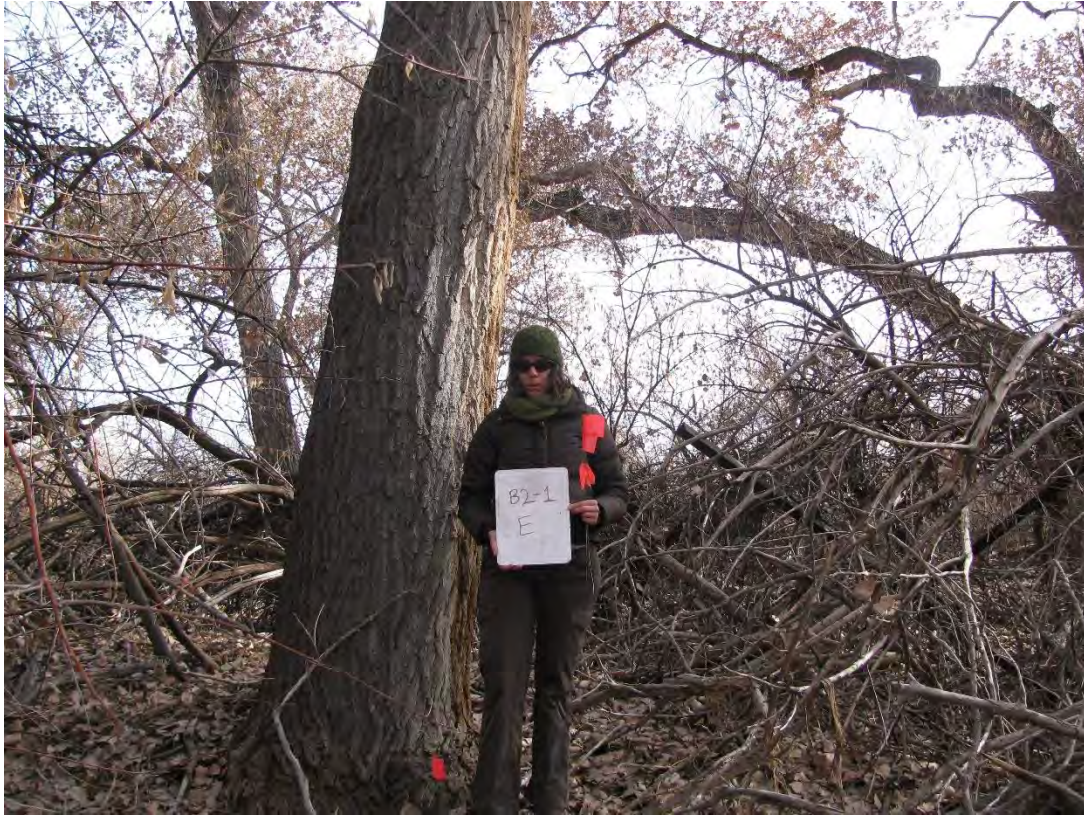
B2_1E, facing east from plot center (2012 above, 2016 below)