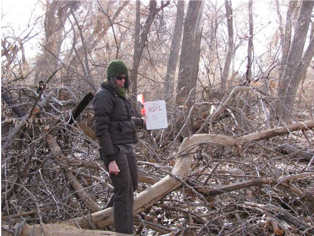
B2_1S, facing south from center (2012 above, 2016 below)