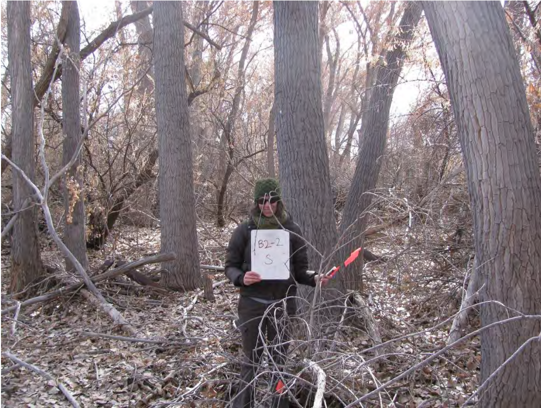
B2_2S, facing south from plot center (2012 above, 2016 below)