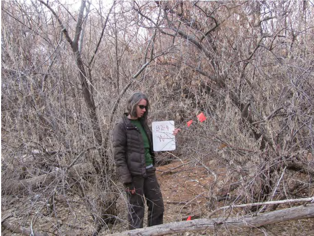
B2_4W, facing west from center (2012 above, 2016 below)