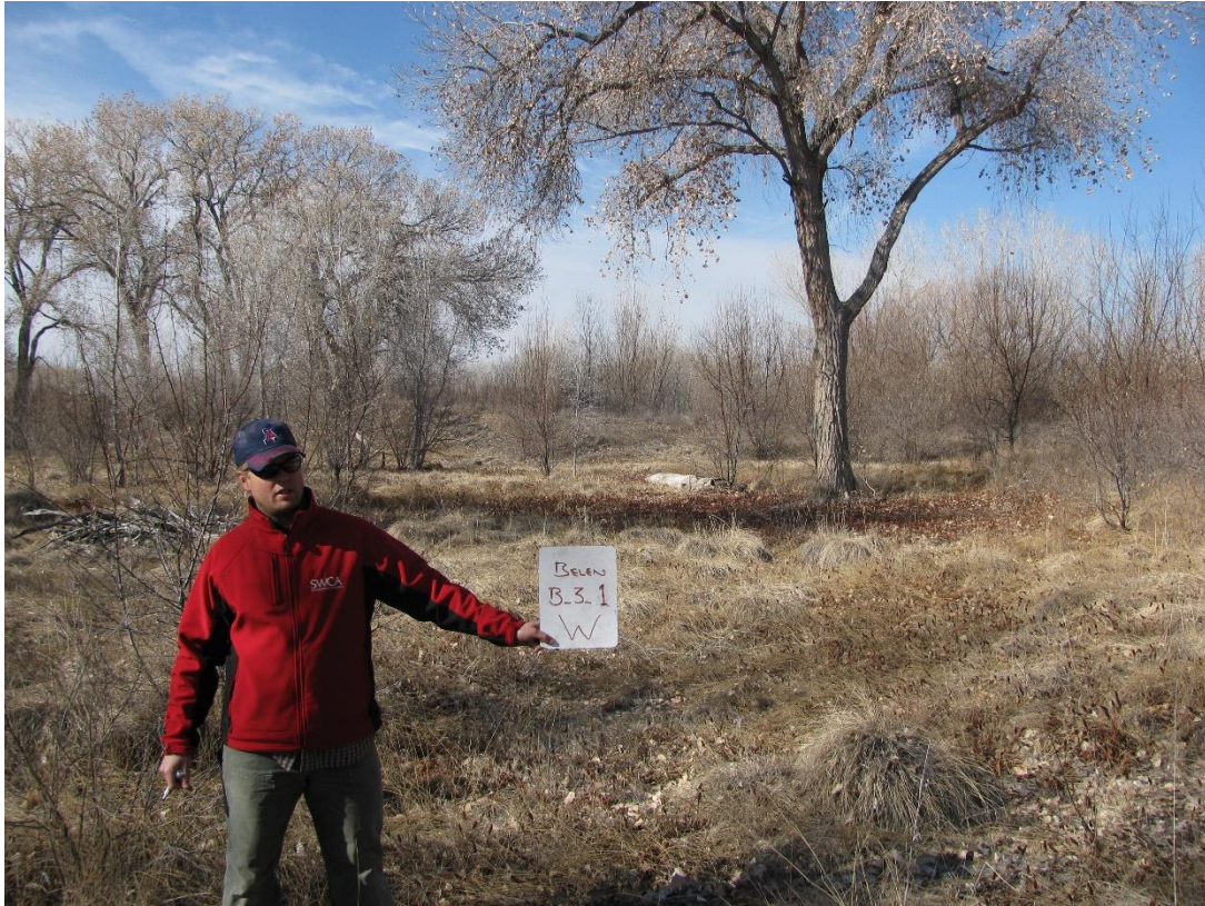
B3_1W, facing west from center (2012 above, 2016 below)