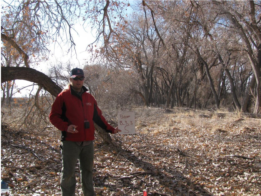
B3_3S, facing south from center (2012 above, 2016 below)