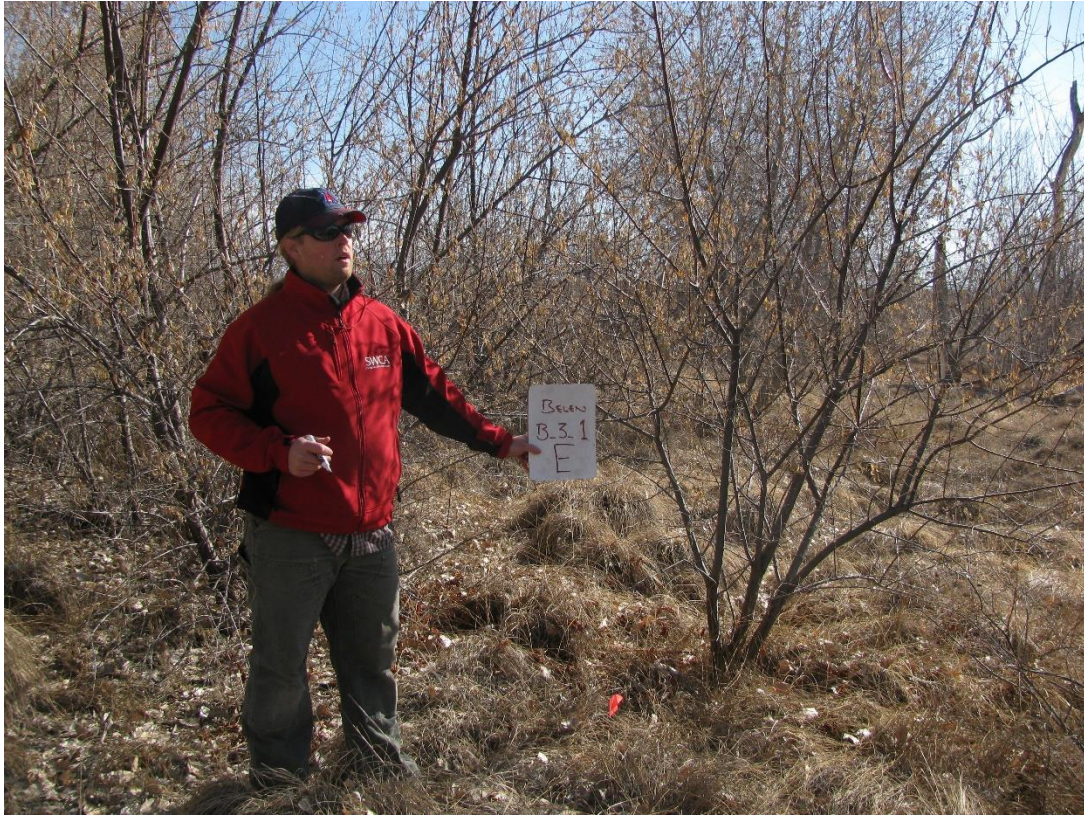
B3_1E, facing east from plot center (2012 above, 2016 below)