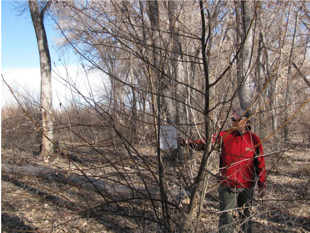
B3_2N, facing north from plot center (2012 above, 2016 below)