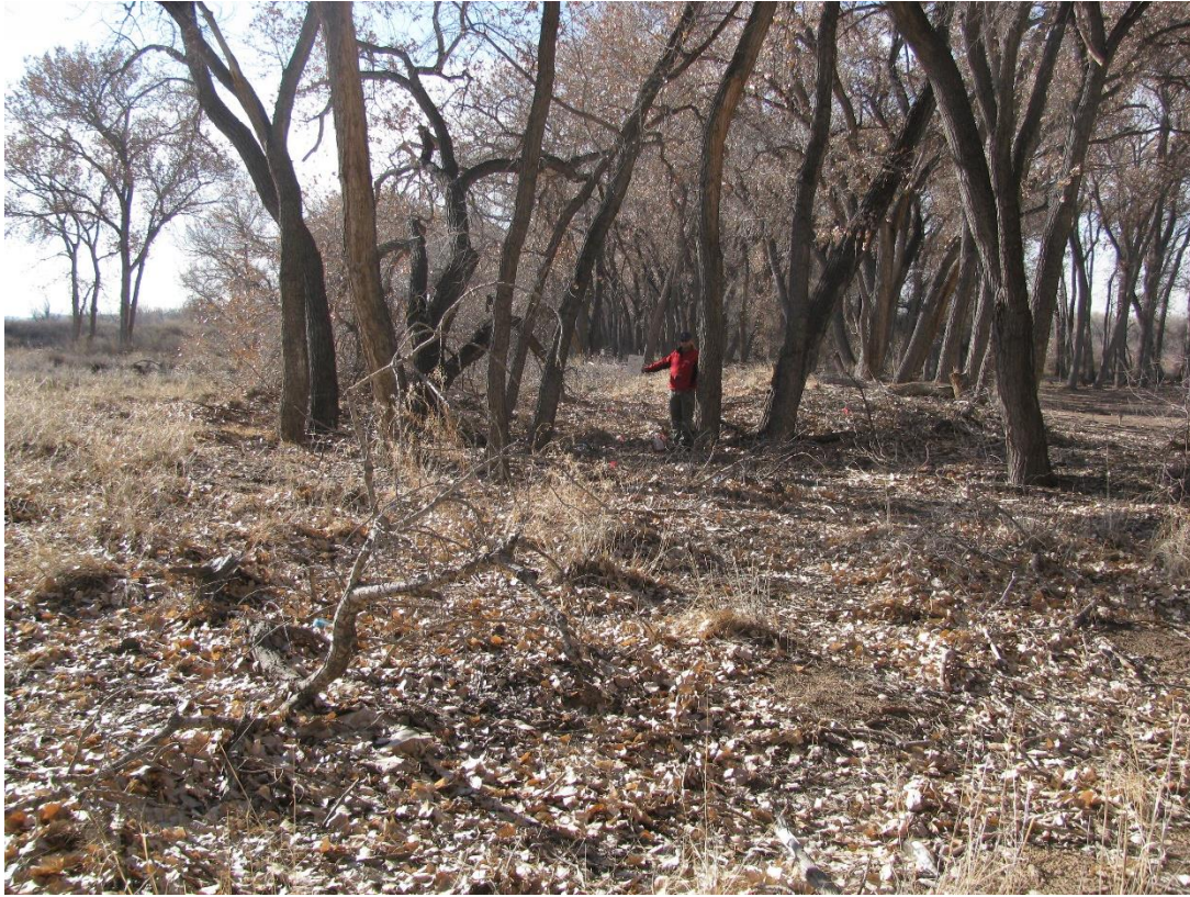
B3_3C, facing center from as close to 66 feet as visually possible (2012 above, 2016 below)