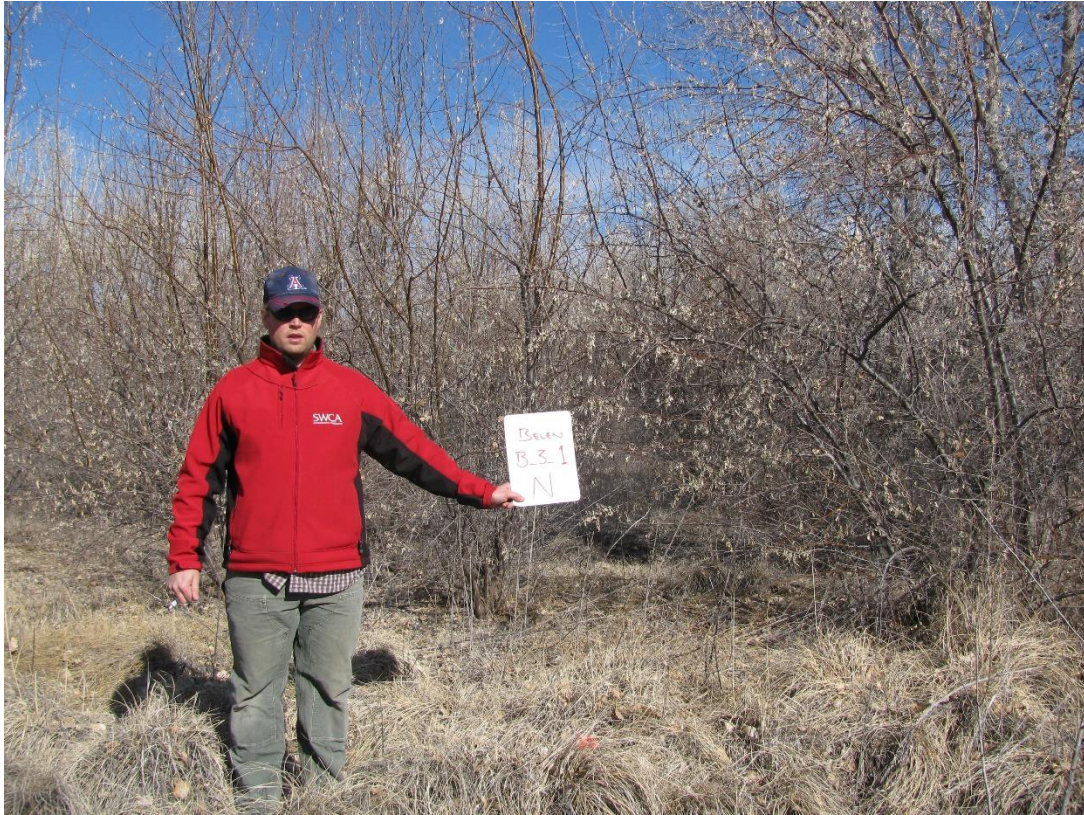
B3_1N, facing north from center (2012 above, 2016 below)