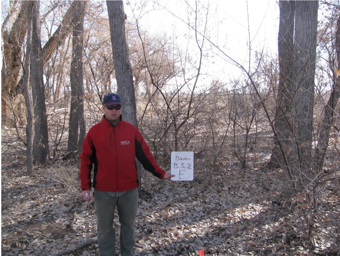
B3_2E, facing east from center (2012 above, 2016 below)