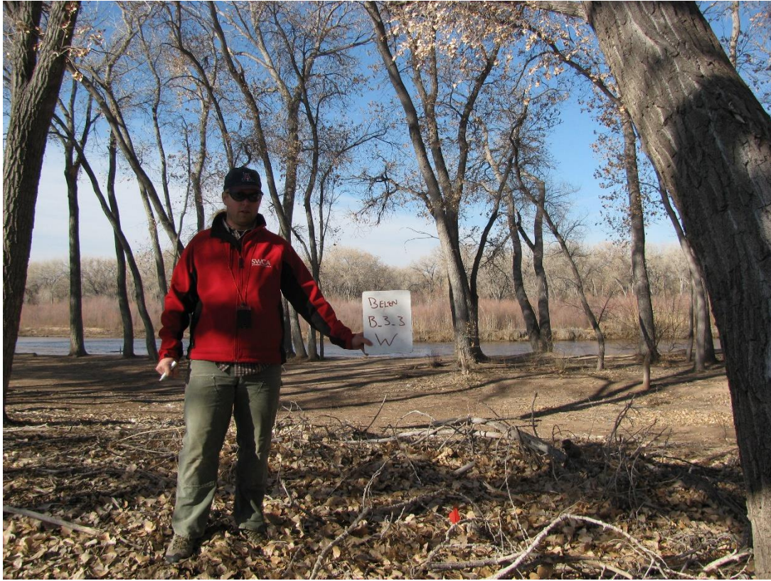
B3_3W, facing west from center (2012 above, 2016 below)