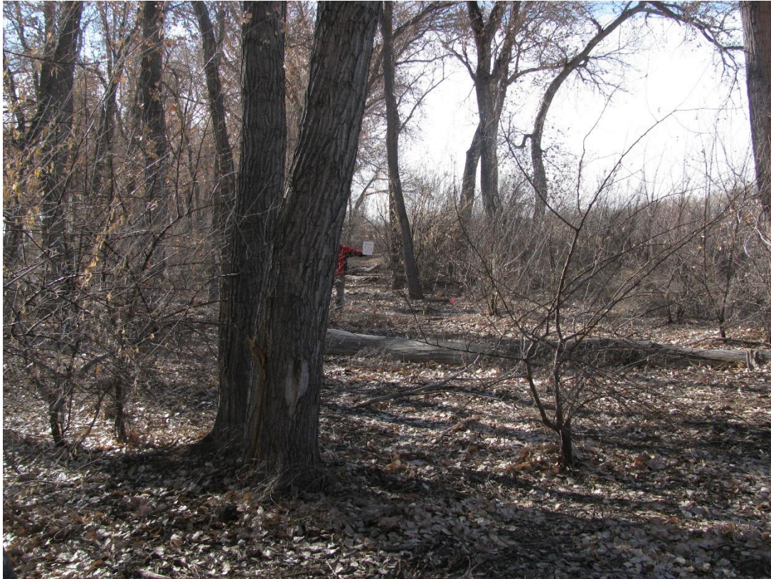
B3_2C, facing center from as close to 66 feet as visually possible (2012 above, 2016 below)