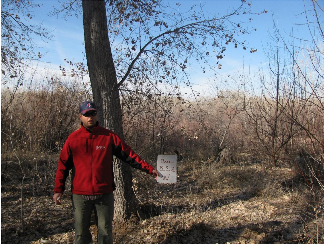
B3_2W, facing west from center (2012 above, 2016 below)