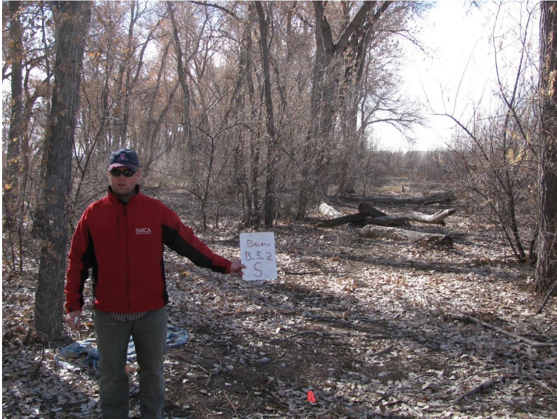
B3_2S, facing south from plot center (2012 above, 2016 below)