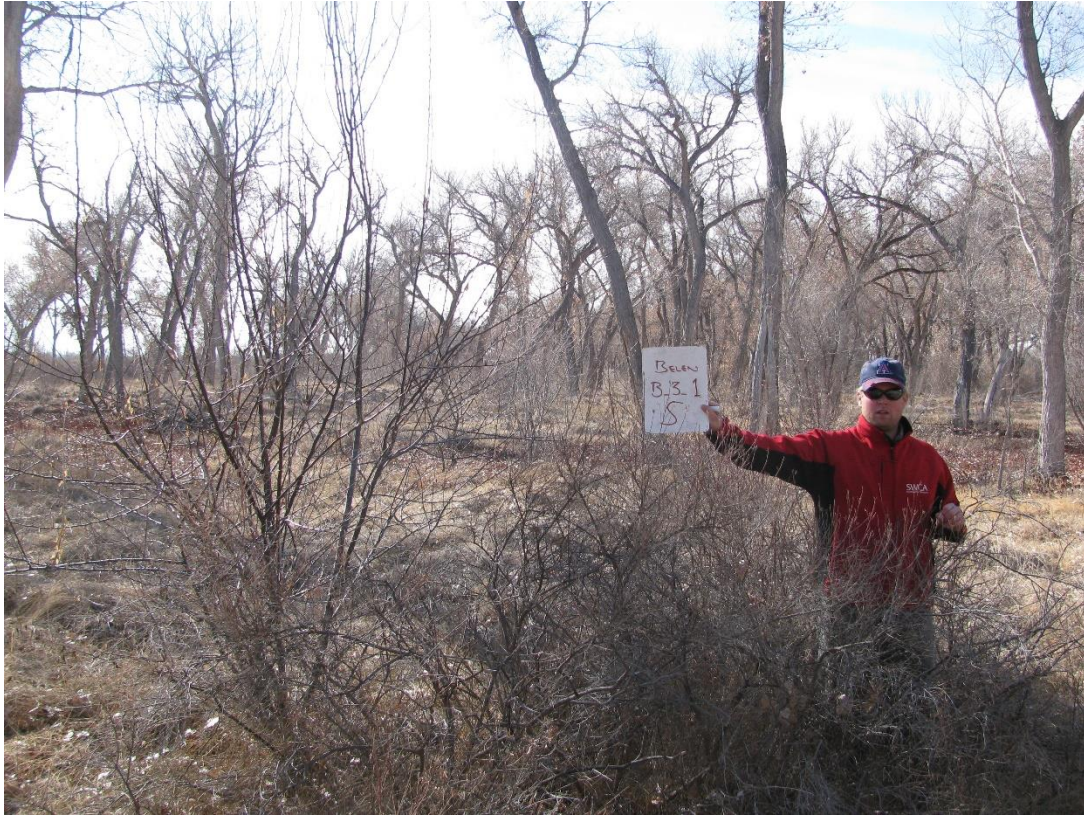
B3_1S, facing south from center (2012 above, 2016 below)