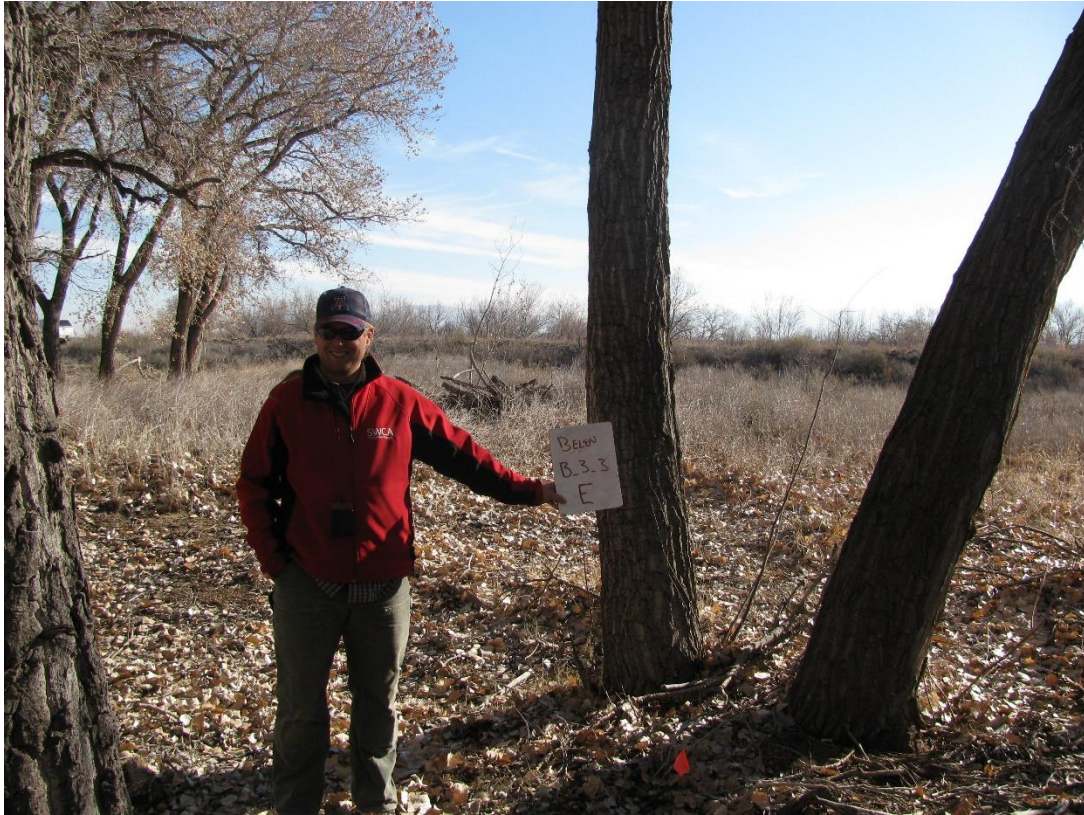
B3_3E, facing east from center (2012 above, 2016 below)