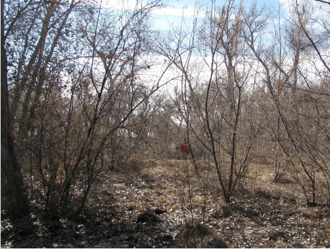
B3_1C, facing center from as close to 66 feet as visually possible (2012 above, 2016 below)