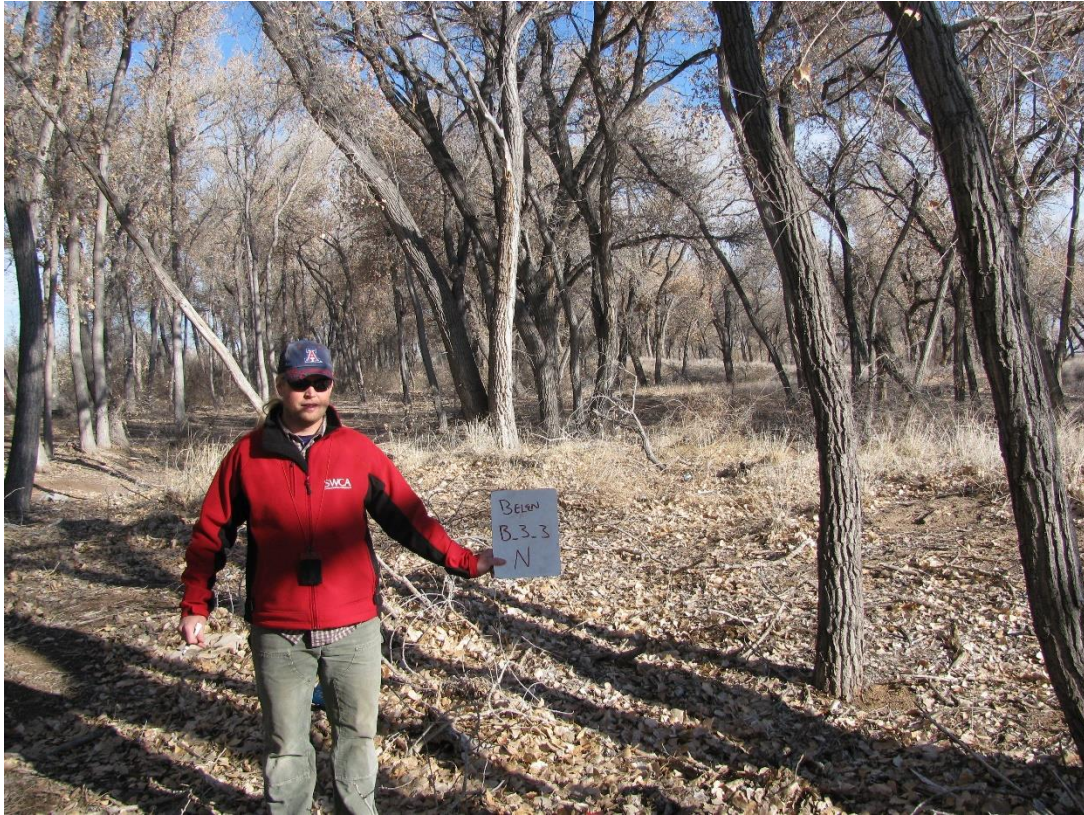
B3_3N, facing north from center (2012 above, 2016 below)