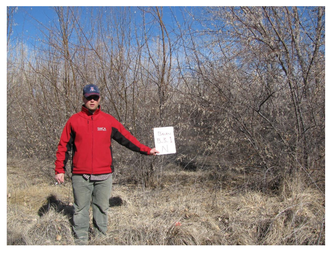
B3_1N, facing north from center (2012 above, 2016 below)