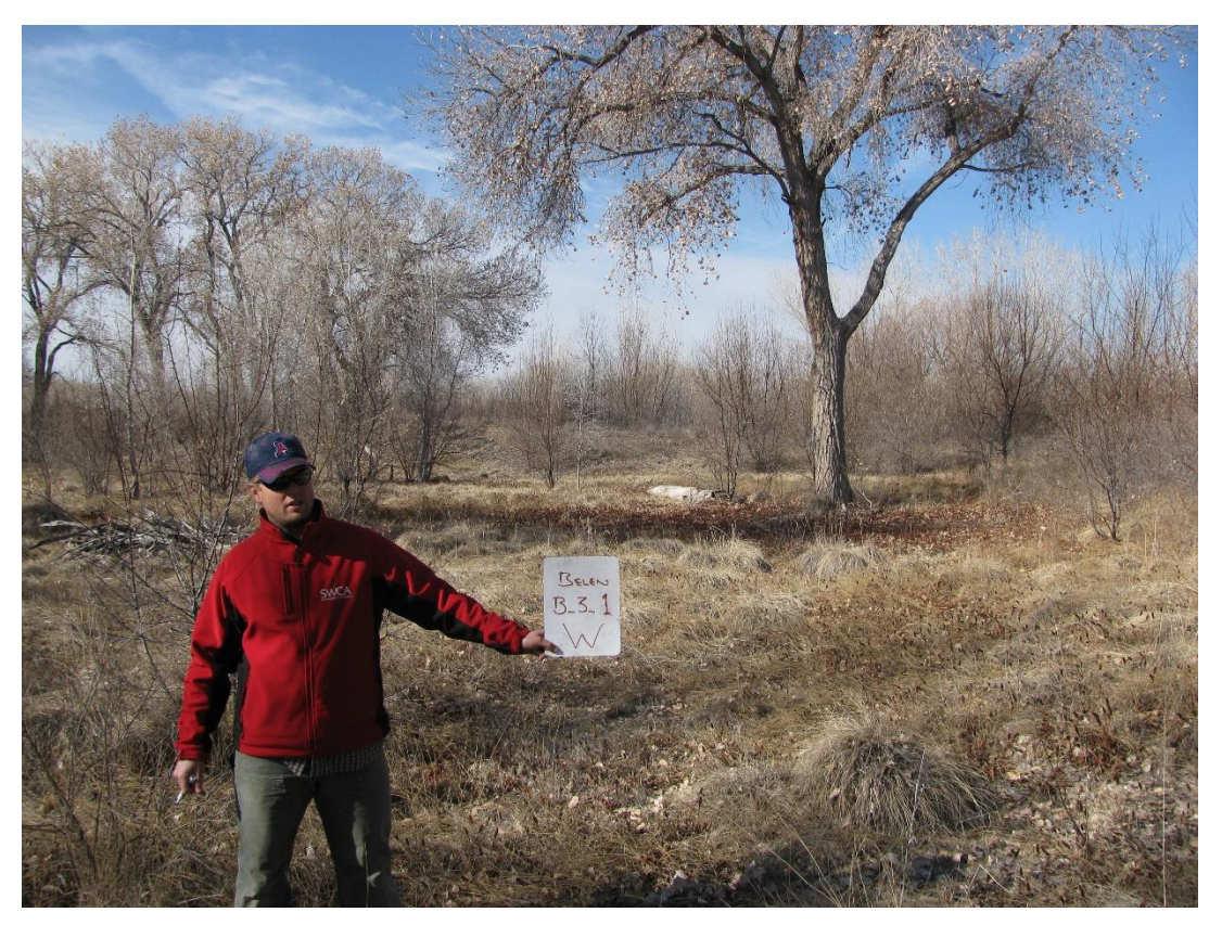
B3_1W, facing west from center (2012 above, 2016 below)