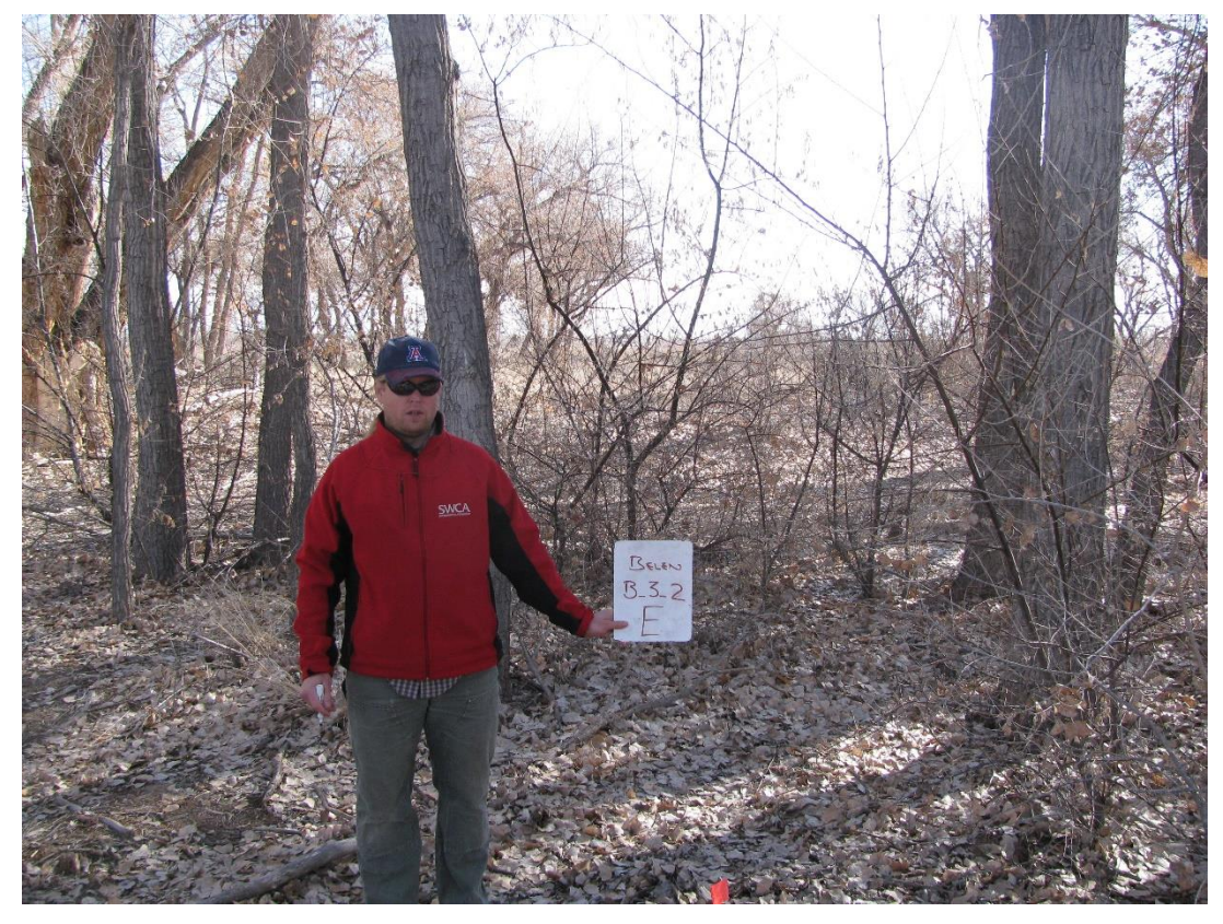
B3_2E, facing east from center (2012 above, 2016 below)