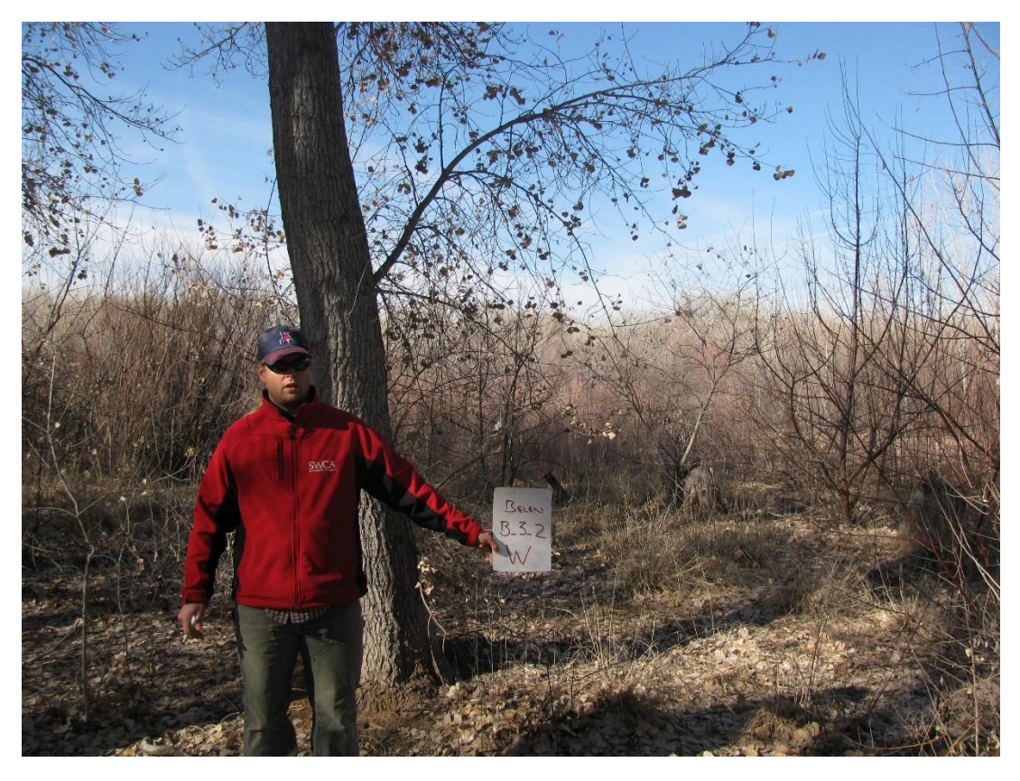
B3_2W, facing west from center (2012 above, 2016 below)