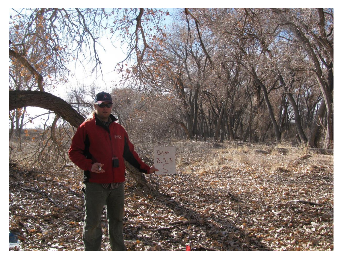
B3_3S, facing south from center (2012 above, 2016 below)