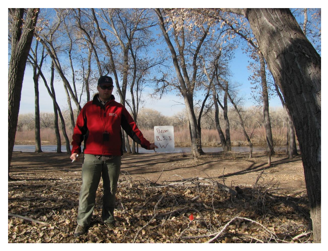
B3_3W, facing west from center (2012 above, 2016 below)