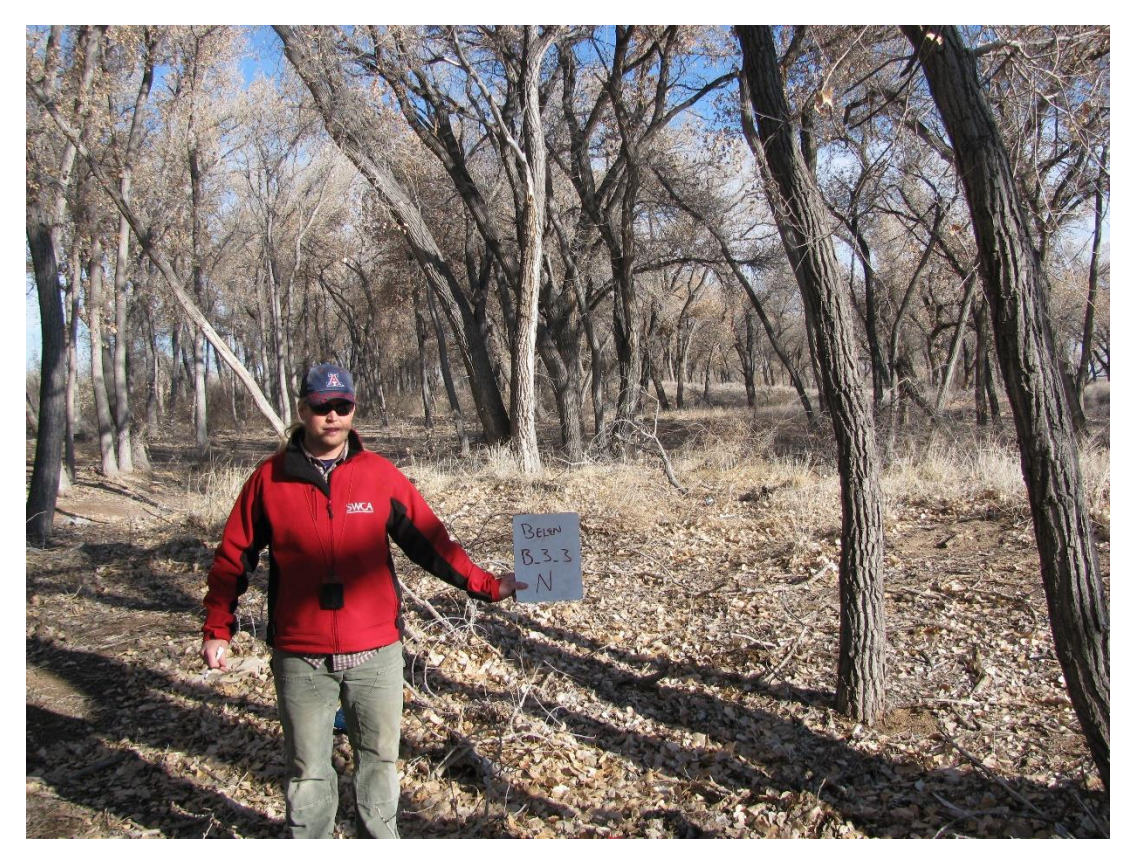
B3_3N, facing north from center (2012 above, 2016 below)