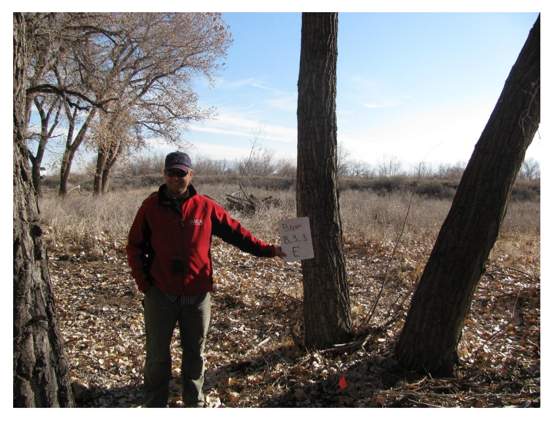
B3_3E, facing east from center (2012 above, 2016 below)