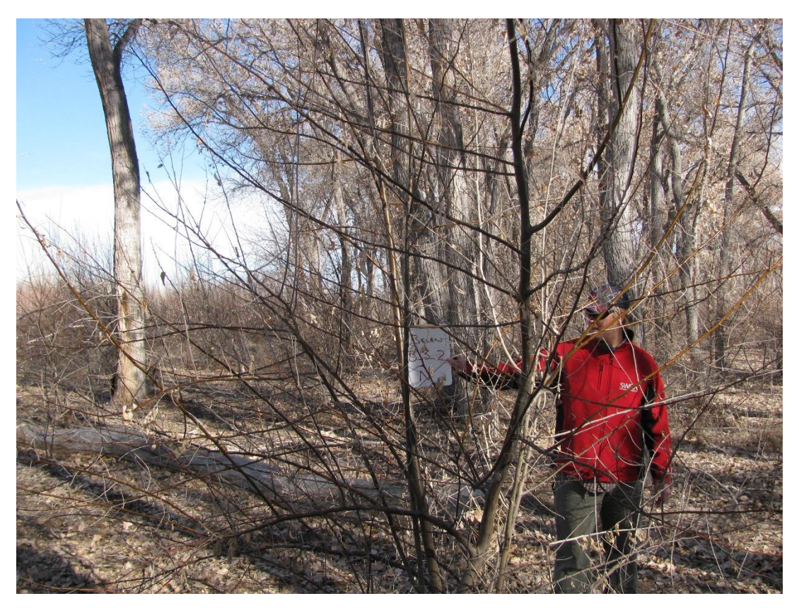
B3_2N, facing north from plot center (2012 above, 2016 below)