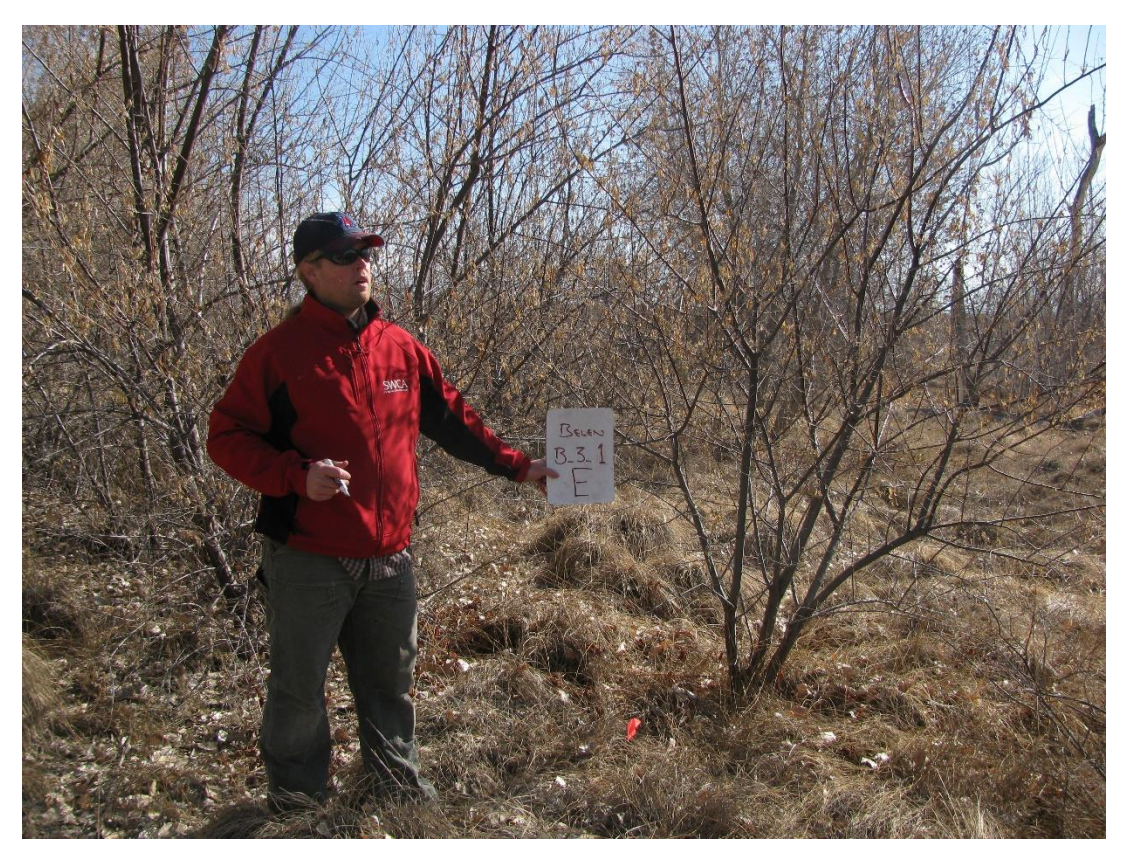
B3_1E, facing east from plot center (2012 above, 2016 below)