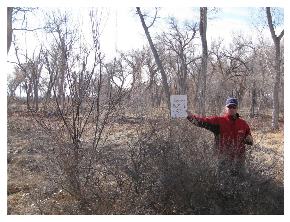
B3_1S, facing south from center (2012 above, 2016 below)