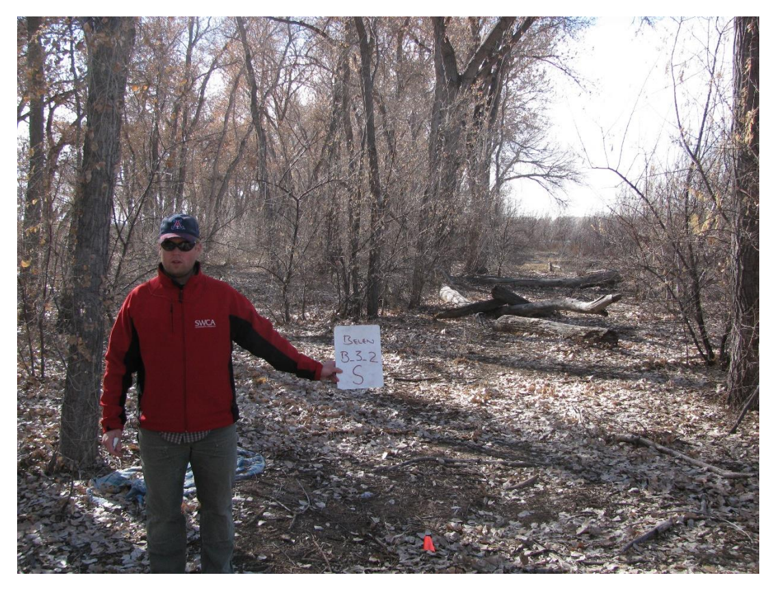
B3_2S, facing south from plot center (2012 above, 2016 below)