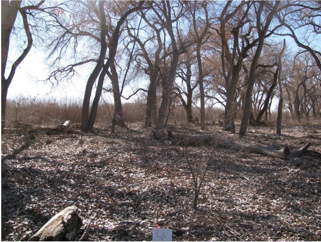
LL_1S, facing south from center (2012 above, 2016 below)