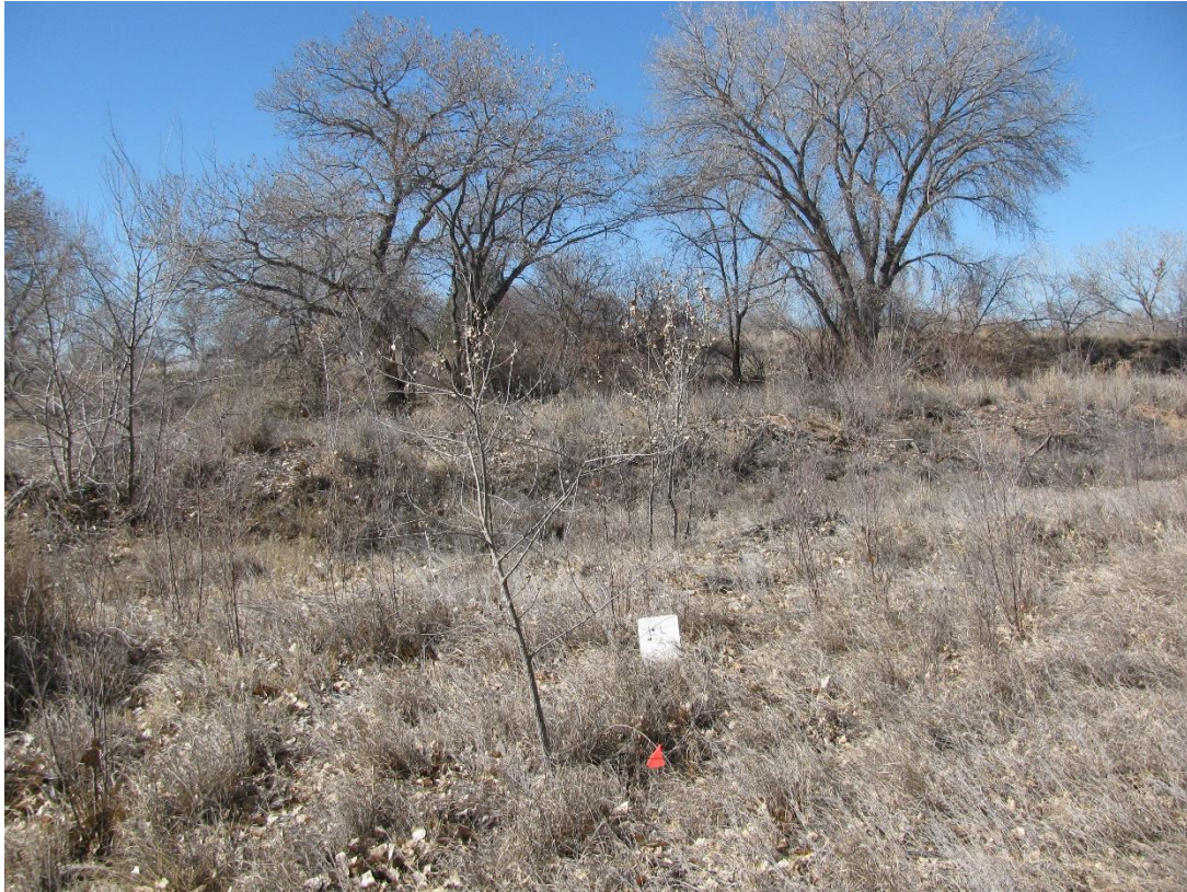
LL_3W, facing west from center (2012 above, 2016 below)