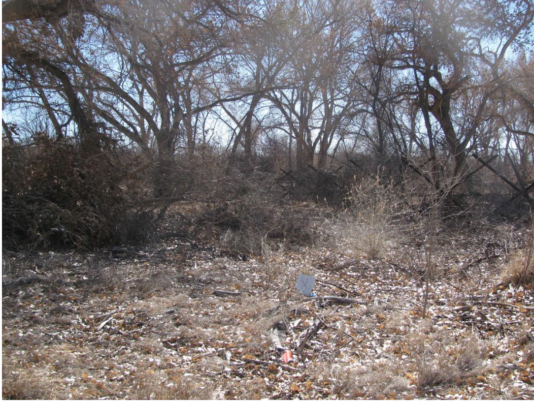
LL_3S, facing south from center (2012 above, 2016 below)