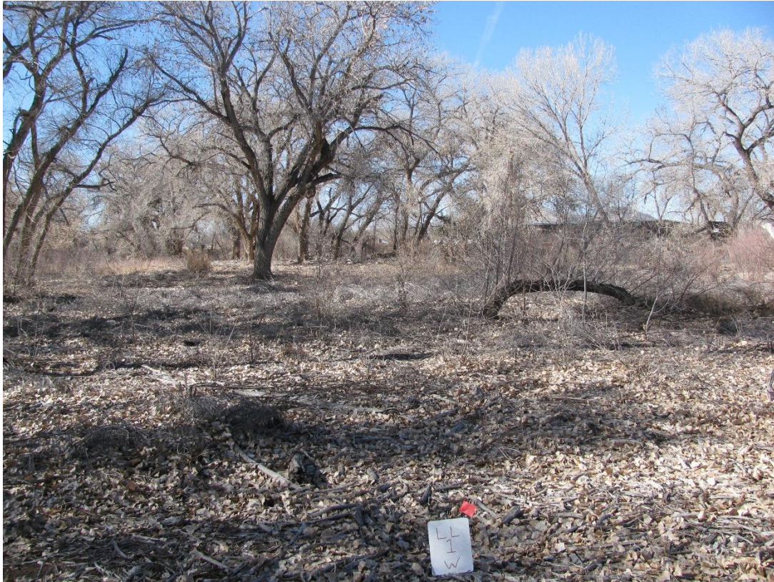
LL_1W, facing west from center (2012 above, 2016 below)