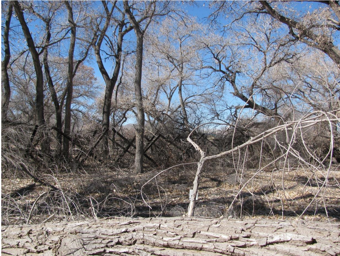
LL_2W, facing west from center (2012 above, 2016 below)