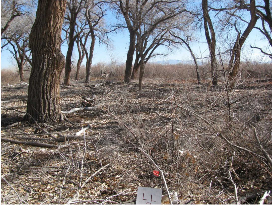
LL_2E, facing east from center (2012 above, 2016 below)