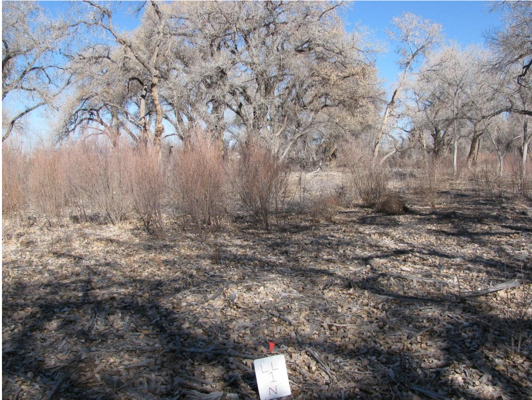
LL_1N, facing north from center (2012 above, 2016 below)