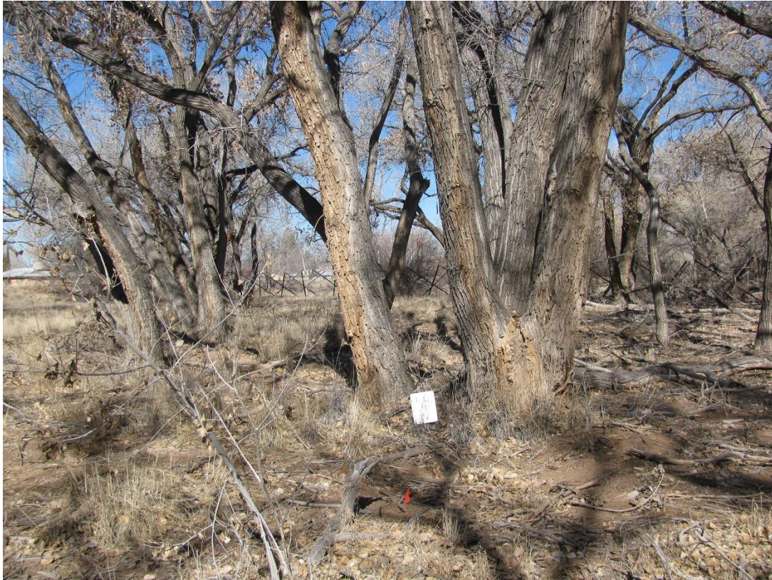
LL_4N, facing north from center (2012 above, 2016 below)