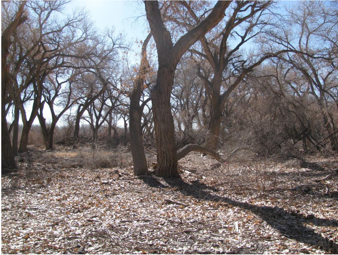
LL_2C, facing center from as close to 66 feet as visually possible (2012 above, 2016 below)