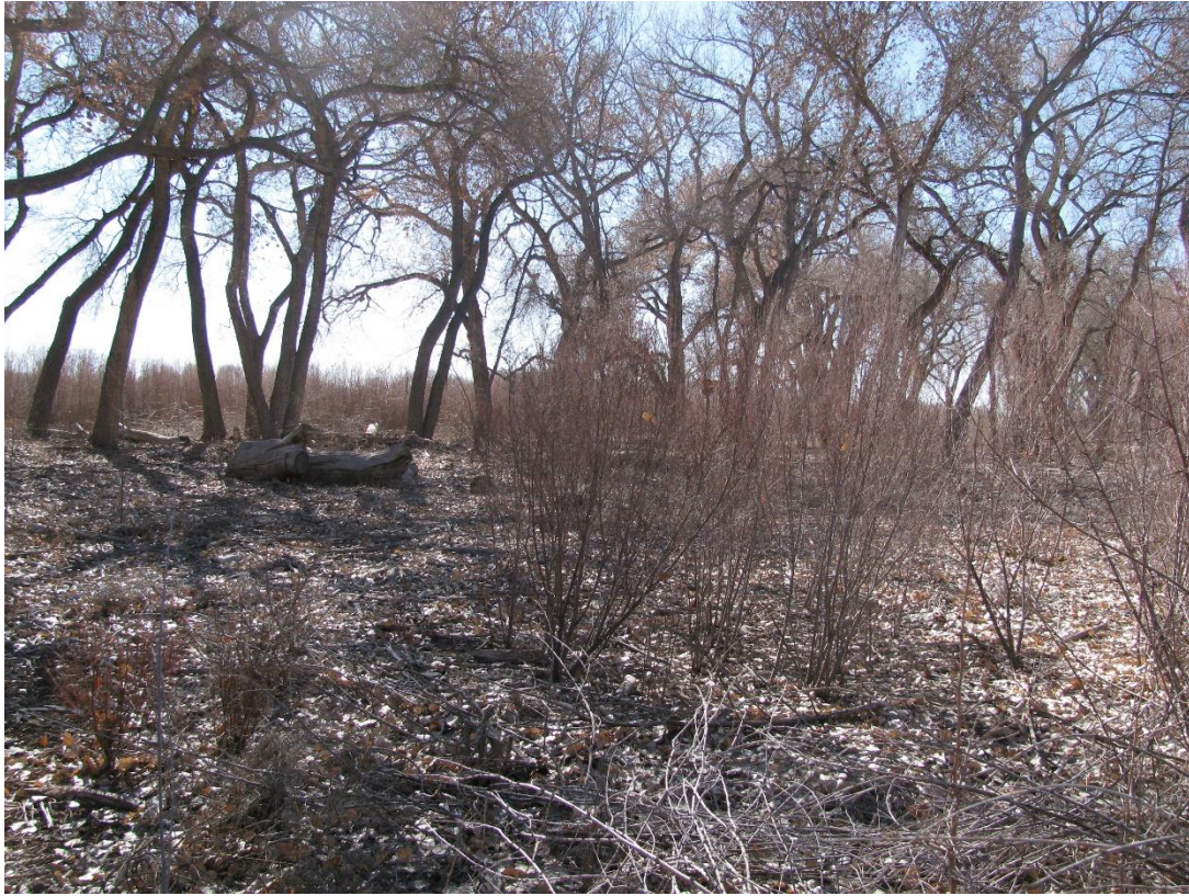
LL_1C, facing center from as close to 66 feet as visually possible (2012 above, 2016 below)