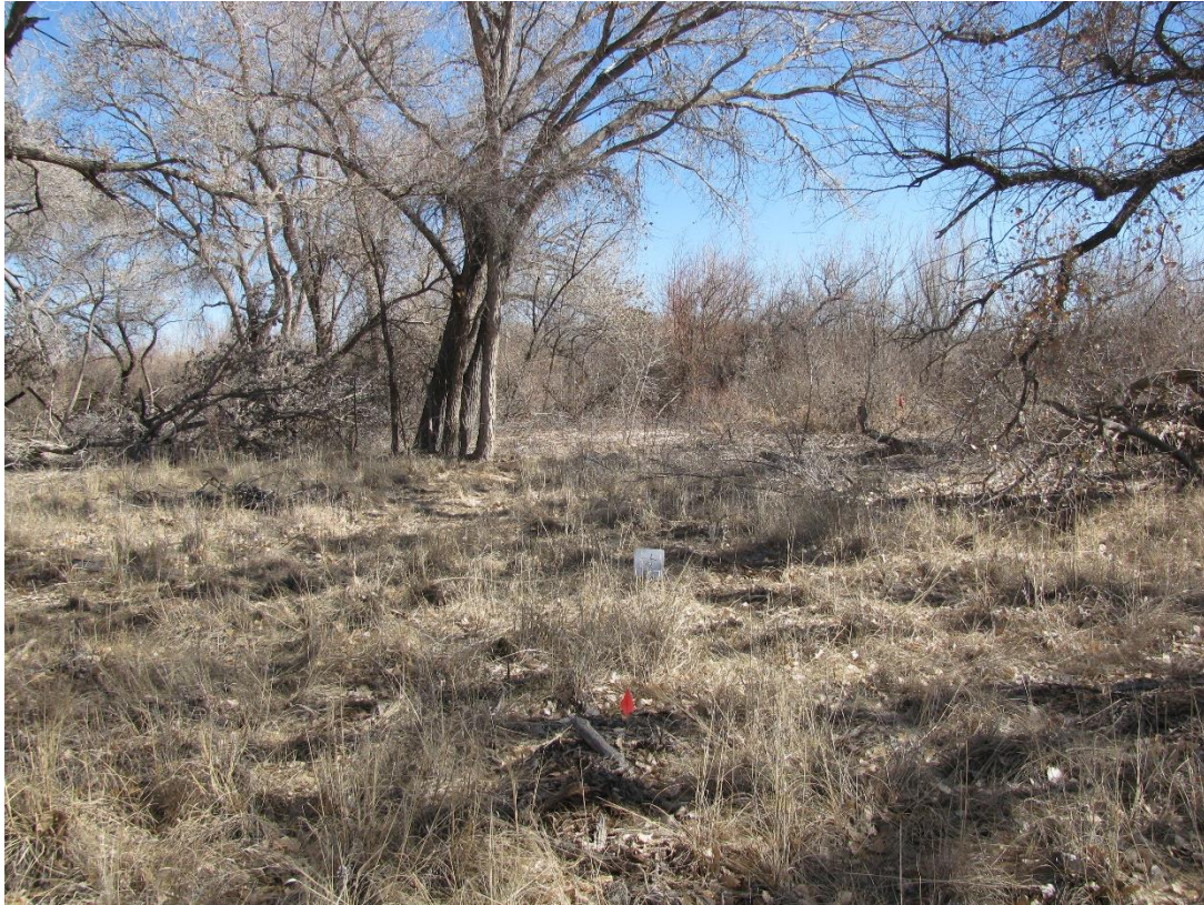
LL_4E, facing east from center (2012 above, 2016 below)