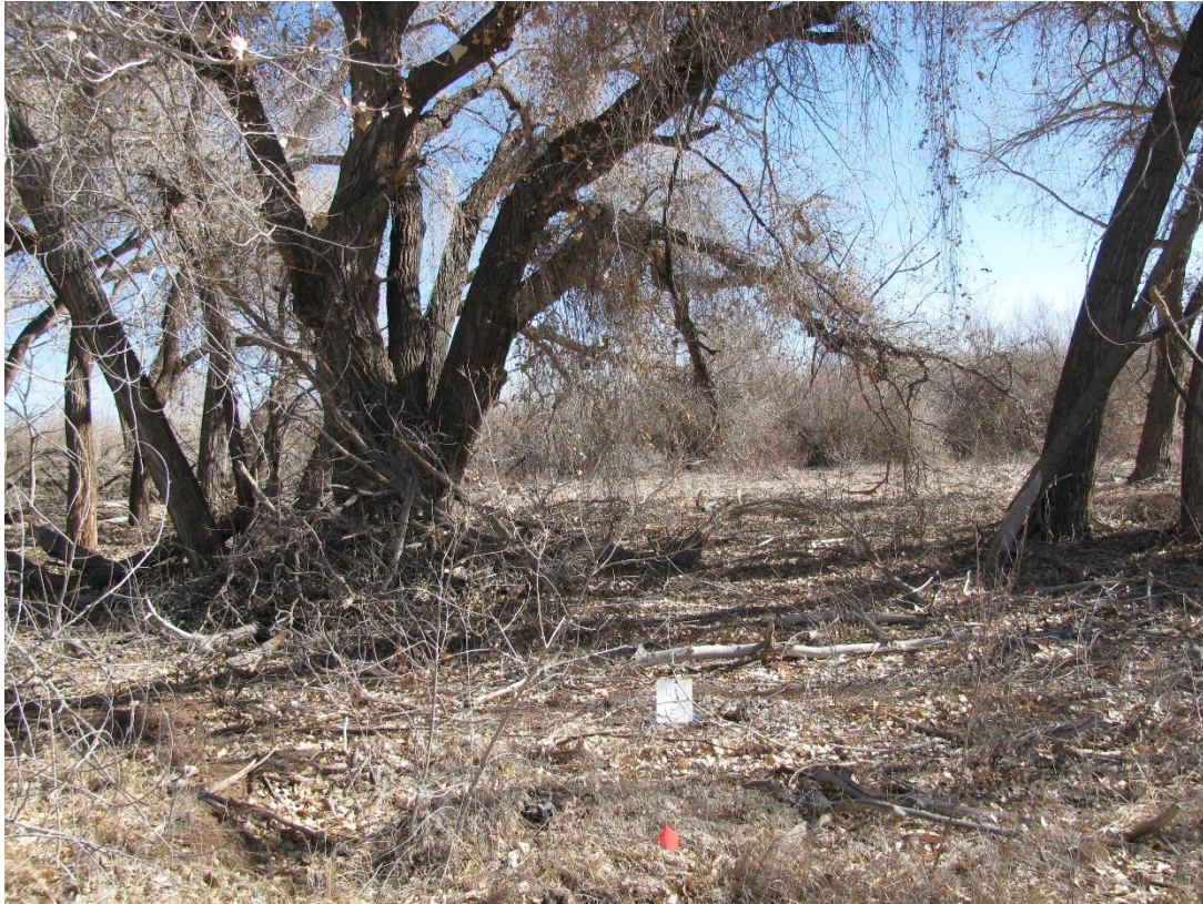
LL_3E, facing east from center (2012 above, 2016 below)