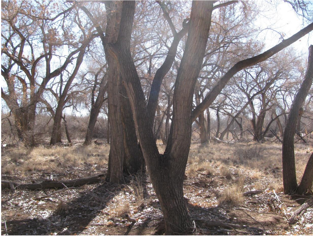
LL_4C, facing center from as close to 66 feet as visually possible (2012 above, 2016 below)