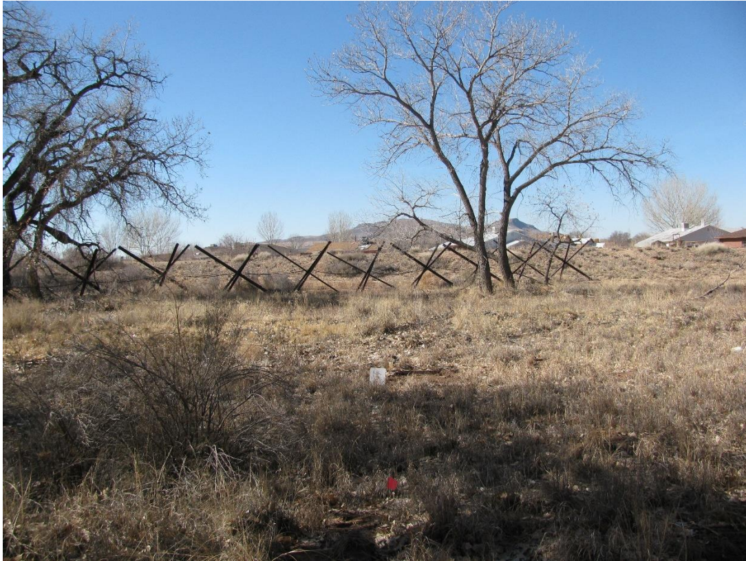
LL_4W, facing west from center (2012 above, 2016 below)