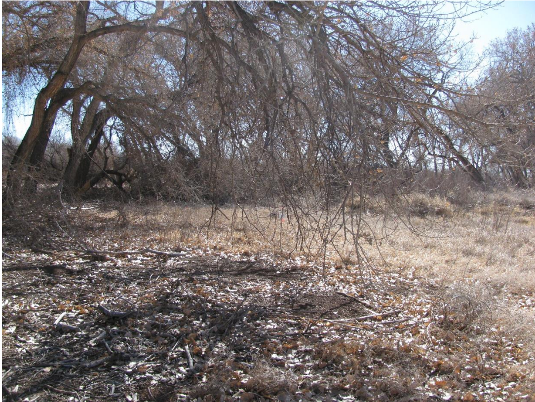
LL_3C, facing center from as close to 66 feet as visually possible (2012 above, 2016 below)