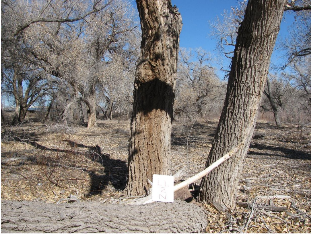
LL_2N, facing north from plot center (2012 above, 2016 below)