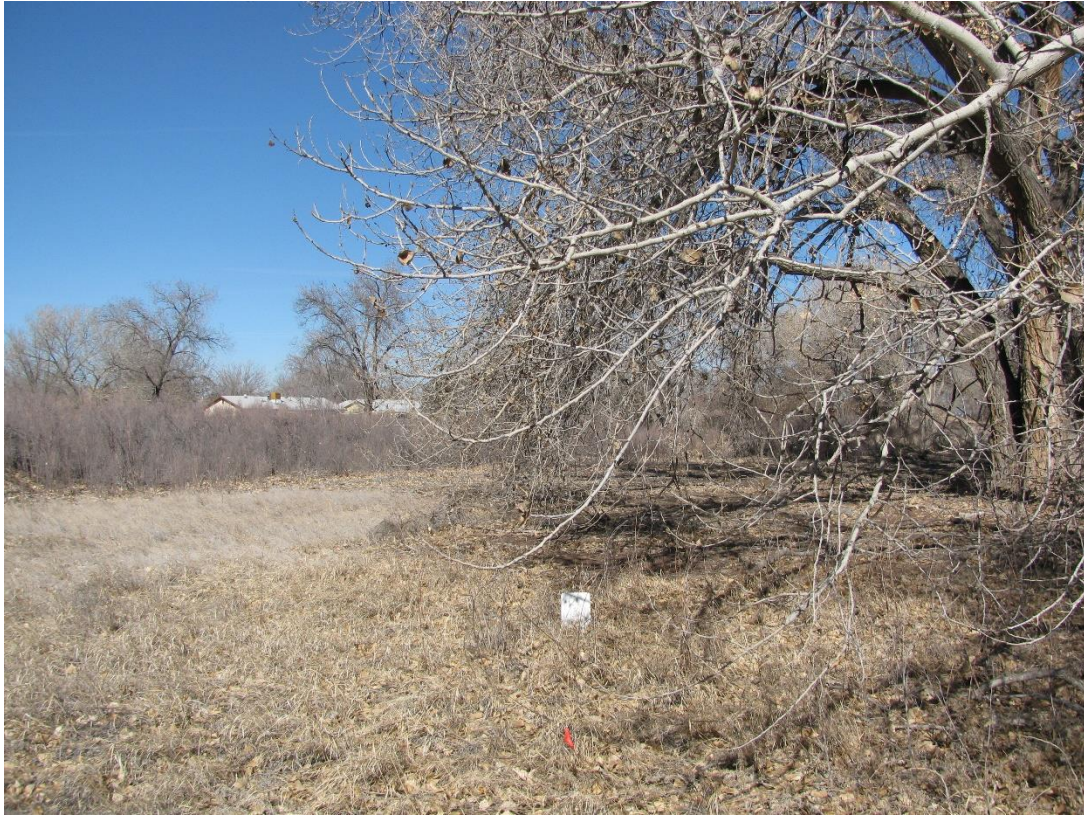
LL_3N, facing north from center (2012 above, 2016 below)