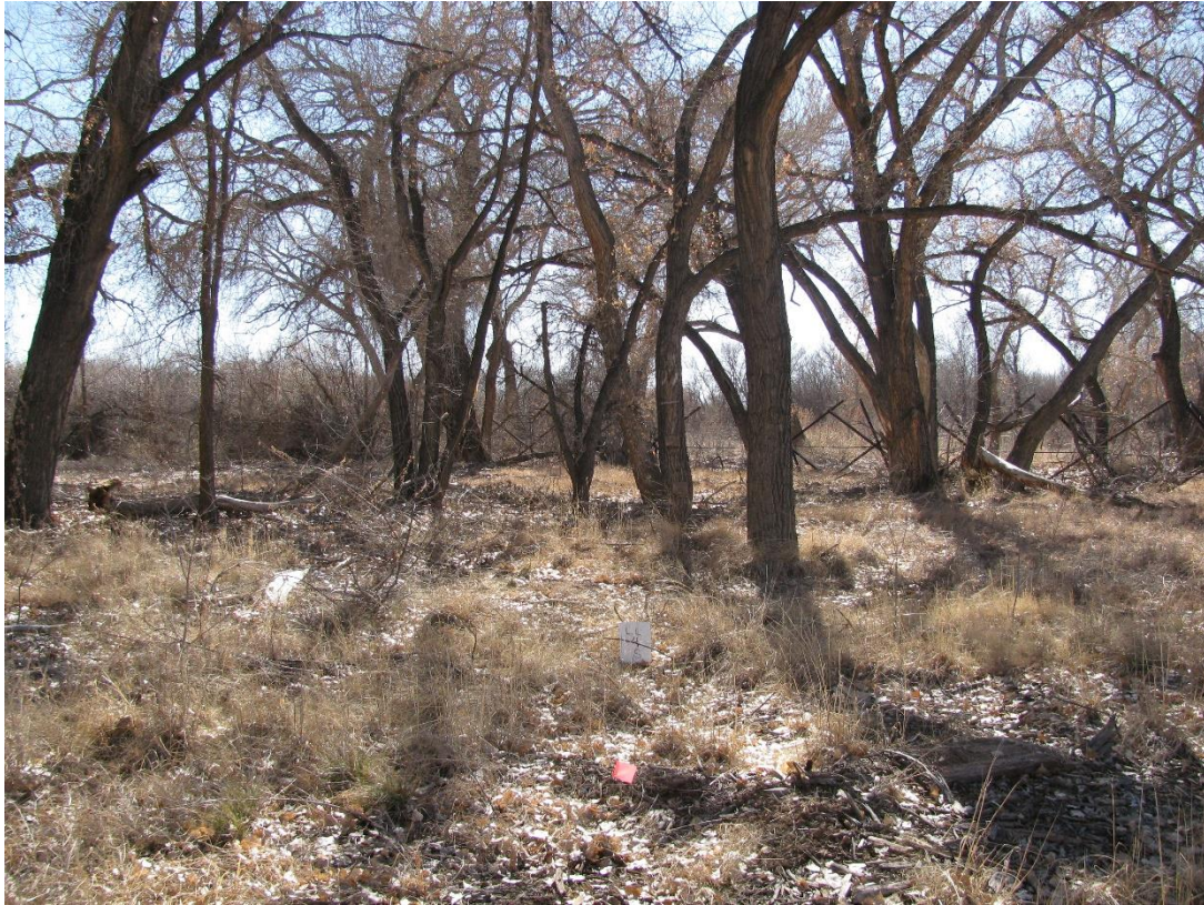
LL_4S, facing south from center (2012 above, 2016 below)