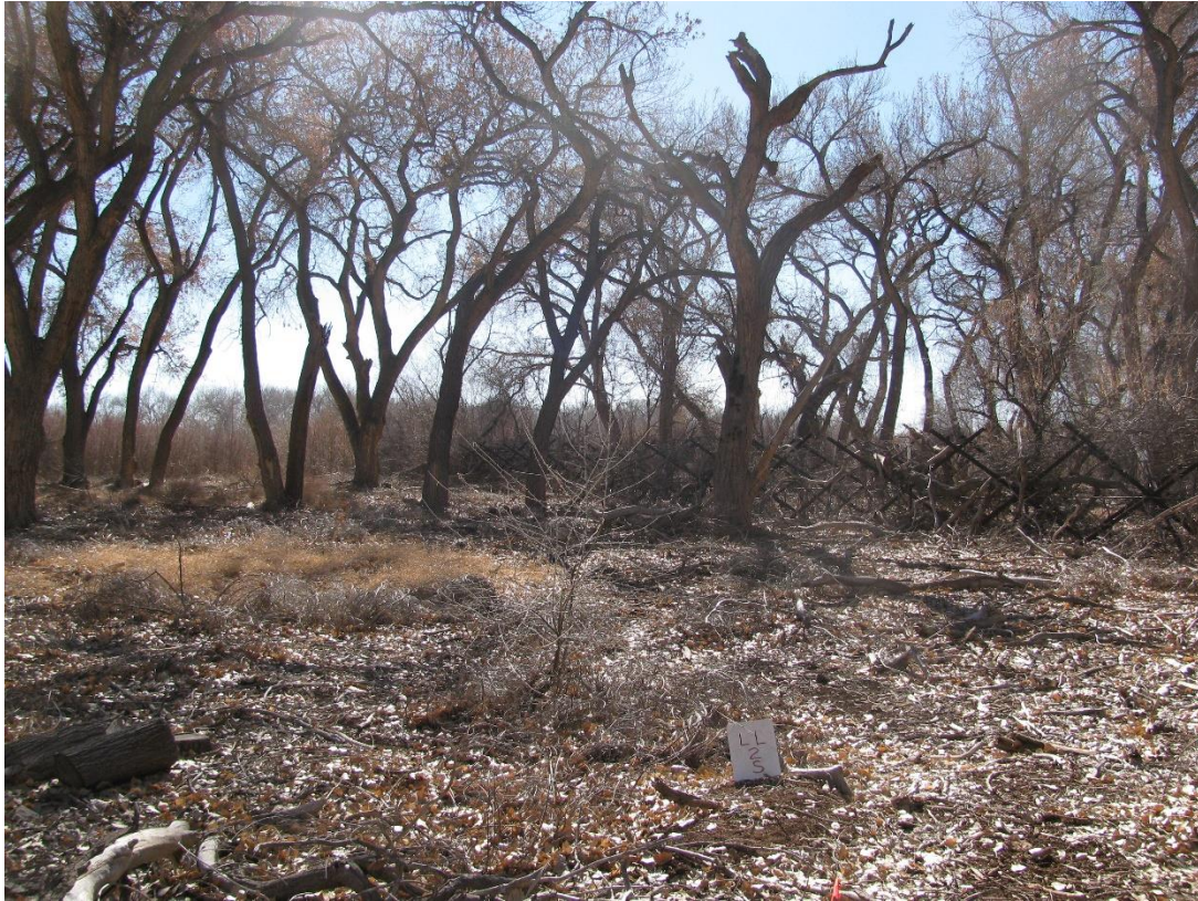
LL_2S, facing south from plot center (2012 above, 2016 below)