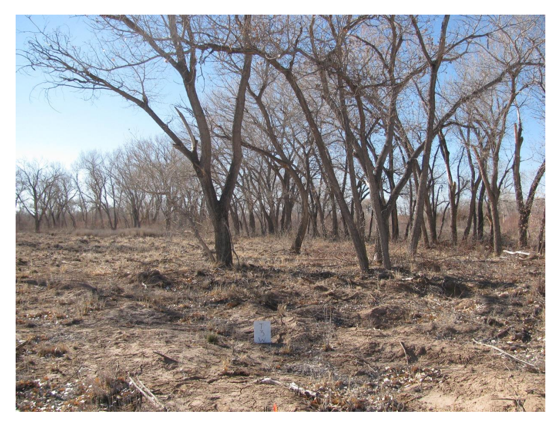
T_3W, facing west from center (2012 above, 2016 below)