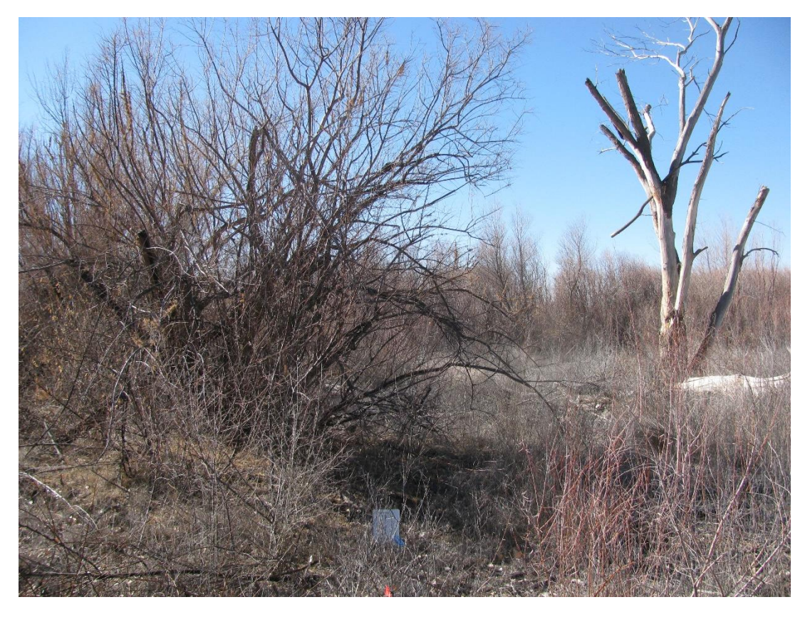
T_1W, facing west from center (2012 above, 2016 below)