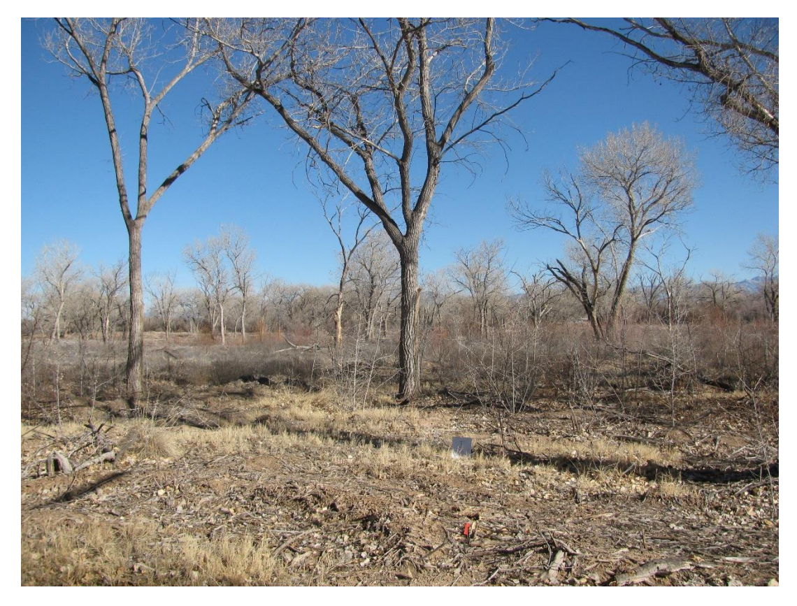
T_2E, facing east from center (2012 above, 2016 below)