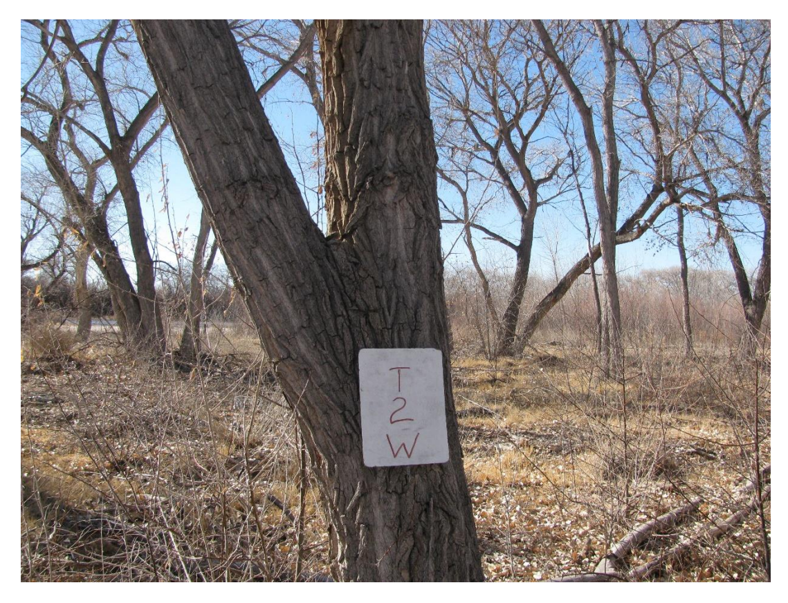
T_2W, facing west from center (2012 above, 2016 below)