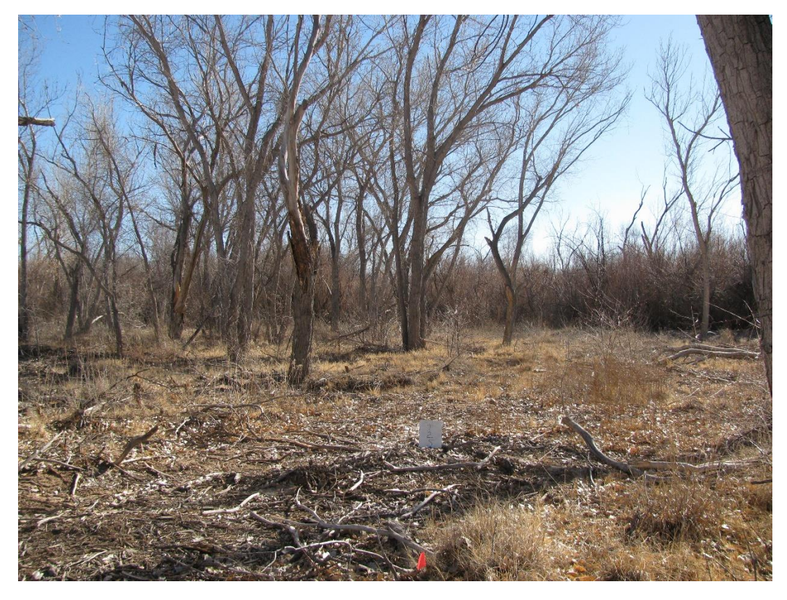
T_2S, facing south from plot center (2012 above, 2016 below)