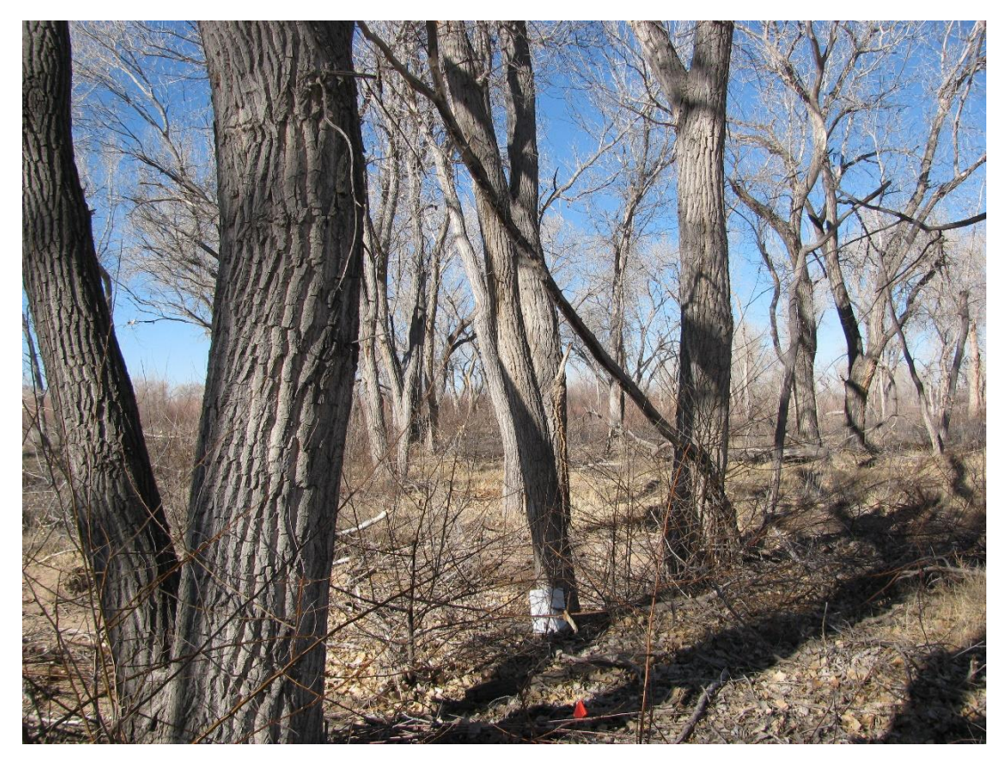
T_2N, facing north from plot center (2012 above, 2016 below)