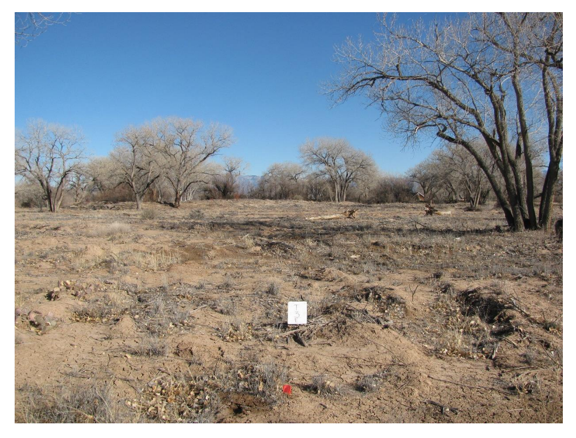
T_3E, facing east from center (2012 above, 2016 below)