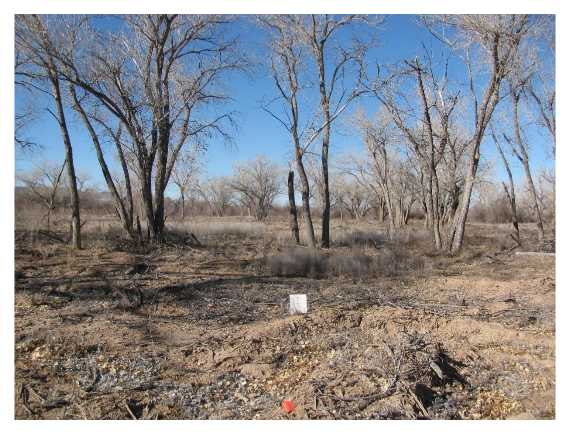
T_3N, facing north from center (2012 above, 2016 below)