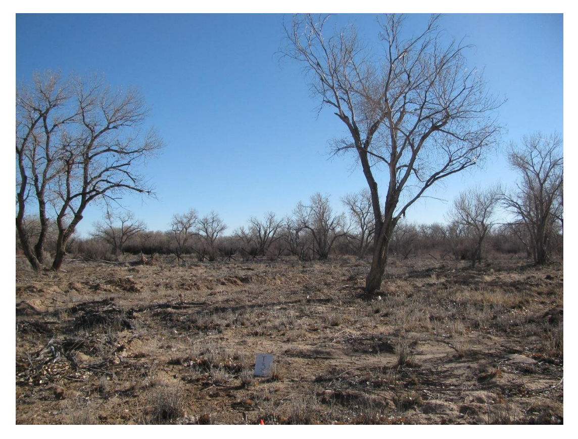
T_3S, facing south from center (2012 above, 2016 below)