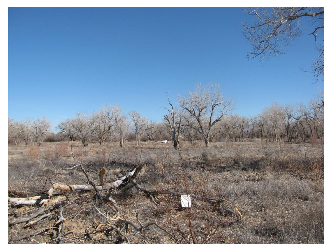
T_1E, facing east from plot center (2012 above, 2016 below)