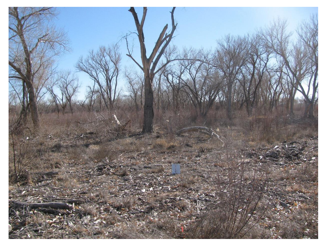
T_1S, facing south from center (2012 above, 2016 below)