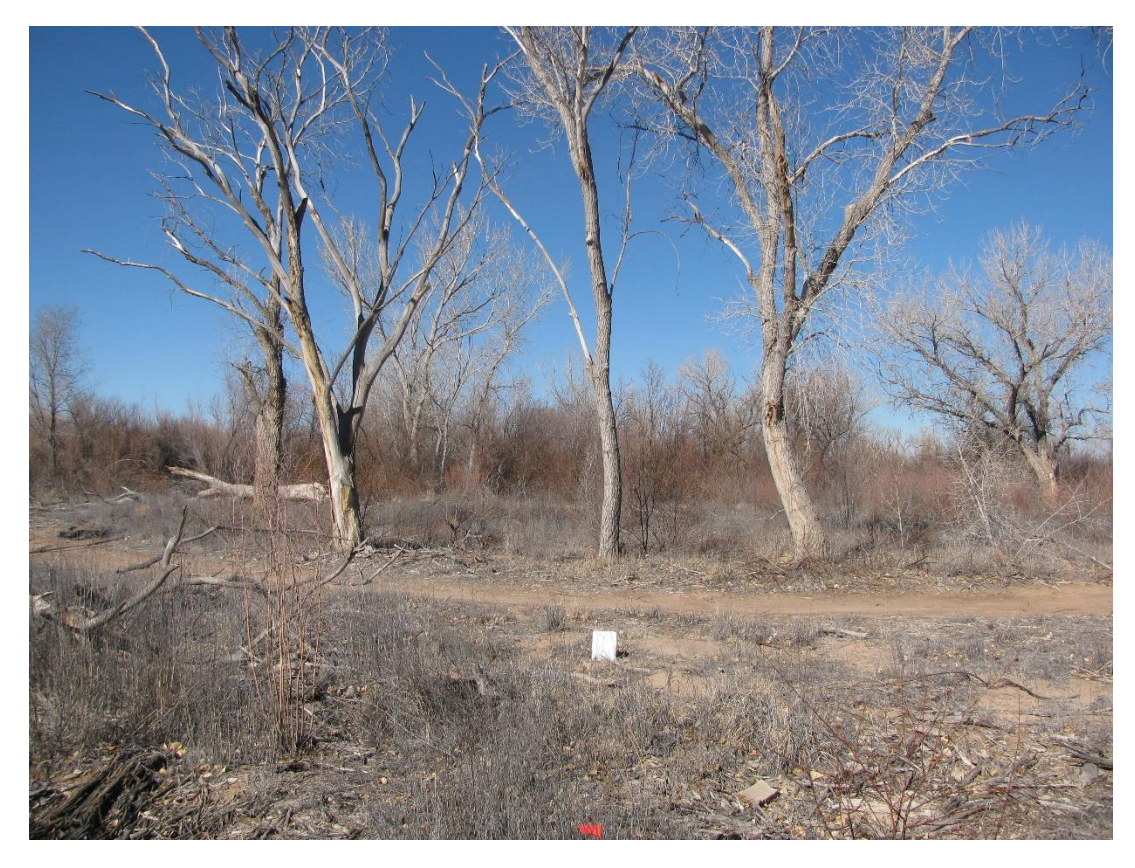
T_1N, facing north from center (2012 above, 2016 below)