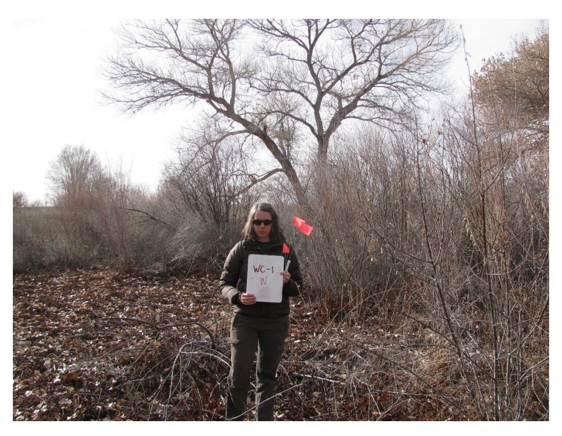
WC_1W, facing west from center (2012 above, 2016 below)