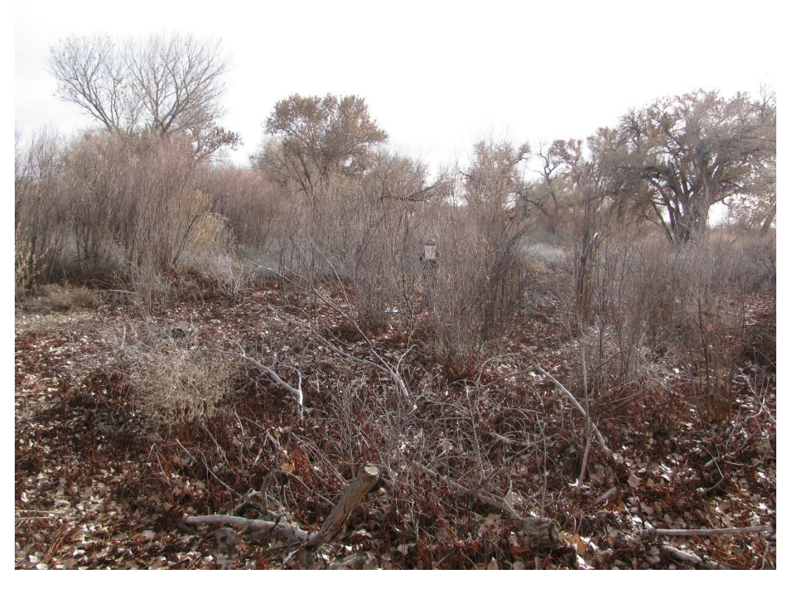
WC_1C, facing center from as close to 66 feet as visually possible (2012 above, 2016 below)