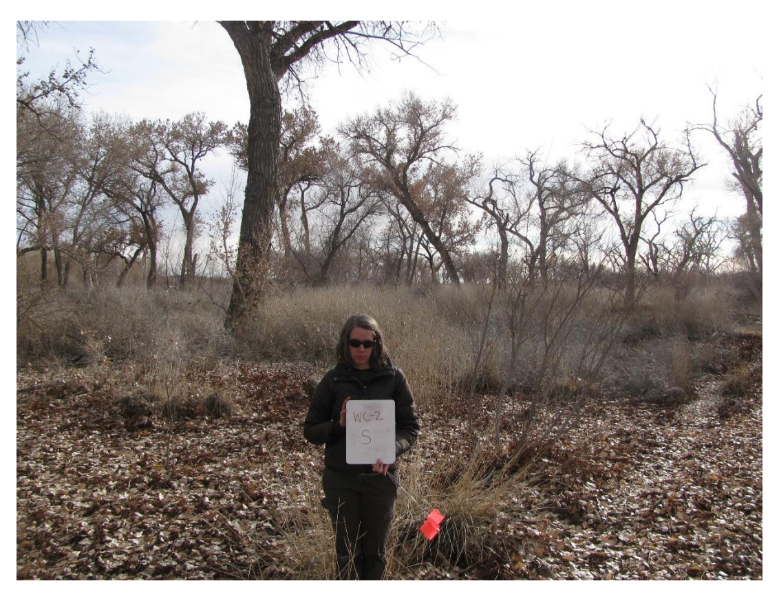
WC_2S, facing south from plot center (2012 above, 2016 below)