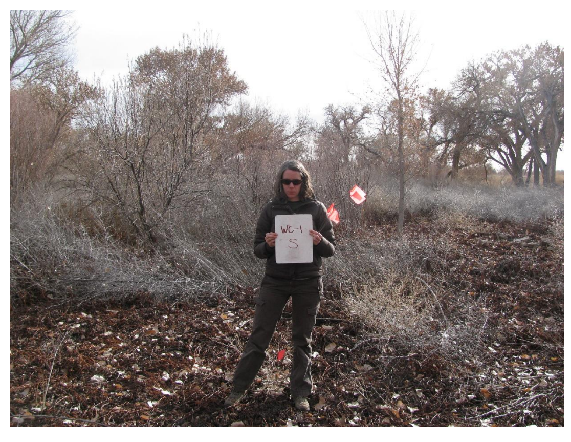
WC_1S, facing south from center (2012 above, 2016 below)