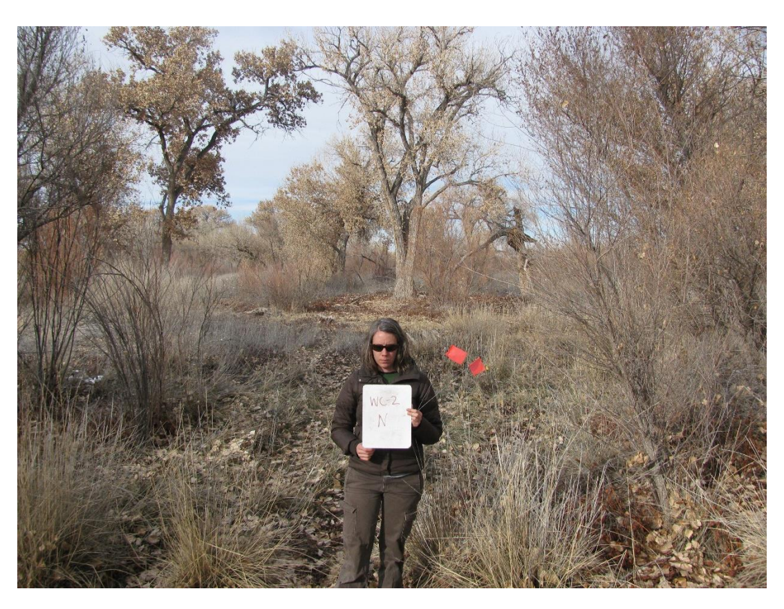
WC_2N, facing north from plot center (2012 above, 2016 below)