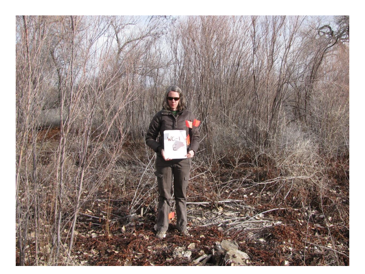
WC_1E, facing east from plot center (2012 above, 2016 below)