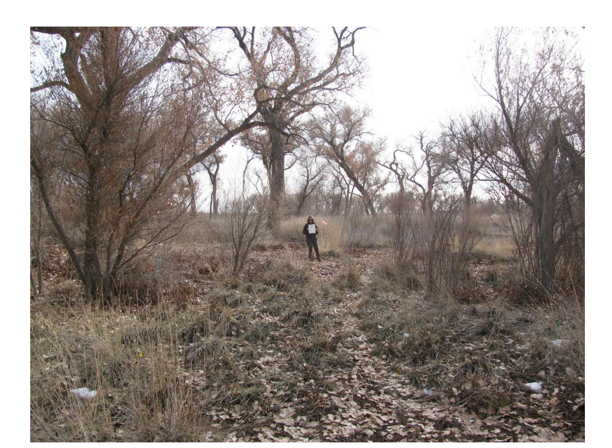
WC_2C, facing center from as close to 66 feet as visually possible (2012 above, 2016 below)