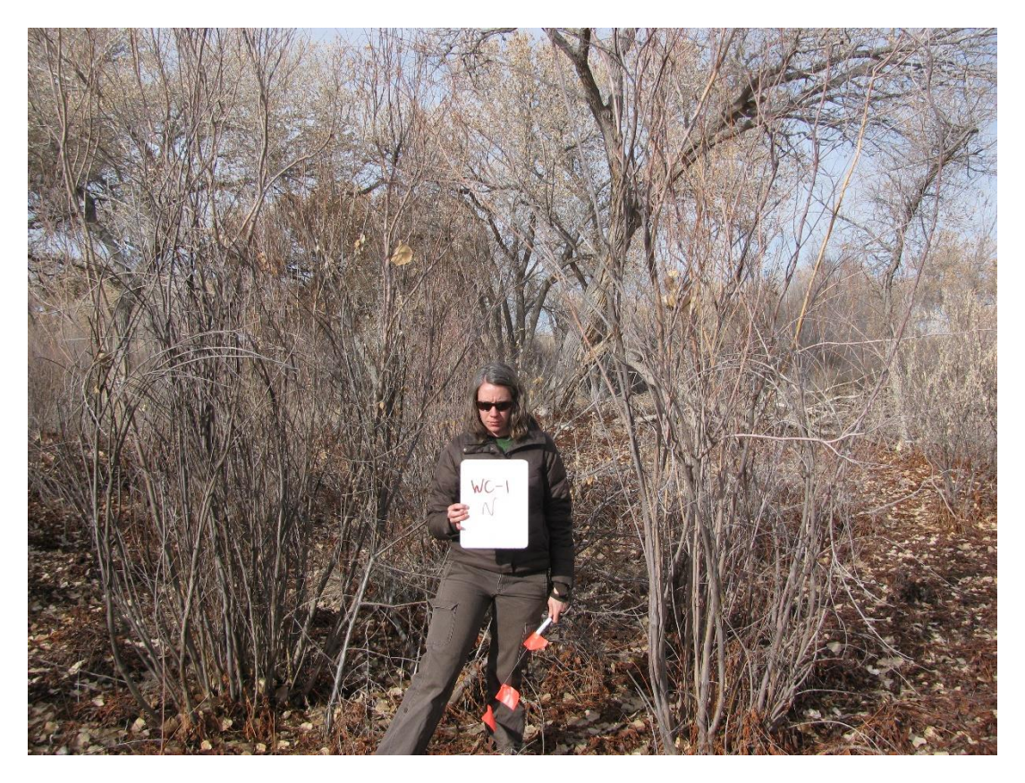
WC_1N, facing north from center (2012 above, 2016 below)