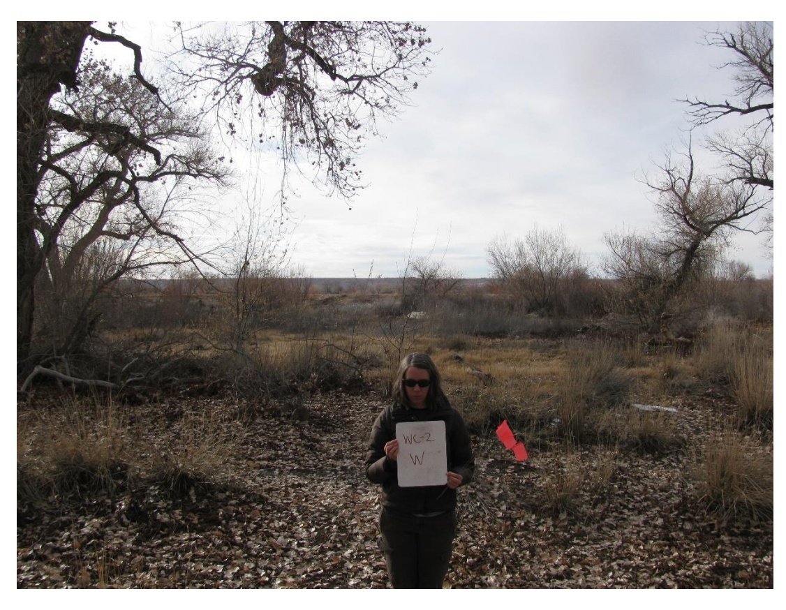
WC_2W, facing west from center (2012 above, 2016 below)