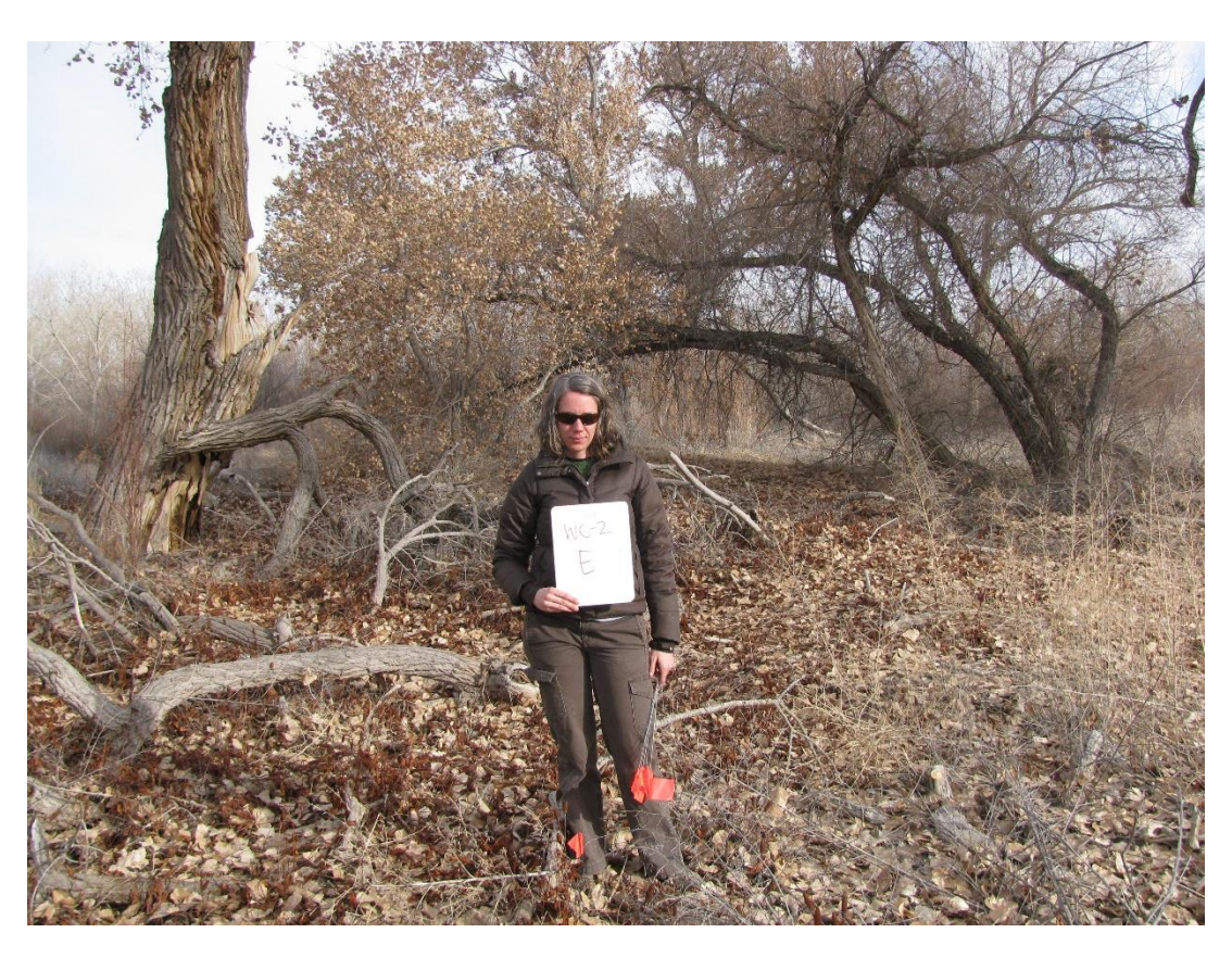
WC_2E, facing east from center (2012 above, 2016 below)