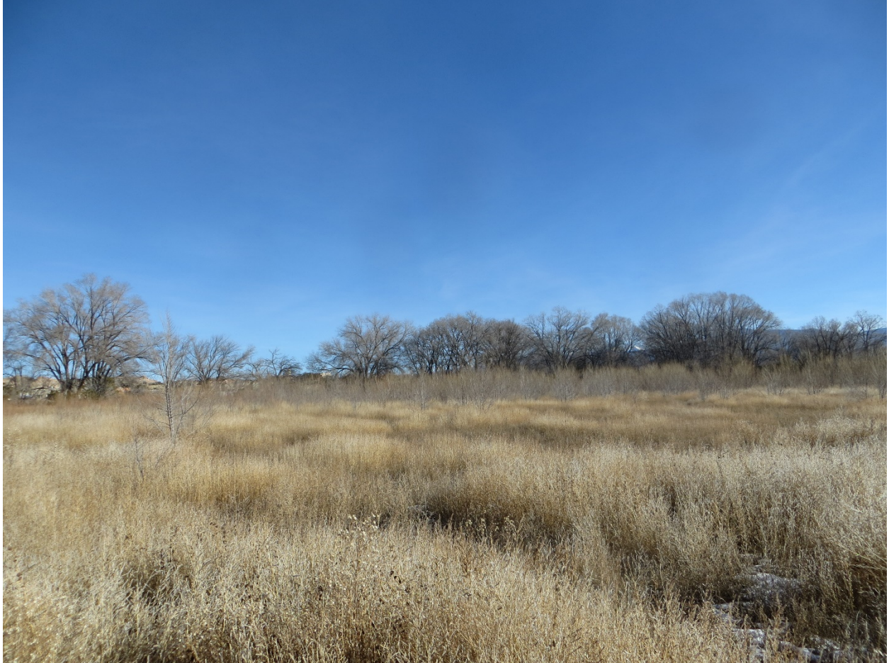
14_14_1, facing north (2015 above, 2019 below)