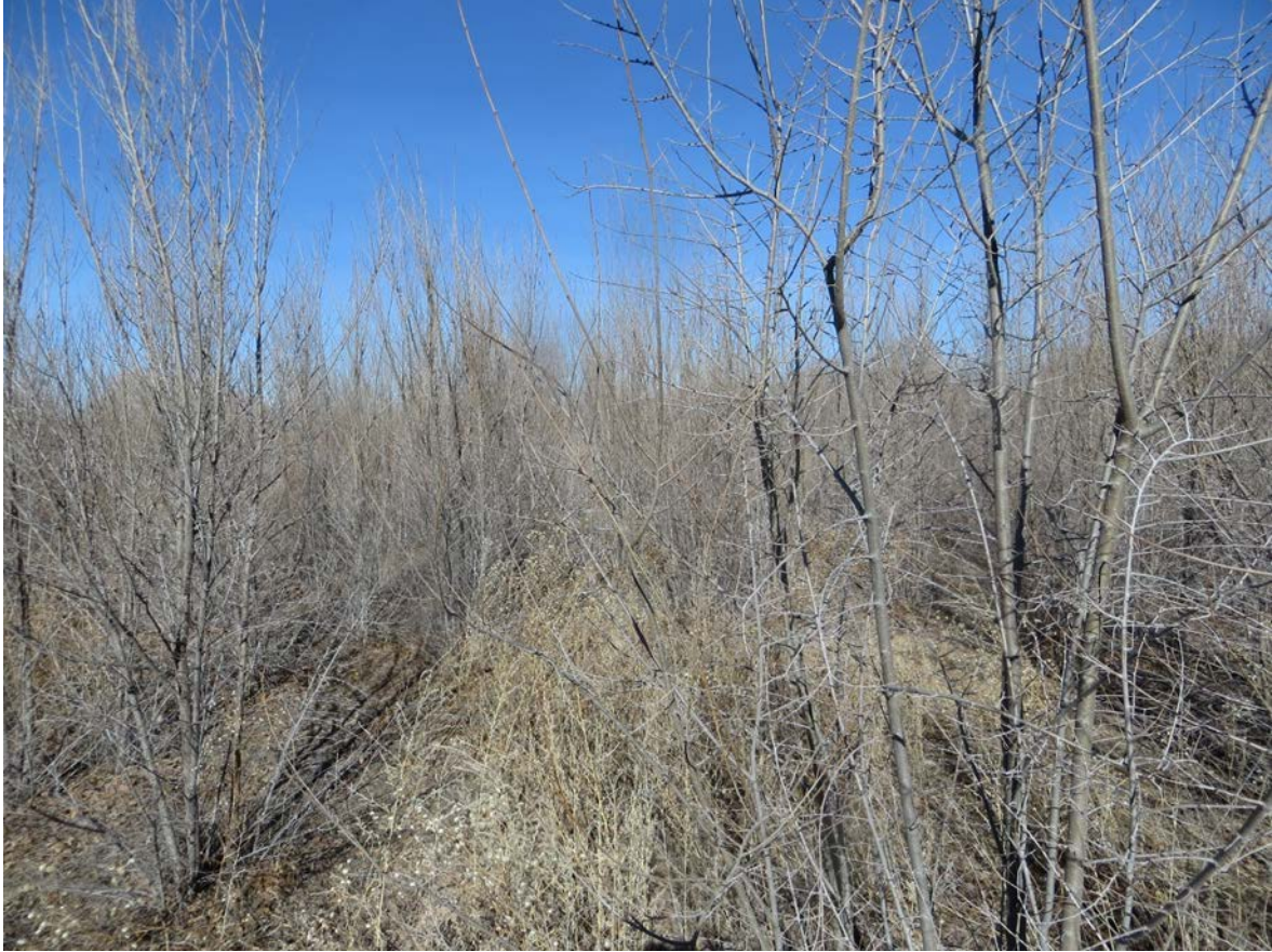
14_14_2, facing west (2015 above, 2019 below)