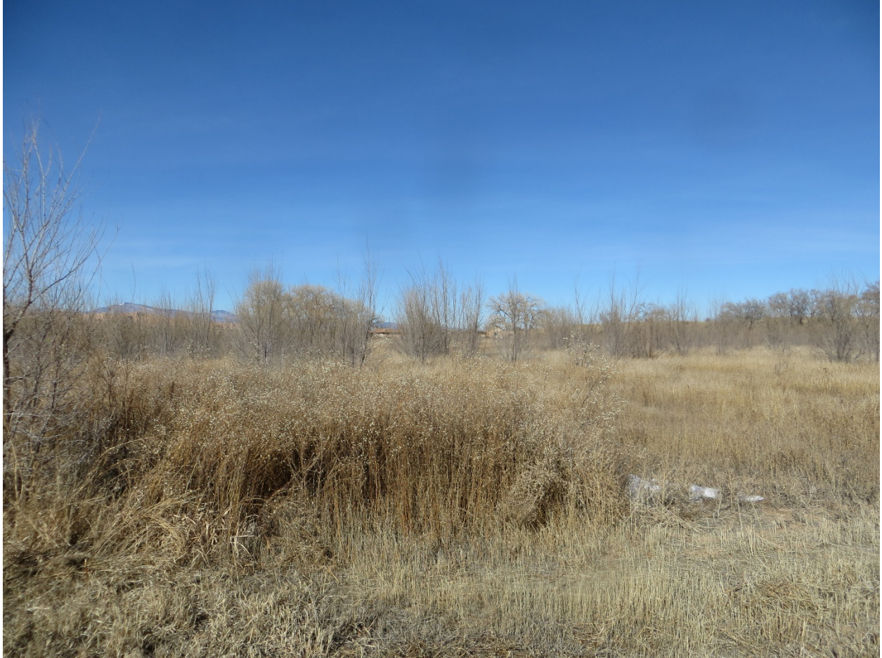
14_14_3, facing west (2015 above, 2019 below)