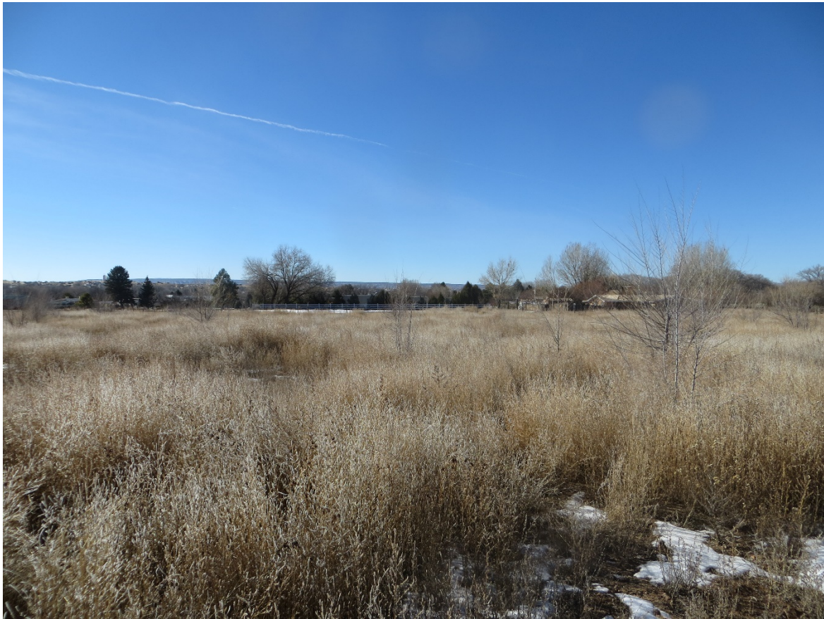
14_14_1, facing south (2015 above, 2019 below)