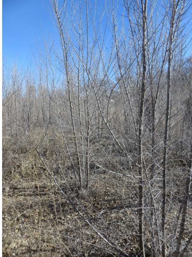
14_14_2, facing north (2015 above, 2019 below)