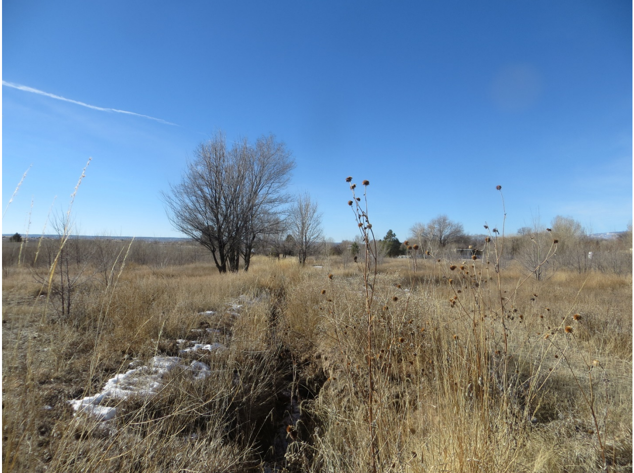
14_14_3, facing south (2015 above, 2019 below)