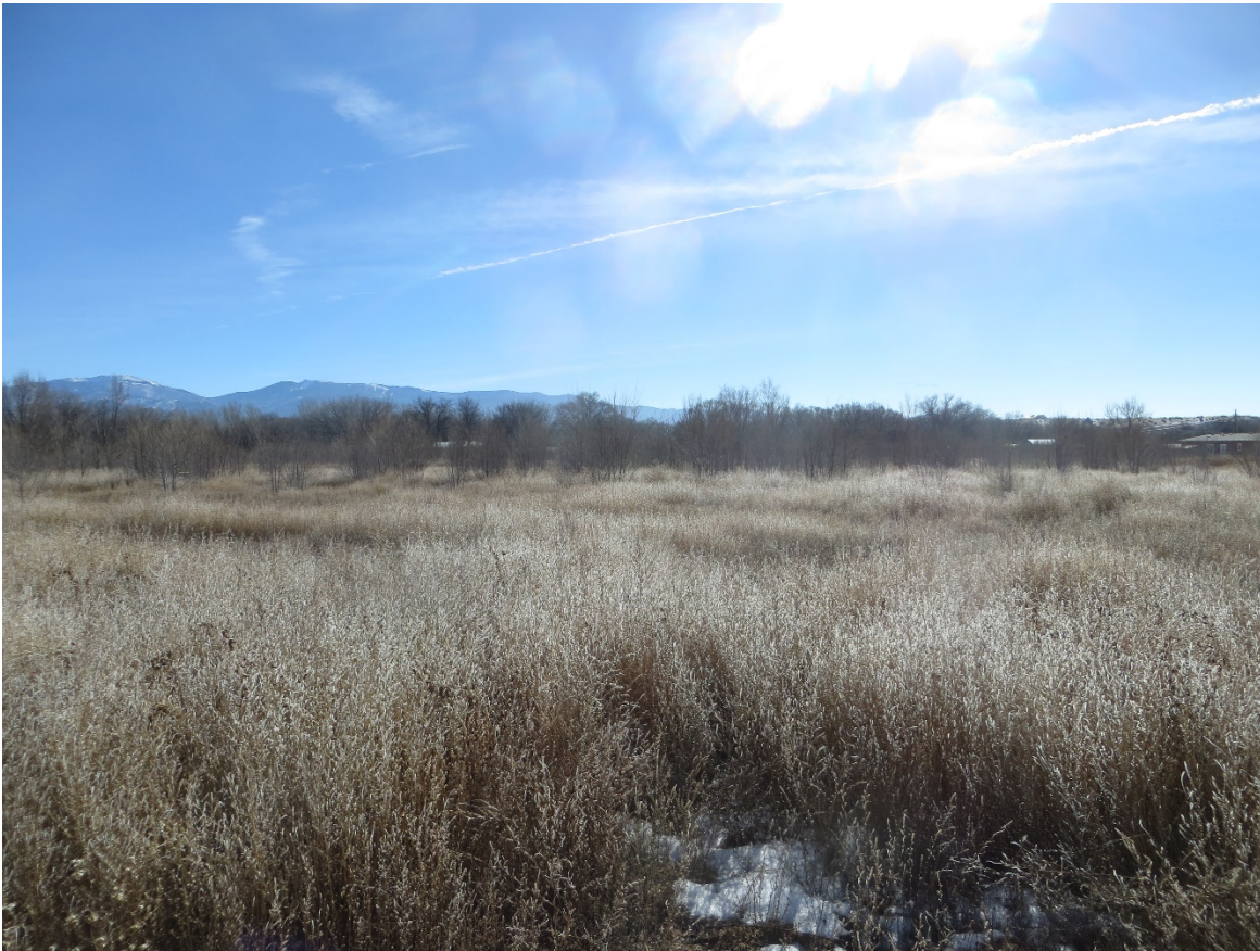
14_14_1, facing east (2015 above, 2019 below)