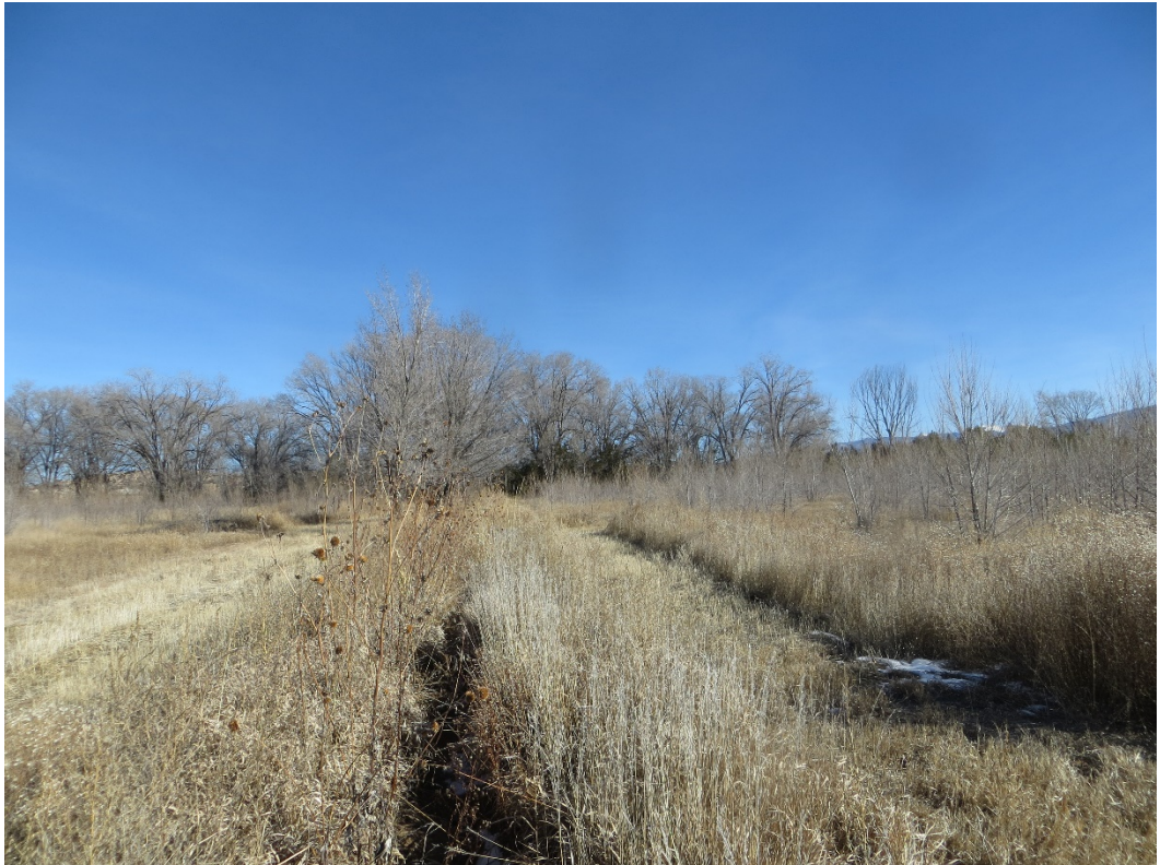
14_14_3, facing north (2015 above, 2019 below)