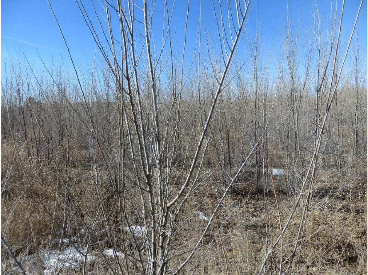
14_14_2, facing south (2015 above, 2019 below)