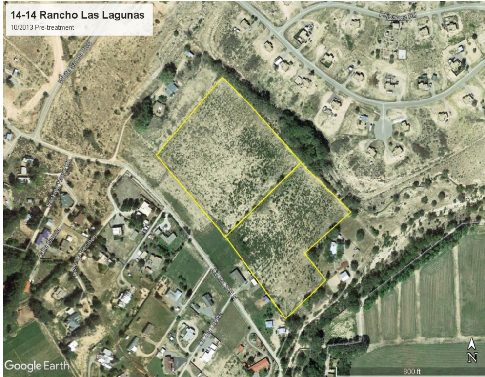
Pre- and Post-treatment imagery, courtesy of Google Earth (2015 above, 2017 below, most recent image as of 5/28/19)