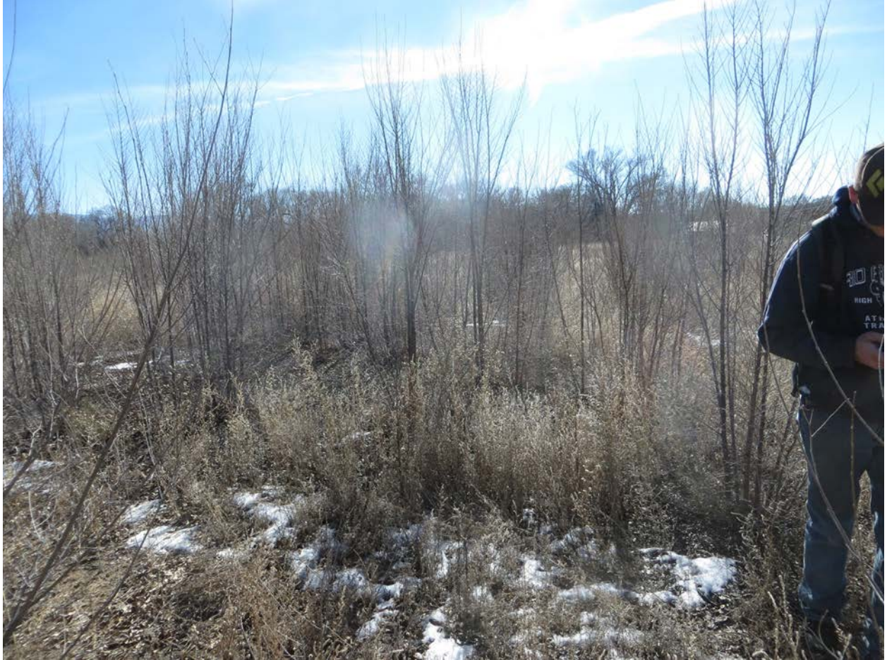
14_14_2, facing east (2015 above, 2019 below)