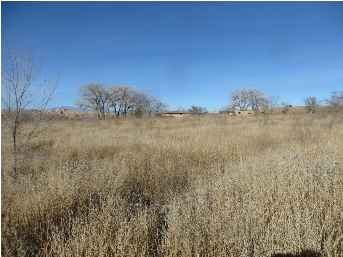
14_14_1, facing west (2015 above, 2019 below)