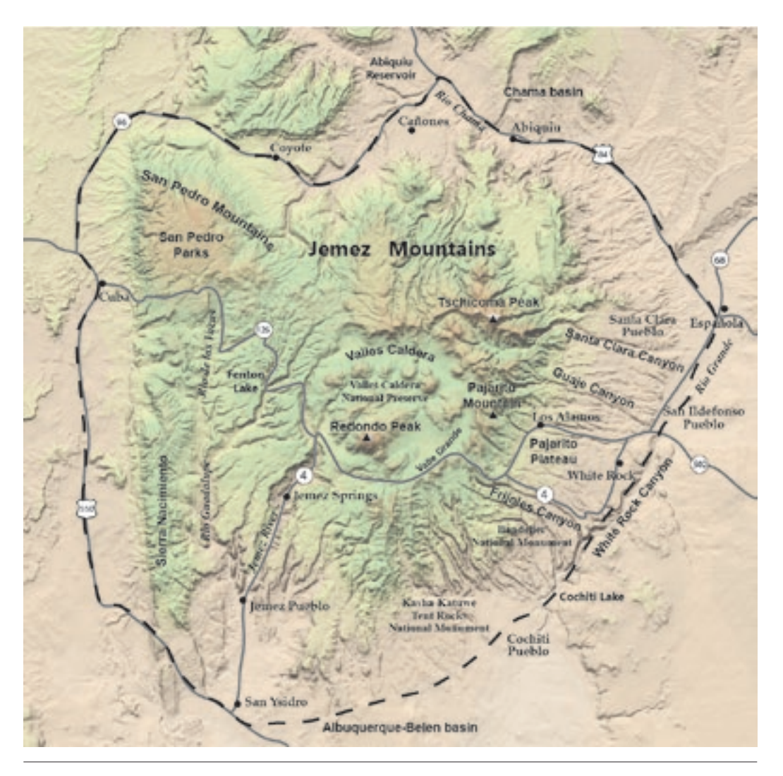
Fig. 2. Extent of Jemez Mountains.

features created by these violent eruptions include a central caldera rimmed by mountain peaks and on the eastern side of the mountain range a plateau created by the ejection of ash. There is an elevational gradient of a vertical mile from 5,300 at the Rio Grande on the eastern side to over 11,000 feet at the top of the Sierra de Los Valles that rims the caldera. The climate is considered high desert with an average rainfall of 10 inches at lower elevations to 35 inches near the high peaks. The elevation gradient, precipitation and temperature gradients support several plant communities from grasslands, woodlands, to coniferous forests (Allen 2001). Riparian habitats can be found along the Rio Grande and streams within the mountain range. Desert shrublands like those in the Great Basin can be found on the Western edge.