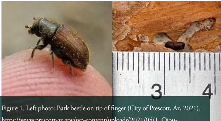
Figure 1. Left photo: Bark beetle on tip of finger (City of Prescott, Az, 2021).

Bark beetles are mostly within the genera Ips or Dendroctonus . Measuring around 1/3 inch in size or less (Figure 1), bark beetles not only provide a food source for other insects and animals, they also create habitat for many cavity nesting birds and bats. Their name reflects the living and feeding space between the bark and the wood where eventually they girdle their host. Several other non-bark beetle insects flock to recently burned forests for new food and habitat resources. These include longhorned and metallic woodboring beetles (often heard munching loudly in trees) as well as wood wasps. Woodborers and wood wasps are identified by their different body type and sometimes different exit holes (Figure 2). They are only found in highly stressed trees or dead wood. Although they pose a problem for commercial wood value, woodborers and wood wasps rarely threaten healthy trees and are therefore not a concern.