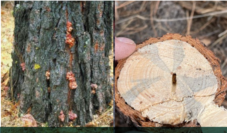
Figure 4. Pitch tubes created by trees defending themselves from bark beetles (Photo (left) by Bob Oakes, USDA Forest Service, Bugwood.org . Photo (right) Characteristic wedge-shaped blue stain pattern in a bark beetle / blue stain killed ponderosa in Montezuma, NM in Dec. 2023. Right photo by Victor Lucero.

If you find many of these symptoms or signs, likely your trees have been attacked by bark beetles. The surest clue is the identification of the galleries beneath the bark using the USFS's Field Guide.