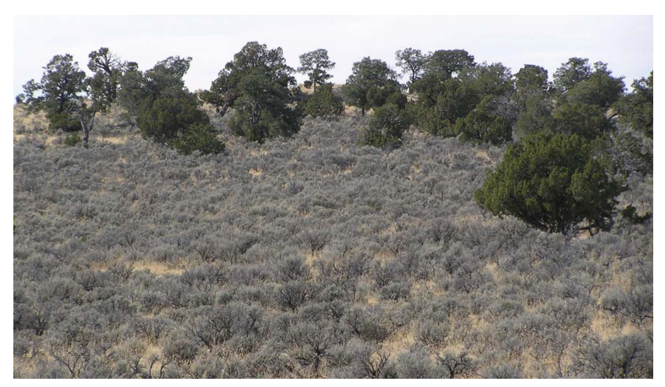
Figure 5. An area of potential expansion and contraction, on fine-textured soils in a region of moderate, winter-dominated precipitation. The canopy is composed of Pinus edulis, Juniperus osteosperma, and Juniperus monosperma. The prominent shrub is Artemisia tridentata. The trees are all-aged. Note the relatively old-appearing (>150 years, Table 2) piñon trees in the background, with flattened crowns and large branches near the top; and the younger-appearing piñon and juniper trees in the foreground, with spire-shaped crowns. The younger trees are evidence of expansion during the past century, but contraction also has occurred during a severe regional piñon mortality event within the past decade (see Figure 8). Evidence of past fire is scarce. San Juan Basin, northwestern New Mexico, elevation ca. 6,800 feet.