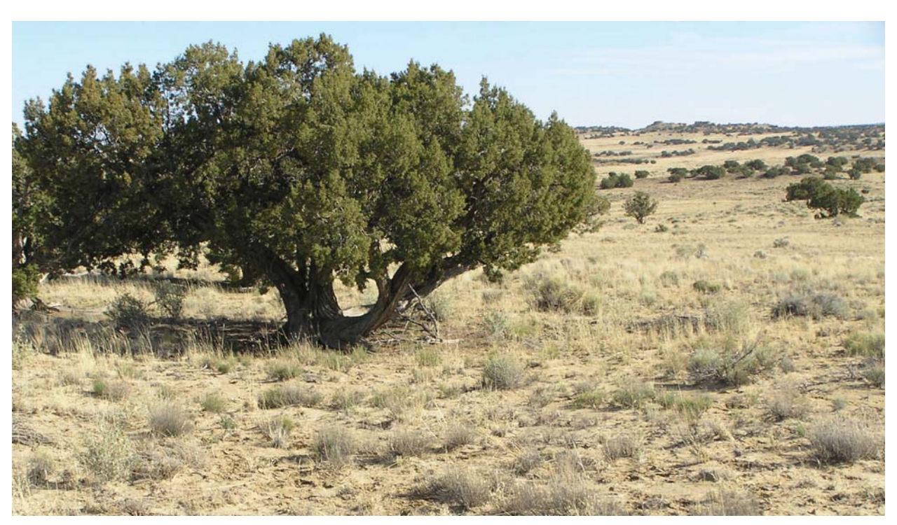
Figure 3. Juniper savanna, growing in fine-textured soils in a region of low precipitation where low tree density probably is a result of competition for moisture rather than fire or other disturbances. Trees are predominantly Juniperus osteosperma, with occasional Juniperus monosperma and Pinus edulis. Many of the trees appear to be relatively old (>150 years), i.e., crowns are flattened and branches are large and gnarly (Table 2). Evidence of past fire is scarce. San Juan Basin, northwestern New Mexico, elevation ca. 6,800 feet.

(3) Areas of potential woodland expansion & contraction are found where site conditions are only intermittently suitable for piñon and/or juniper