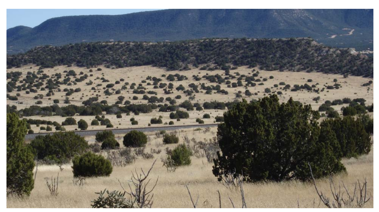
Figure 4. Piñon-juniper savanna, growing in relatively deep soils on gentle terrain, in a region of summer-dominated precipitation. Trees are predominantly Juniperus monosperma with occasional Pinus edulis. Most trees are less than 150 years old, but there is at least one older tree per acre. Blue grama (Bouteloua gracilis) is the dominant grass; cholla cactus (Opuntia imbricata) is also present. With a well-developed herbaceous stratum within a relatively productive environment, low tree density at this site may have been maintained historically by periodic fire. However, fire history studies have not been conducted in this area to confirm or reject this hypothesis. Near Mountainair, New Mexico, elevation ca. 6,400 feet.

establishment and survival over long time scales. Trees may become more abundant during moist climatic periods or during long disturbance-free intervals, but subsequently die back during drought and associated insect outbreaks or following fire. Many woodlands of this type have a shrub-dominated understory (Figure 5). Some such areas may have a distinctive historical fire regime, and therefore could be classified as a separate piñon-junipershrub type if such a distinction is useful for management. This vegetation type overlaps somewhat with disturbancemaintained savannas, but refers primarily to areas that fluctuate between shrubland or grassland structure and tree dominance, as well as other sites where