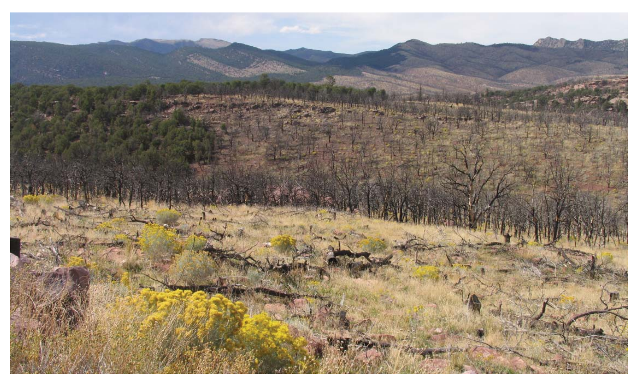
Figure 6. A recent stand-replacing burn in persistent woodlands, the ca. 25,000-acre Mustang Fire of 2002, photographed in fall of 2006. Note the sharp boundaries between burned and unburned woodlands, and the nearly complete canopy mortality within the burn perimeter — typical characteristics of large fires in persistent piñon-juniper woodlands, both historically and at present. Trees are Pinus edulis and Juniperus osteosperma. Near Flaming Gorge Reservoir, northeastern Utah, elevation ca. 6,200 feet.