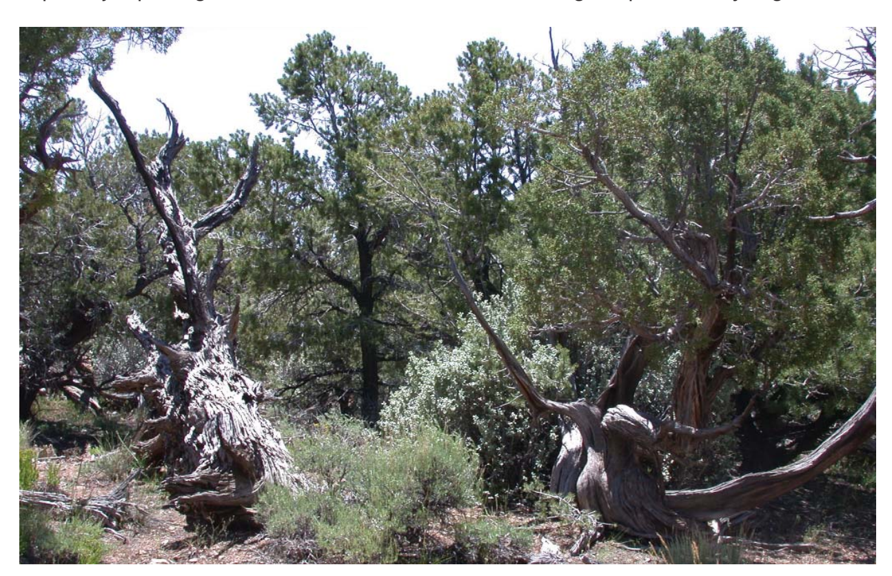
Figure 2. Persistent woodland, growing on a moderately productive site with high canopy cover and sparse herbaceous understory. The canopy is composed of Pinus edulis and Juniperus osteosperma; the major understory shrub is Artemisia tridentata. Trees are all-aged, including many individuals > 300 years old, and the stand contains no evidence of past fire. Navajo Point, Glen Canyon National Recreation Area, Utah, elevation ca. 7,000 feet.

(2) Piñon-juniper savannas are usually found on gentle upland and transitional valley locations, where soil conditions favor grasses (or other grass-like plants) but can support at least some tree cover. Some savannas apparently have sparse tree cover because of edaphic or climatic limitations on woody plant growth; many of these savannas have probably changed little during the past century (Figure 3).