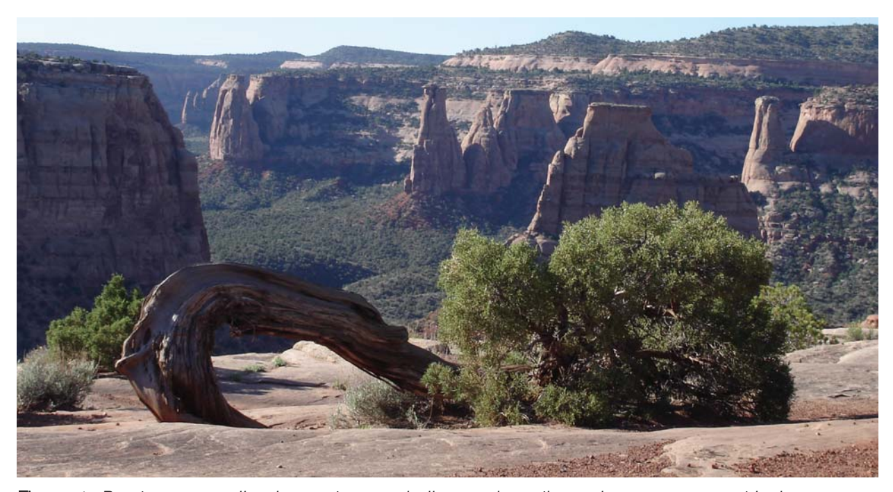
Figure 1. Persistent woodland, growing on shallow rocky soils on the mesa tops, with deeper colluvial soils in the canyon bottom. The canopy is composed of Pinus edulis and Juniperus osteosperma. The trees are all-aged, including many old individuals, and the woodlands within this view contain no evidence of past fire. Colorado National Monument, Colorado, elevation ca. 6,000 feet.

(1) Persistent Woodlands are found where site conditions (soils and climate) are inherently favorable for piñon and/or juniper. Canopy and understory characteristics vary considerably from place to place, from sparse stands of scattered small trees growing on poor substrates (Figure 1) to relatively dense stands of large trees on productive sites (Figure 2). Tree density and canopy cover also may fluctuate in response to disturbance and climatic variability. Nevertheless, these are plant