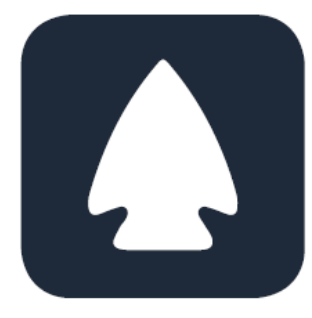
VISITING HISTORIC SITES