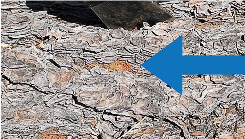
Above: Ips larva, pupa, and adult. Left: Boring dust on ponderosa pine bark.