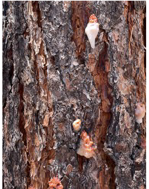
Above left: Pitch tubes on ponderosa pine ( Ips spp.). Above right: Dendroctonus barberi .