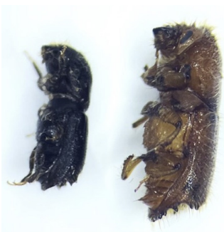
Above: Ips pini (left) actual size 3-5mm, Ips calligraphus (right) actual size 5mm.