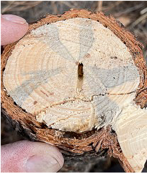
Above: Blue stain fungi. Right: Ips pini brood (eggs, larvae, adult) collected from felled PIPO logs (top right).