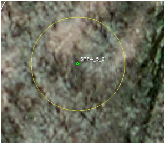
Mar 2011 Aerial View, Circle = 1/10 acre