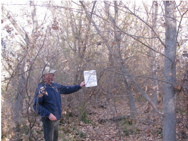
Looking East from Plot Center