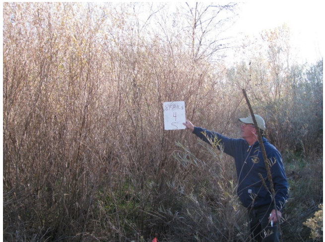
Looking South from Plot Center