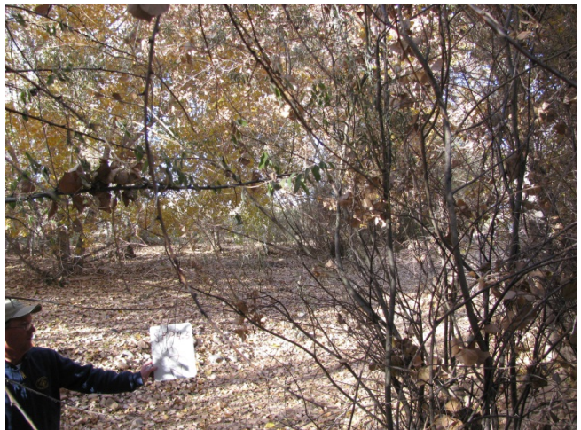
Looking North from Plot Center