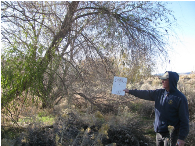
Looking West from Plot Center