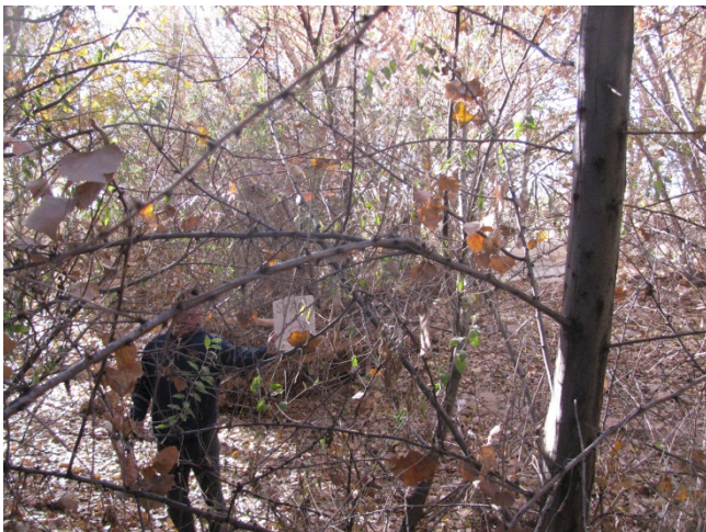
Looking West from Plot Center