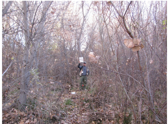
Plot Center from North