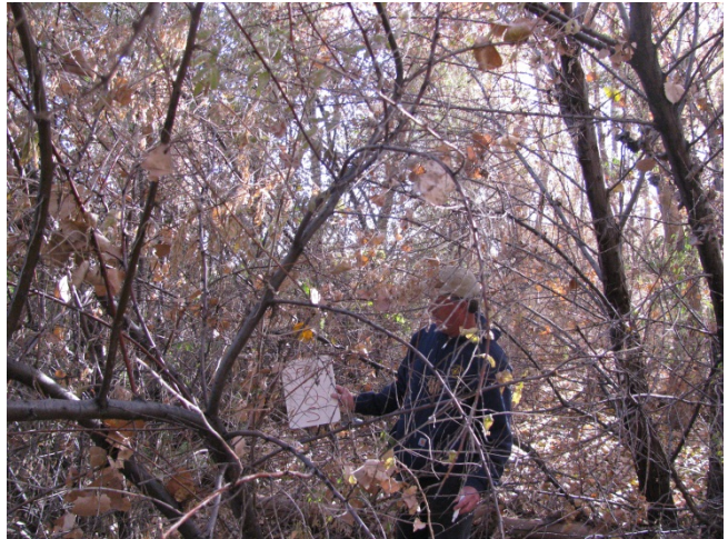
Looking South from Plot Center