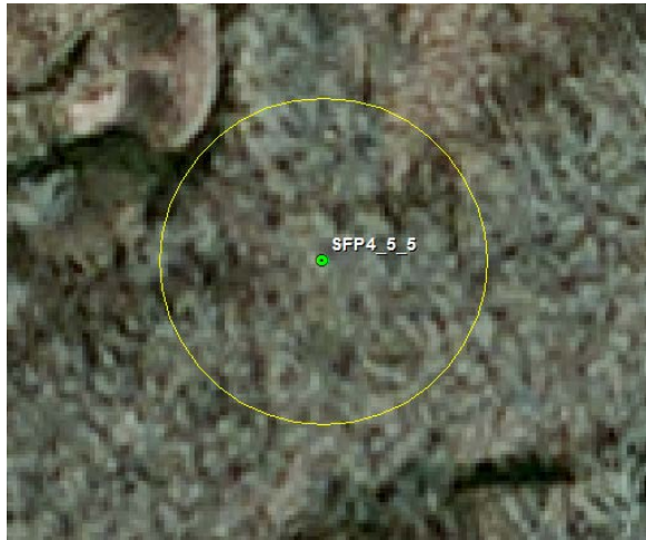
Mar 2011 Aerial View, Circle = 1/10 acre