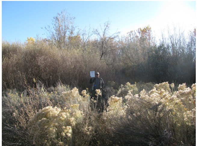
Plot Center from North