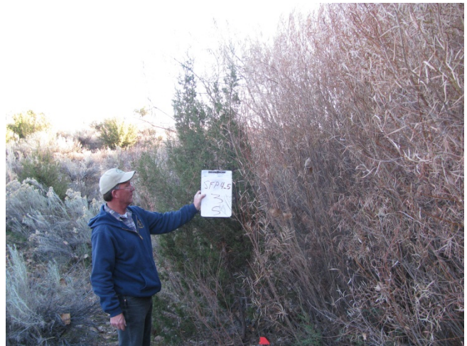
Looking South from Plot Center