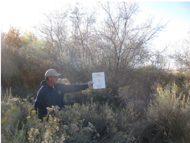
Looking West from Plot Center