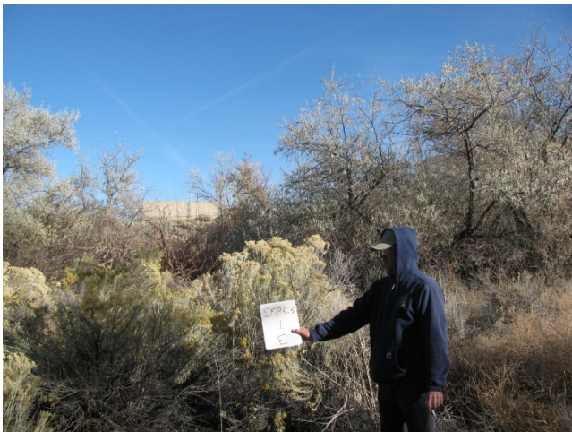
Looking East from Plot Center