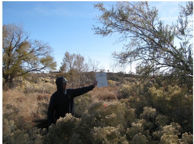
Looking South from Plot Center