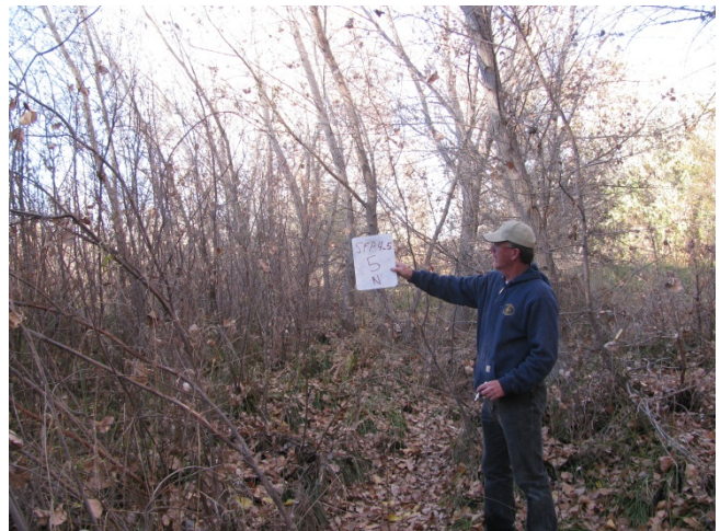
Looking North from Plot Center