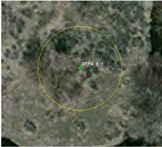
Mar 2011 Aerial View, Circle = 1/10 acre