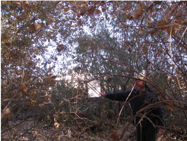
Looking East from Plot Center