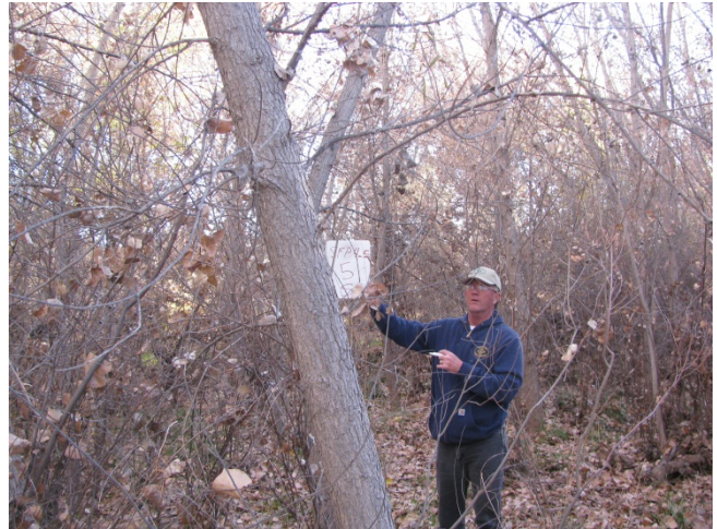
Looking South from Plot Center