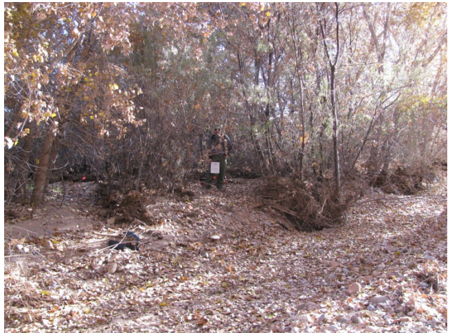
Plot Center from North