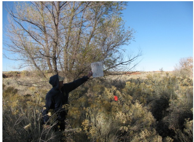
Looking North from Plot Center