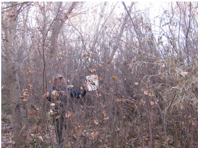
Looking West from Plot Center