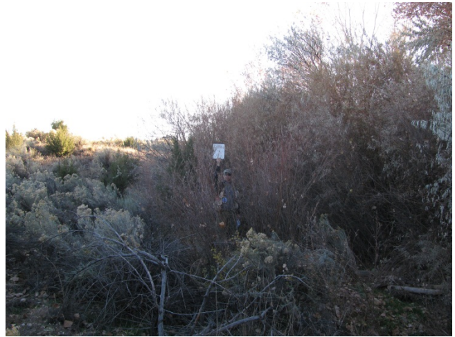
Plot Center from North