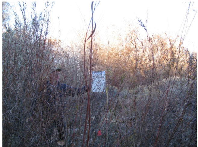
Looking North from Plot Center