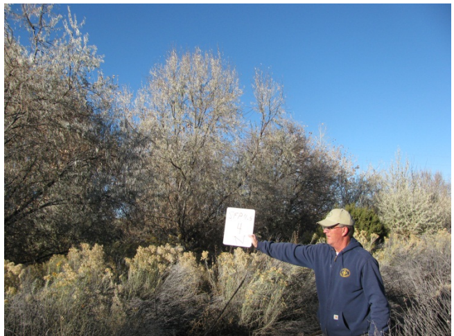
Looking North from Plot Center