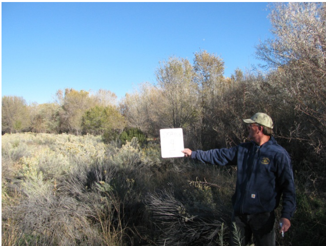
Looking East from Plot Center