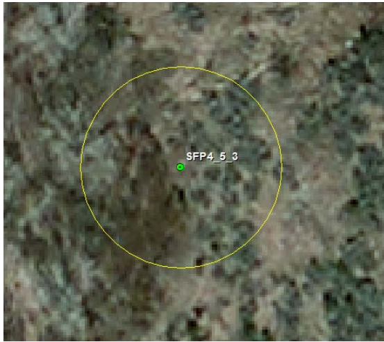
Mar 2011 Aerial View, Circle = 1/10 acre