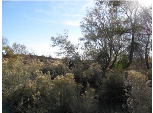
Plot Center from North