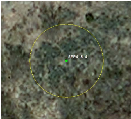
Mar 2011 Aerial View, Circle = 1/10 acre