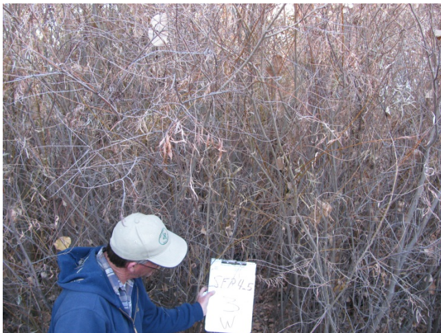
Looking West from Plot Center