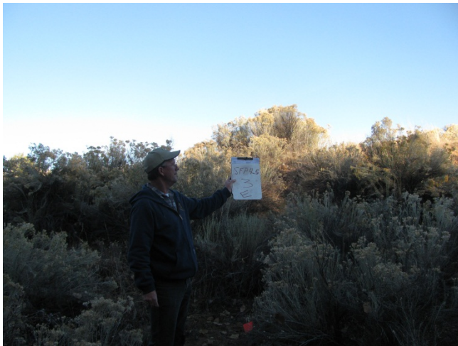
Looking East from Plot Center