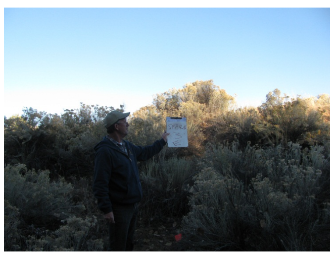
Looking East from Plot Center