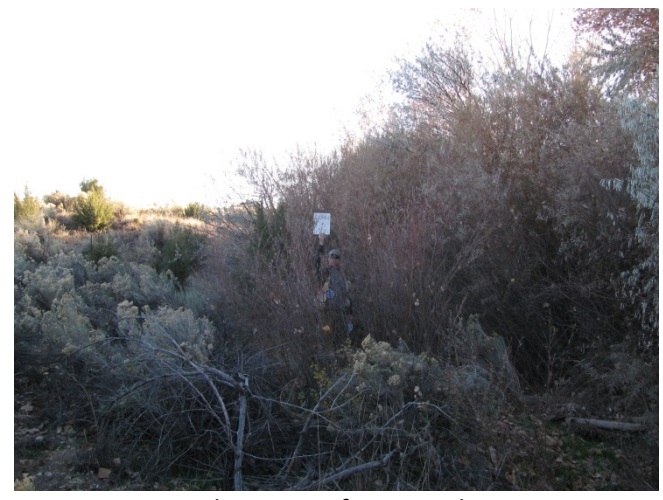
Plot Center from North