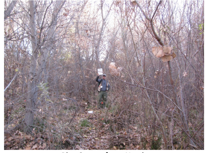
Plot Center from North