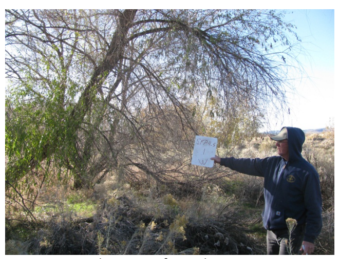
Looking West from Plot Center