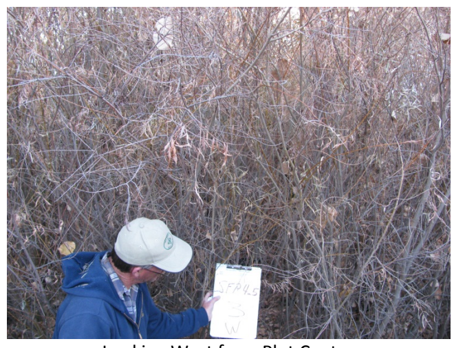
Looking West from Plot Center