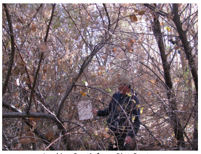
Looking South from Plot Center