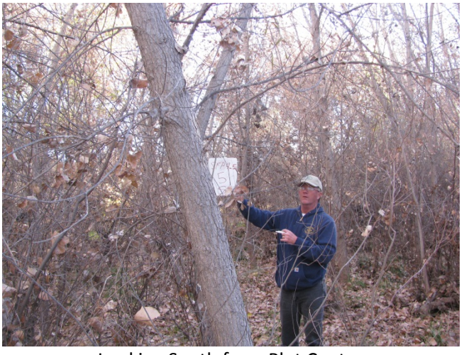
Looking South from Plot Center