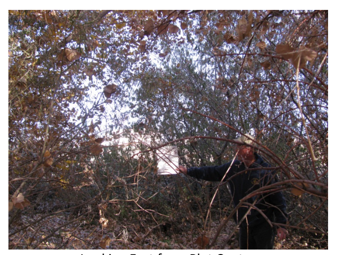
Looking East from Plot Center