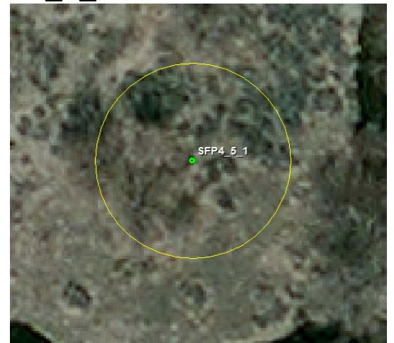
Mar 2011 Aerial View, Circle = 1/10 acre