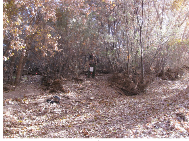
Plot Center from North