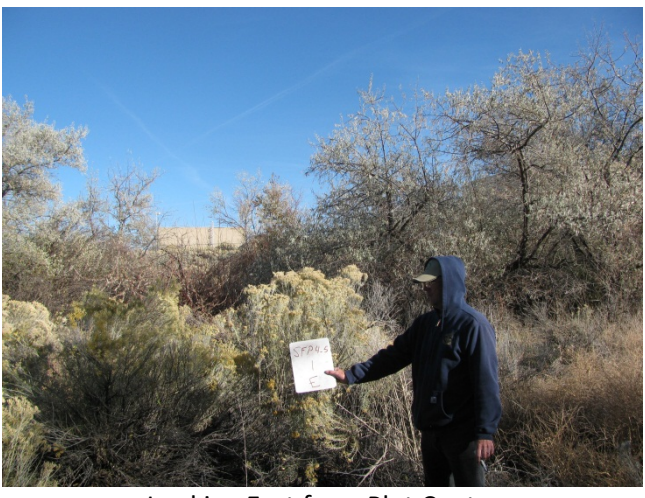
Looking East from Plot Center