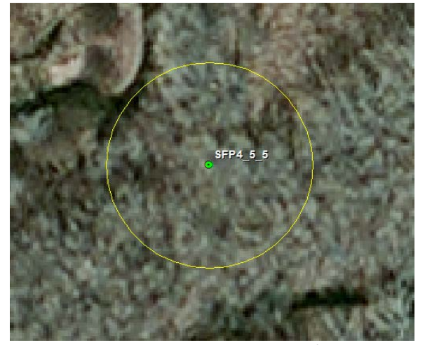
Mar 2011 Aerial View, Circle = 1/10 acre