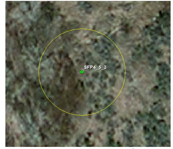
Mar 2011 Aerial View, Circle = 1/10 acre