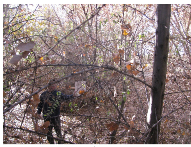
Looking West from Plot Center