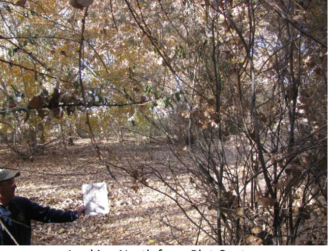
Looking North from Plot Center