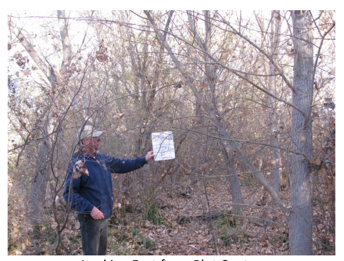
Looking East from Plot Center