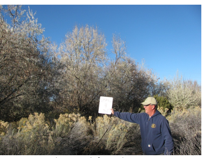
Looking North from Plot Center