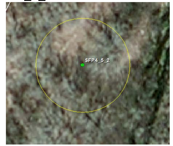
Mar 2011 Aerial View, Circle = 1/10 acre