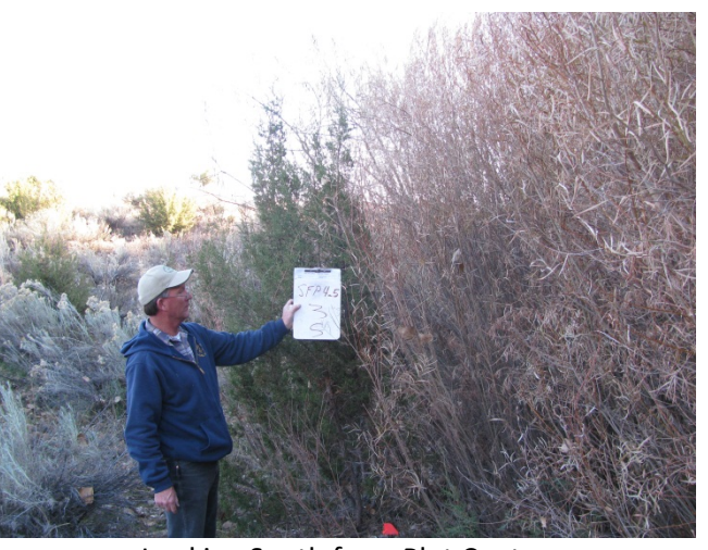
Looking South from Plot Center