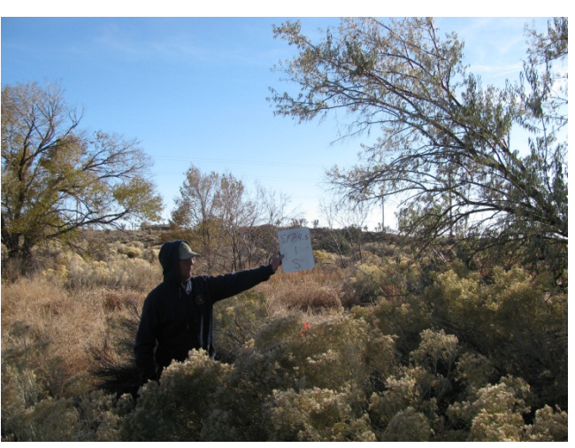
Looking South from Plot Center