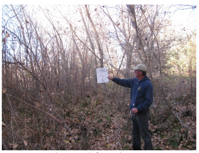
Looking North from Plot Center