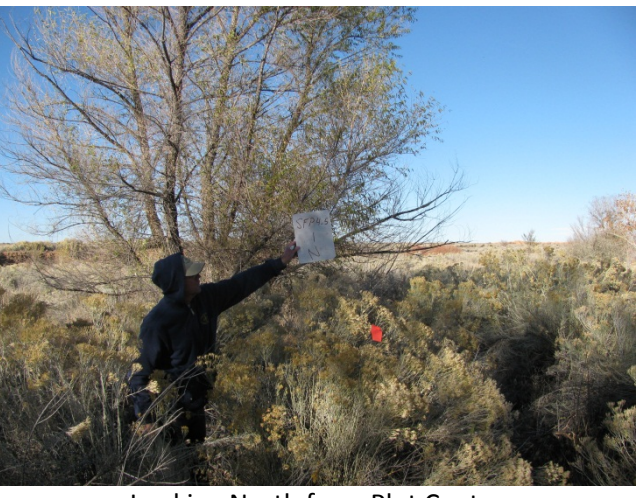
Looking North from Plot Center