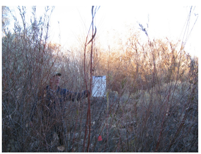
Looking North from Plot Center