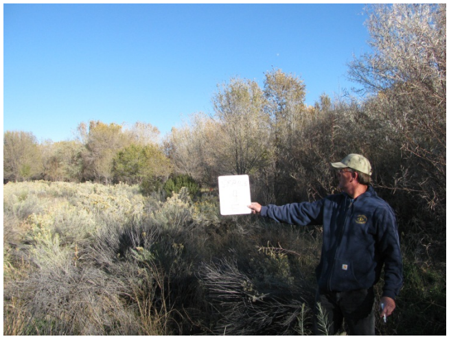
Looking East from Plot Center