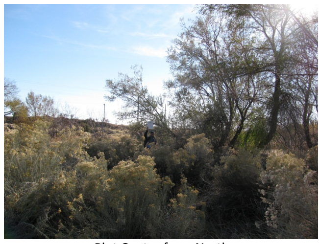
Plot Center from North