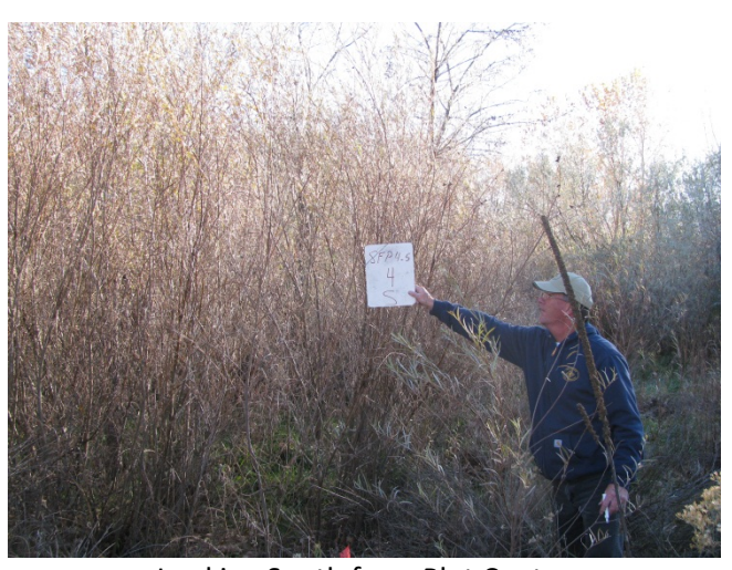
Looking South from Plot Center