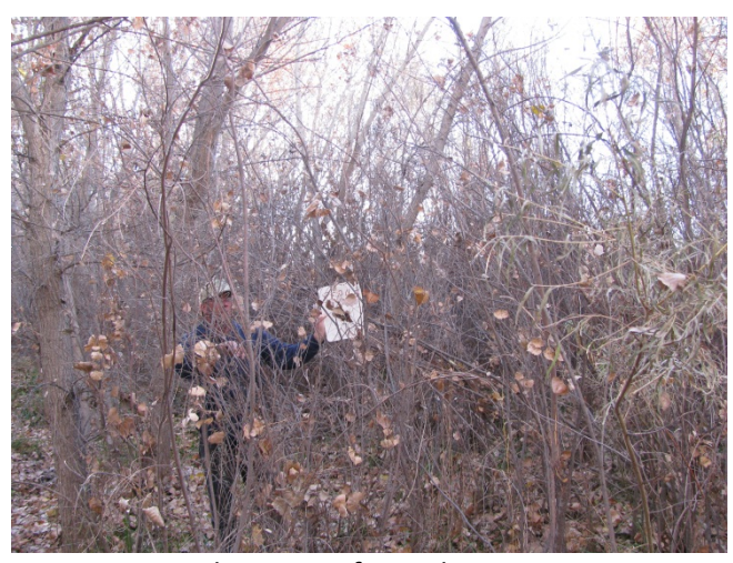
Looking West from Plot Center