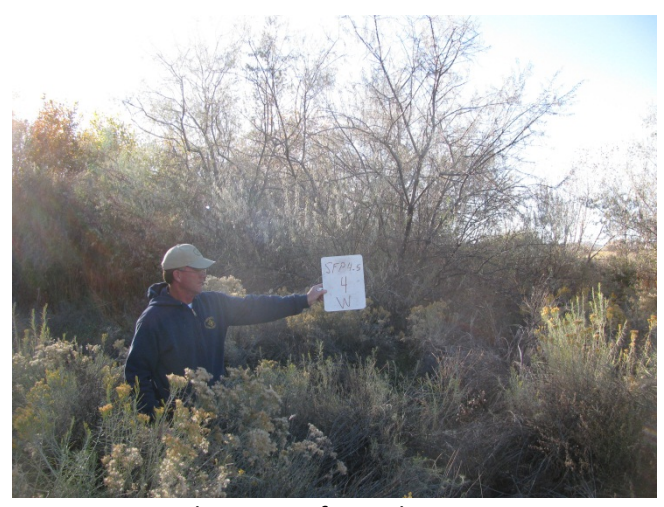
Looking West from Plot Center