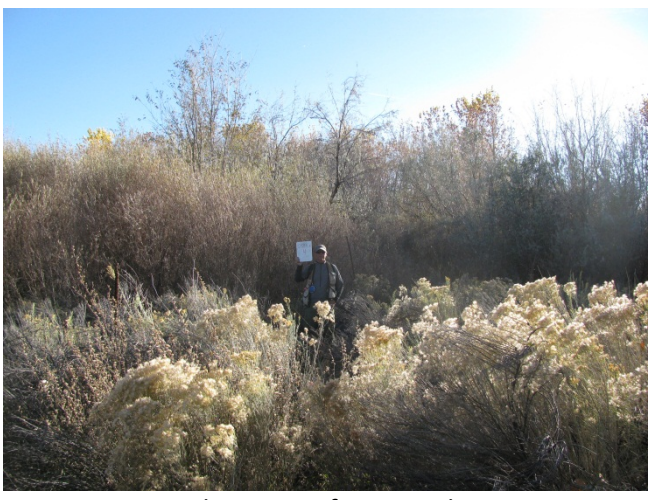
Plot Center from North