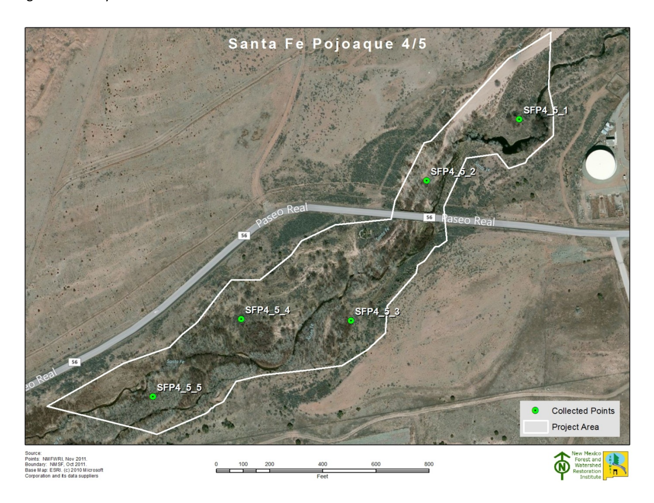
Figure 4. Close up view of Project Area 4/5 (pre-treatment) showing plot locations.

and 3. Identification of forb, grass and some shrub species was impacted by the limited plant identification skills of the monitoring team and by the season. Ducks were observed in the area and there was evidence of historic beaver activity.