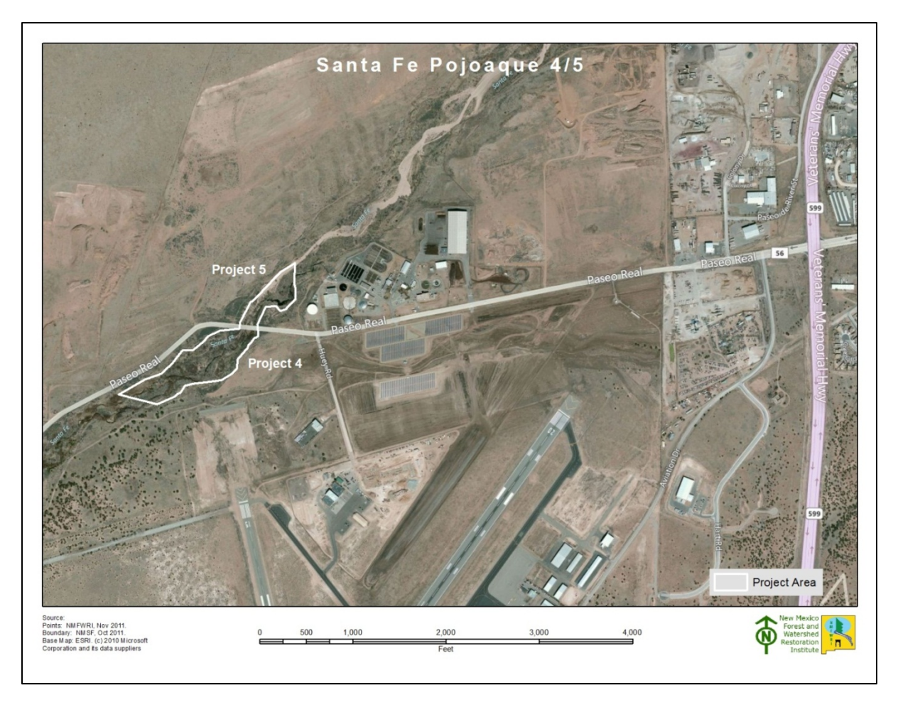
Figure 1. Project Location

Vegetation monitoring was conducted at this site on November 17, 2011 as part of a restoration project targeting non-native phreatophytes scheduled for winter 2011 – 2012. The project consists of two adjacent project sites totaling 15 acre, located within Santa Fe County, NM, south of the city of Santa Fe (see Figure 1 below). The project was sponsored by the Santa Fe - Pojoaque Soil and Water Conservation District. Restoration goals are to restore the area for wildlife with a mix of native species, to restore the area to a more natural condition with a more open canopy, and to remove exotic high water consumption plants to increase water presence in low-lying areas and drainages. (Stropki et al., 2010).