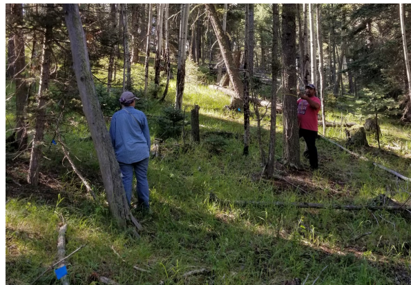
Monitoring on the Carson National Forest, 2017

Among the unique features of the CFRP is the monitoring mandate included in the law. All grantees must use a multi-party monitoring team to do the following: monitor short- and long- term ecological effects of the restoration treatments for at least 15 years (individual grantees must monitor pre-treatment and immediate post-treatment); use collected ecological data to identify the existing and desired future ecological conditions of the project area; and report on the impacts and effectiveness of their project and assess how effectively the project's stated goals are being met.