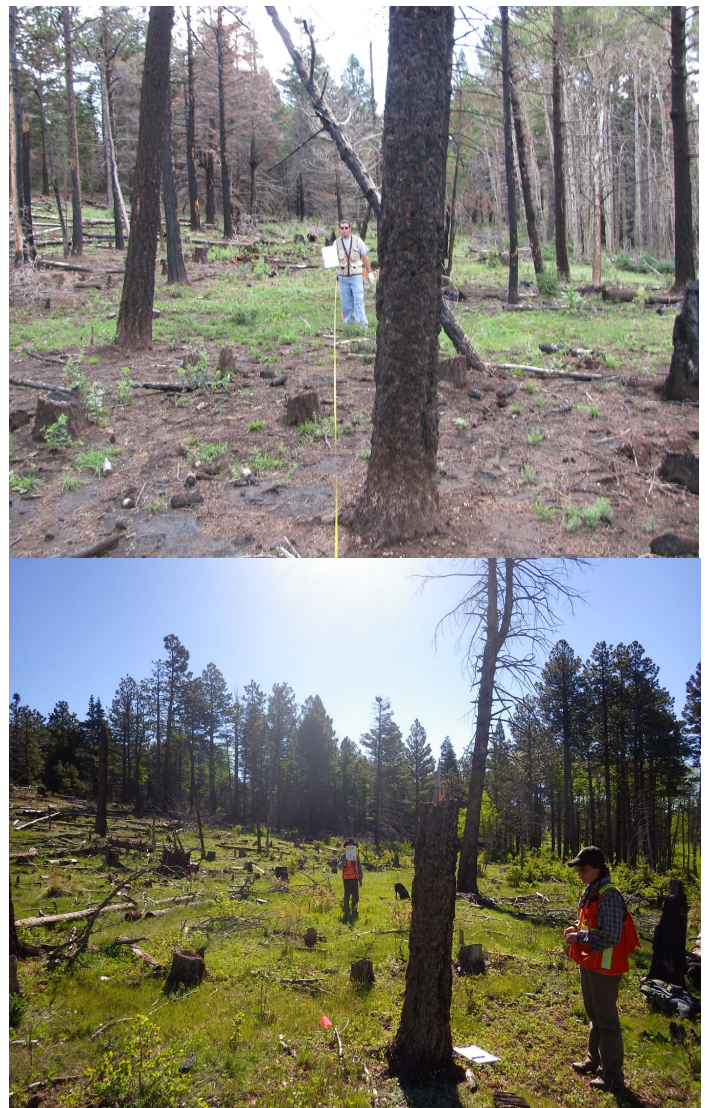
Photos from 5 years (top) and 10 years (bottom) post-treatment. The drastic changes over time represent a common challenge in CFRP data analysis.