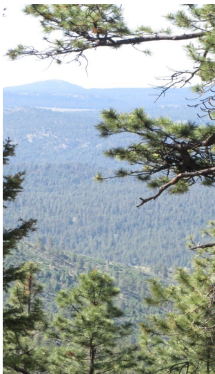
2016 Ensenada CFRP