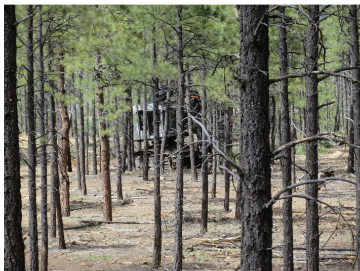
Mechanical harvesting equipment in a "dog hair" stand near Tierra Amarilla in 2016