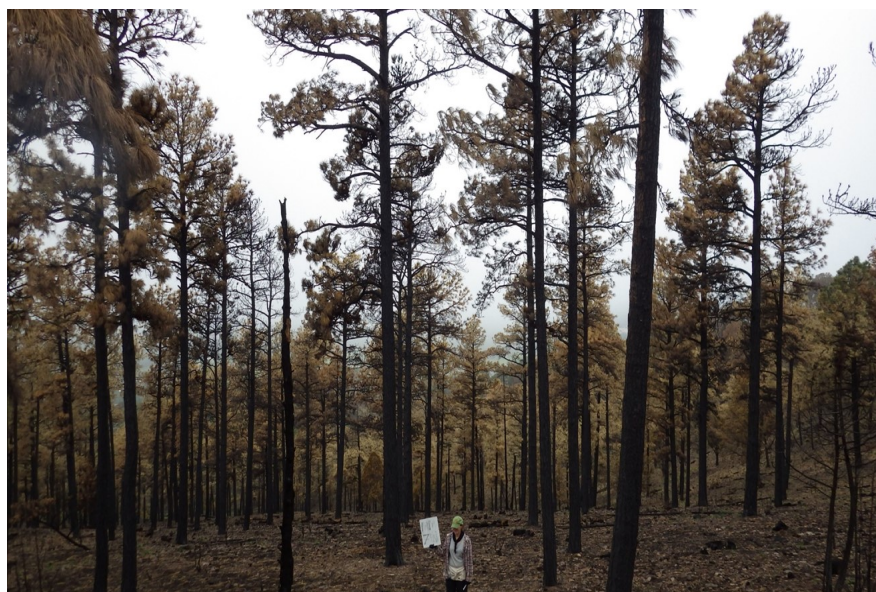
2016 Moon Mountain fire