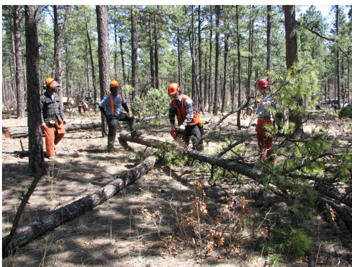
Hand crews working with chainsaws near San Ignacio in 2014

Prescribed fire (a fire lit under controlled conditions) is usually introduced after a restoration thin to safely reduce the fuel load and encourage natural nutrient recycling. It can occur as pile or jackpot burns (burning caches of material) or a broadcast burn which covers the landscape in a mosaic like a natural wildfire.