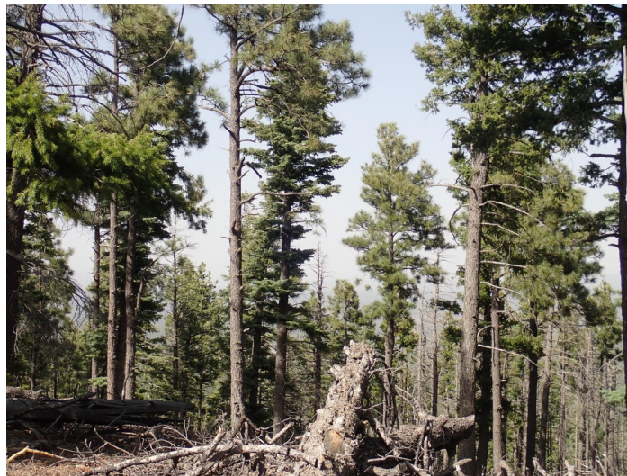
2019 Walker Flats CFRP

The New Mexico Forest and Watershed Restoration Institute (NMFWR I), which is located at New Mexico Highlands University, is a statewide effort that engages government agencies, academic and research institutions, land managers, and the interested public in the areas of forest and watershed management.