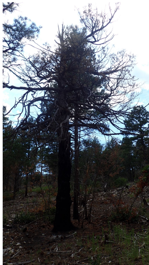
Mistletoe in ponderosa pine, 2018

There were several metrics which showed no significant impact of treatment, including tree height, live crown base, seedlings, shrubs, sick trees per acre, and surface fuels.