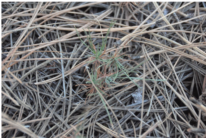
Natural ponderosa pine regeneration near Las Dispensas, 2017

The reforestation goal, assessed with the changes in live trees per acre and seedlings/sapling over time, did not see program-wide success. This may be because treatments did not create sufficient sunlight through the canopy to support regeneration. In addition, successful tree regeneration requires a combination of factors: good seed years, rainfall, and scarification among others. Only one CFRP project monitored by NMFWR I was noted as having excellent regeneration; this was so unusual in relation to the other projects that had to be removed from analysis as an outlier. Low regeneration rates are concerning as climate change impacts on forests are expected to worsen in the coming years.