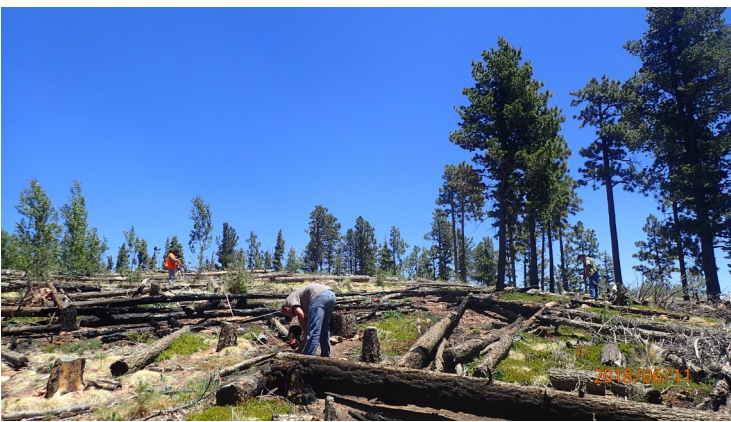
Post-treatment monitoring, 2018

Several metrics showed an initial trend toward restoration immediately post-treatment: lower trees per acre, taller average tree heights, increased quadratic mean diameter and so forth. The treatment was effective, it just did not last to the 10-year mark.