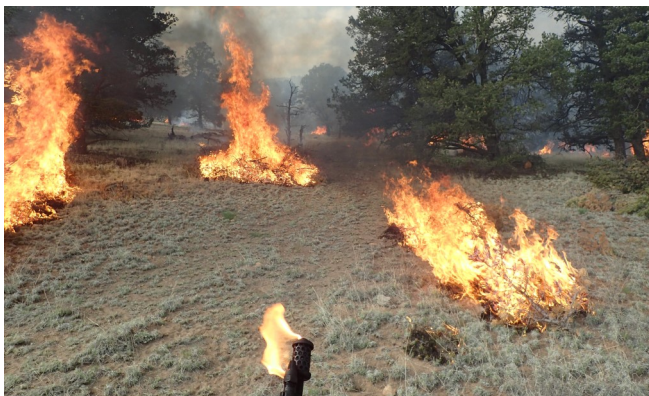
Prescribed fire on Luera Mountain, 2017

There is some evidence that forests are “escaping” back to near-pre-treatment states by 10 years post-treatment.