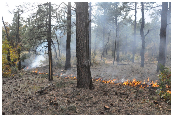
Prescribed Broadcast burn near Las Dispensas, 2016