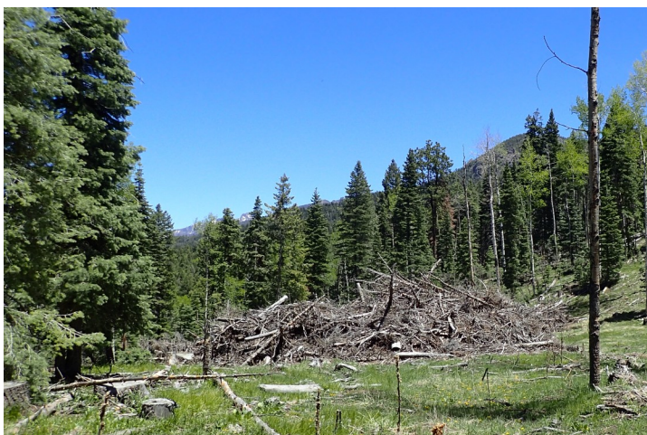
A "drop point" where material is cached during harvest for later removal as firewood or in a pile burn, near Chama, 2017