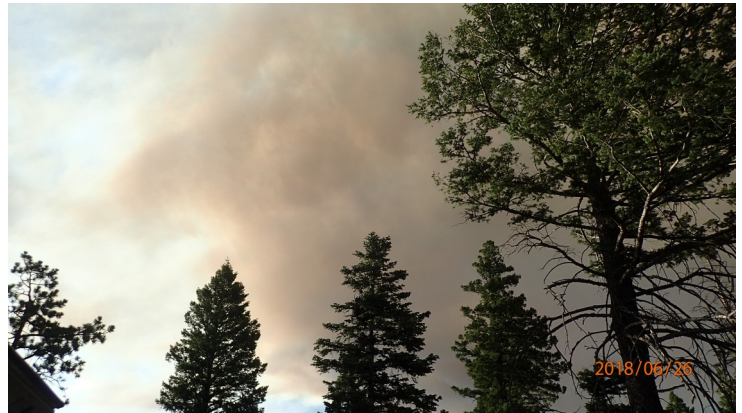
View from camp, June 2019 wildfire smoke

Back at camp, NMFWR crew boss Carmen Briones checks in with co-workers about the day's progress. "Honestly, I have never seen so many interesting trees. All kinds of diseases, deformities, weird shapes." After a day of working beneath spittlebug masses dripping down from the mistletoe in the ponderosa pine, the crews are sticky.