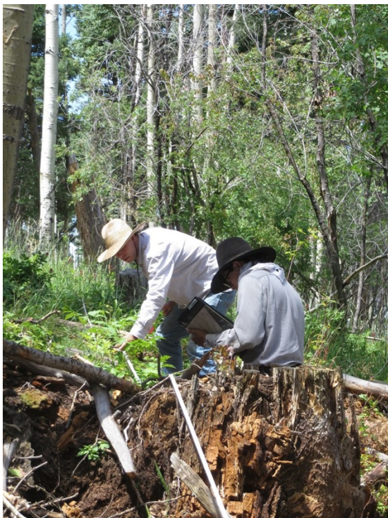
Recording fuels near Chama, 2016

The metrics used in ecological monitoring of CFRP projects include the following: