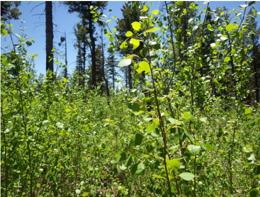
Aspen regeneration in a Wet Mixed-Conifer project, 2015