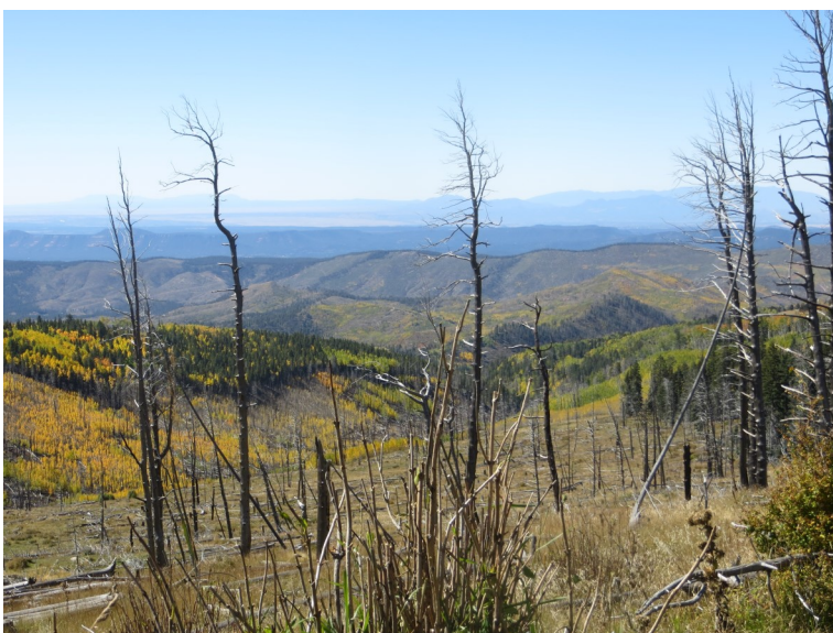
2011 view from Elk Mountain. The Viveash fire burned this area in 2000.

A legacy of fire suppression, logging, and overgrazing in New Mexico has left some forest-reliant communities with the following problems: