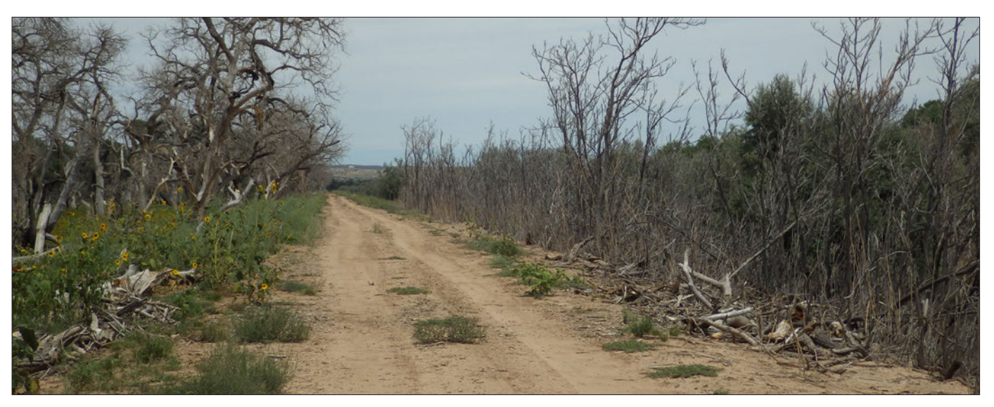
Tree-of-heaven (right), as well as cocklebur, Russian thistle and kochia are among the non-native species present following a fire on Sandia Pueblo.