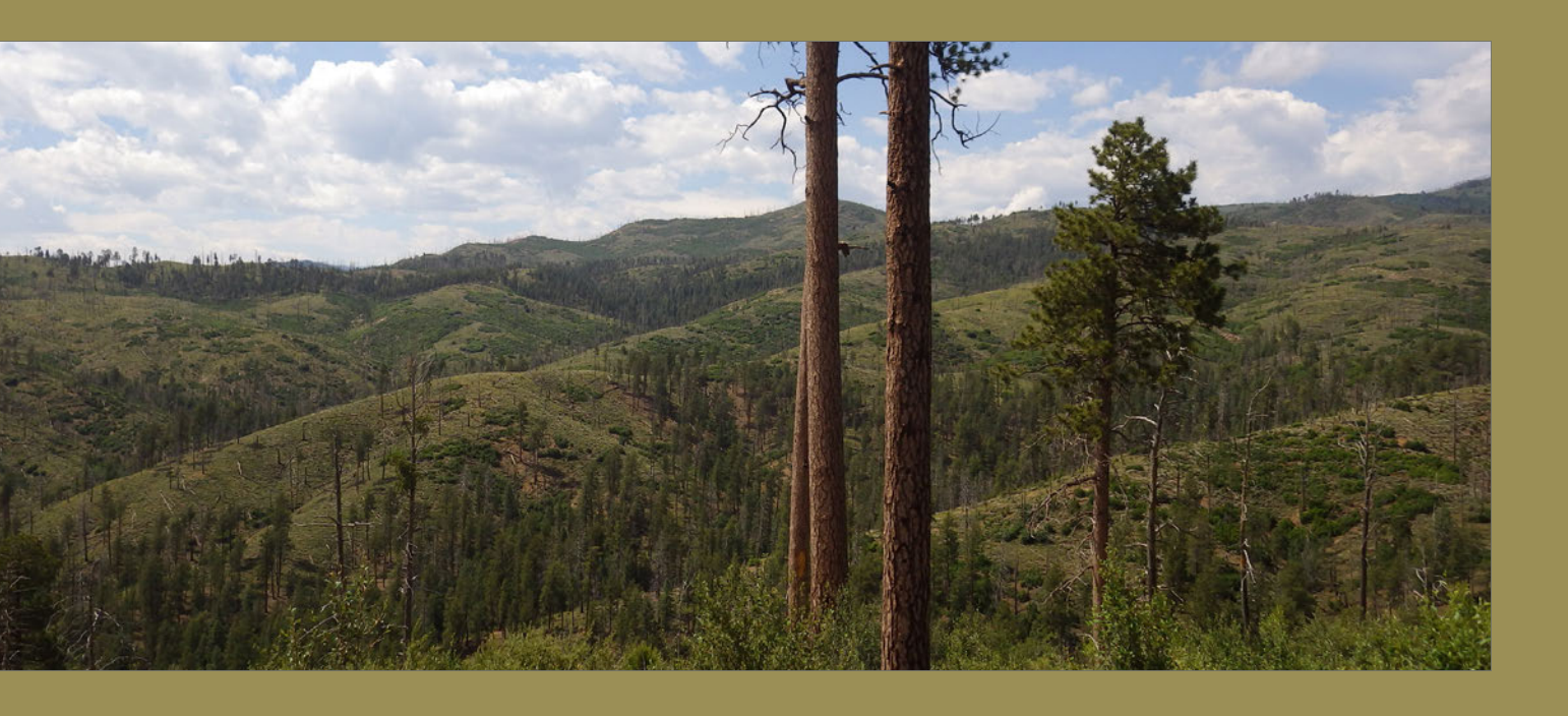
Forests and Watersheds A Newsletter for Decision-Makers

February 2016 New Mexico Forest and Watershed Restoration Institute