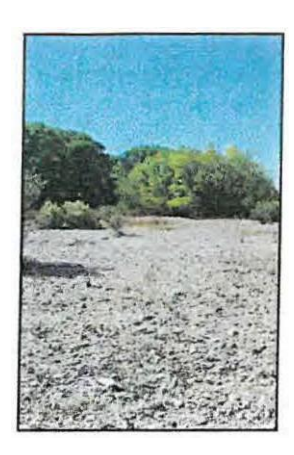
Type 7 -Sparse Vegetation/Bare Ground.

Bare ground, may include sparse woody or herbaceous vegetation, but total vegetation cover <10%. May be natural in origin (cobble bars) or anthropogenic in origin (graded or plowed earth) Photograph on Lower Gila River by Y. Chauvin, 2012.