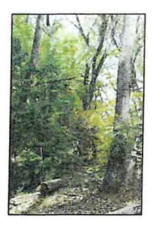
Type 1 – High Structure Forest with a well-developed understory.

Multiple-Story Communities (Woodlands/Forests)