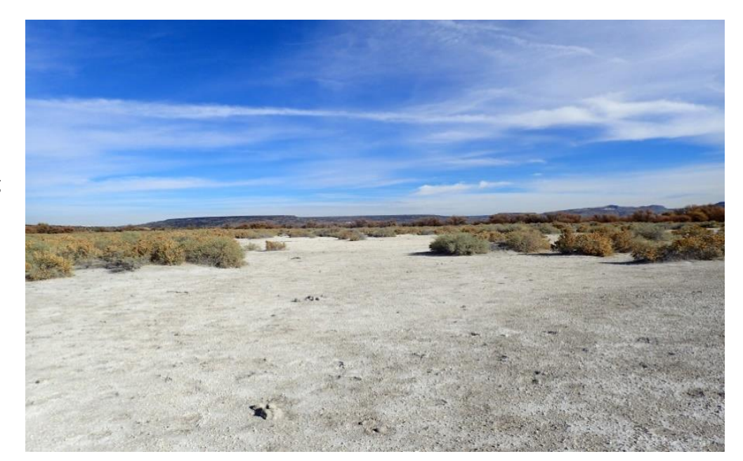
2016: 16.13_1_E. View facing east.