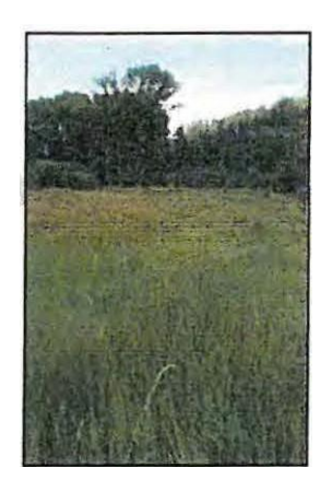
Type 6W-Herbaceous Wetland.

Short stature shrubs or very young shrubs and trees (up to 1.5 m [up to 4.5 feet]) covering >10% of the area of the community (polygon). Stands dominated by short woody vegetation, may include herbaceous vegetation underneath the woody vegetation. Photograph on Lower Pecos River by E. Lindahl, 2008.