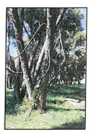
Type 2 -Low Structure Forest with little or no understory.

Tall mature to intermediate-aged trees (>5 m [>15 feet]) with canopy covering >25% of the area of the community (polygon) and understory layer (0-5 m [0-15 feet]) covering >25% of the area of the community (polygon). Substantial foliage is in all height layers. (This type incorporates Hink and Ohmart structure types 1 and 3.)