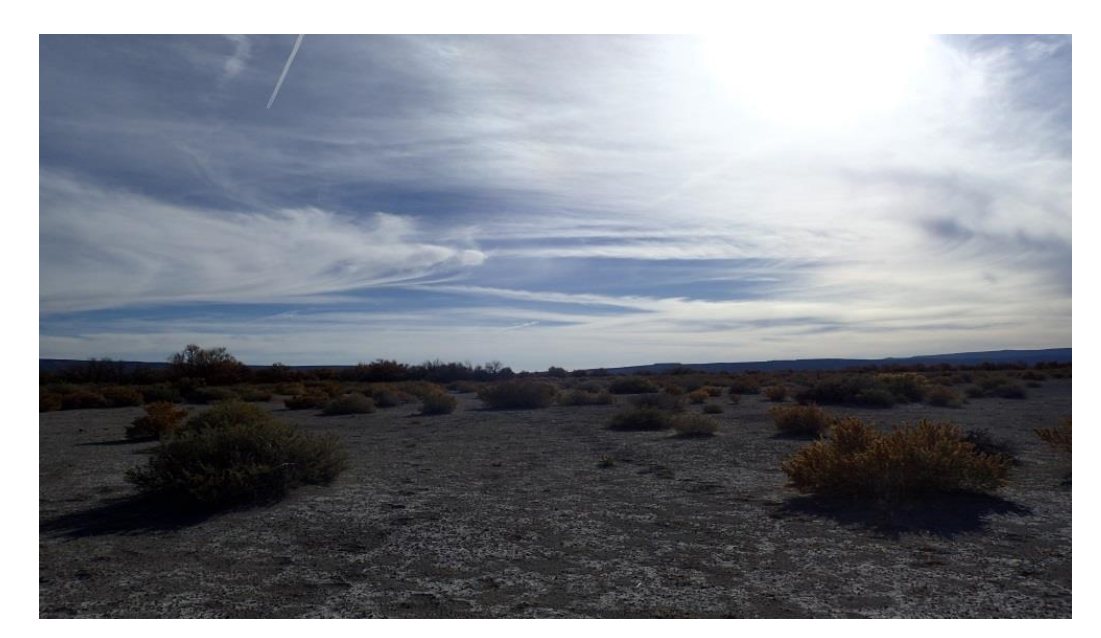
2016: 16.13_1_S. View facing south.