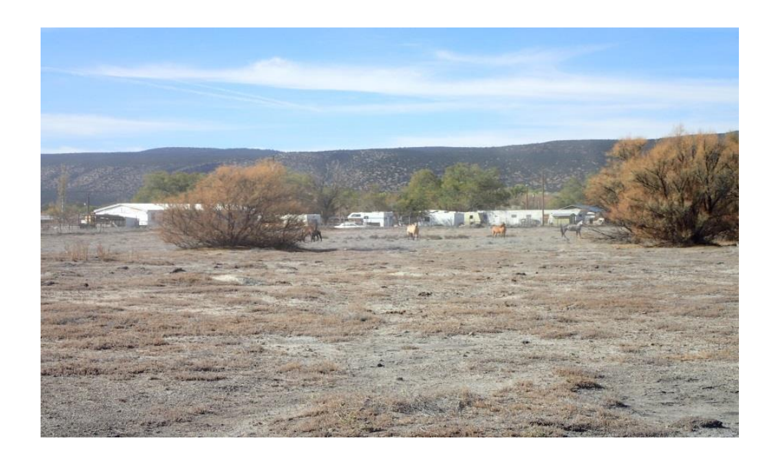
2015: 16.13_2_SW. View facing south-west.