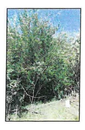
Type 5 - Tall Shrub Stands.

Single-story Communities (Shrublands, Herbaceous and Bare Ground)