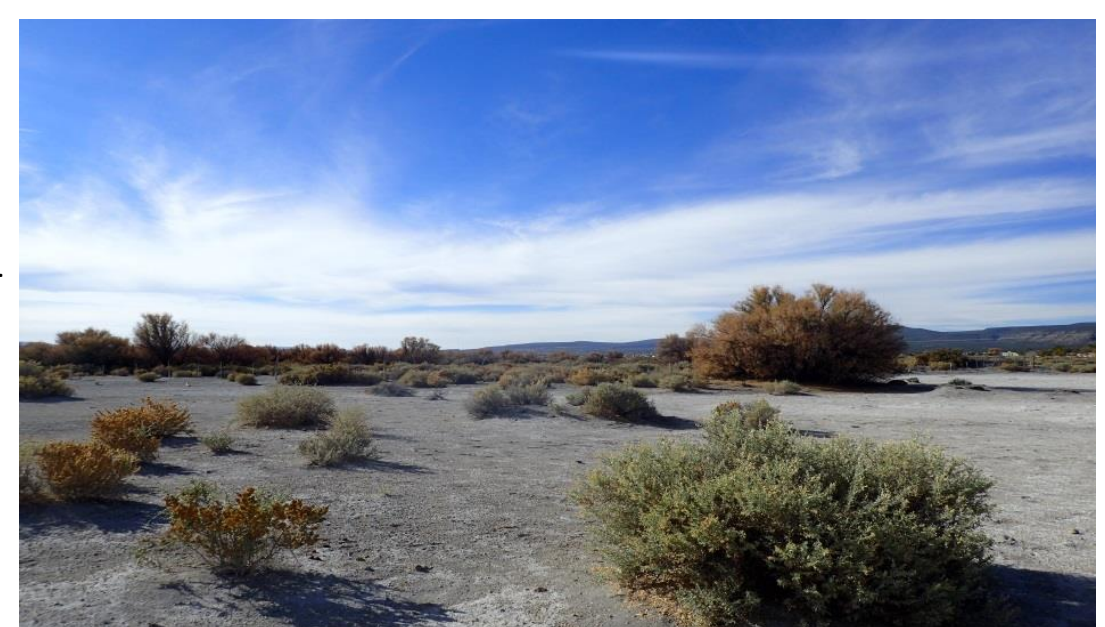
16.13: 16.13_1_W. View facing west.