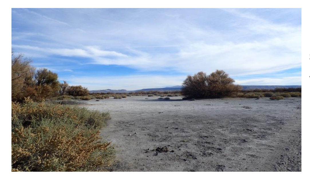
2016: 16.13_1_N. View facing