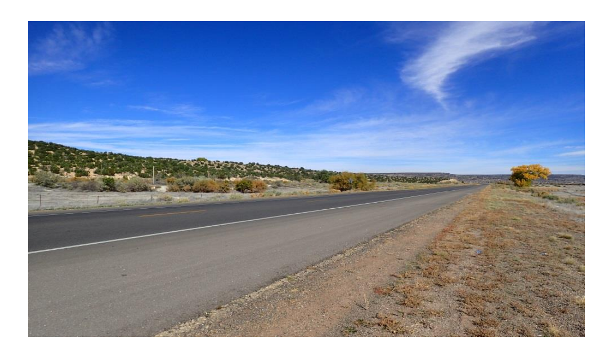
2015: 16.13_2_N W. View facing northwest.