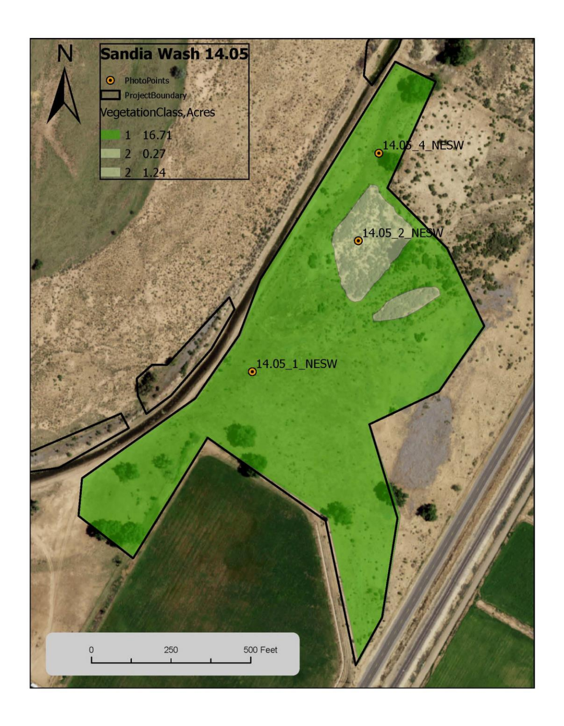
Figure 2. 14.05 Sandia Wash photopoints.