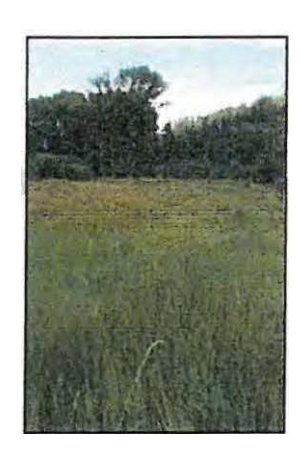
Type 6W- Herbaceous Wetland.

4.5 feet]) covering >10% of the area of the community (polygon). Stands dominated by short woody vegetation, may include herbaceous vegetation underneath the woody vegetation. Photograph on Lower Pecos River by E. Lindahl, 2008.