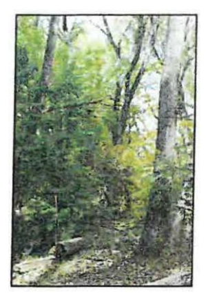
Type 1 – High Structure Forest with a well-developed understory.

Multiple-Story Communities (Woodlands/Forests)